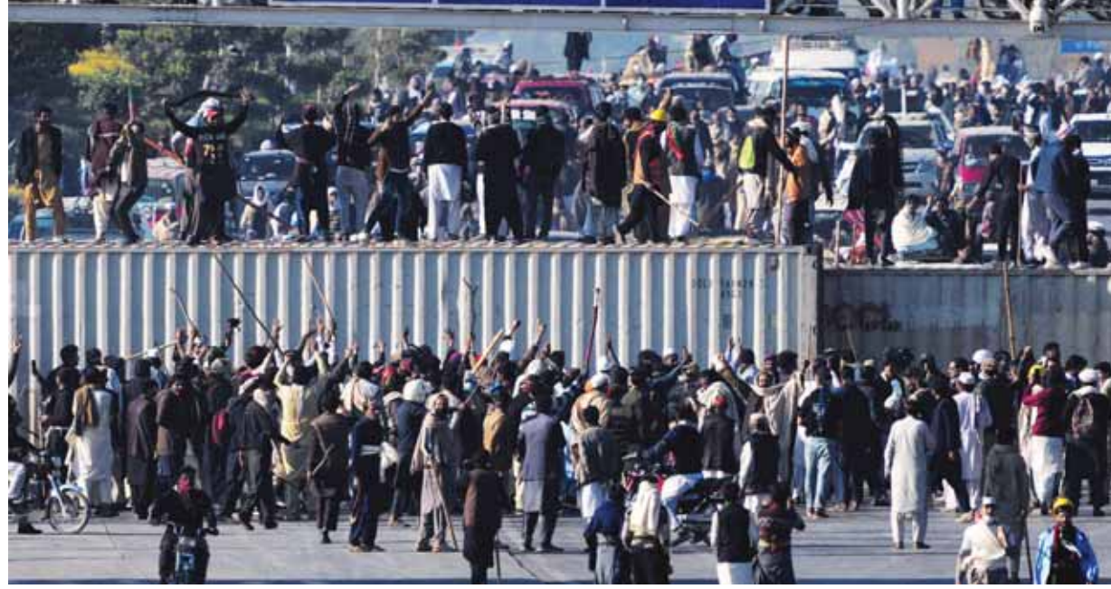
Supporters of imprisoned former premier Imran Khan's Pakistan Tehreek-e-Insaf party, gather to remove shipping containers to clear way for their rally demanding Khan's release, in Islamabad on Tuesday. (Right) A supporter Imran Khan's party aims to throw stones with slingshot following police fire tear gas shell to disperse them during clashes.

of the Pakistan Tehreek-e-Insaf (PTI) had vowed to remain in Islamabad until Khan was released. Khan's wife Bushra Bibi, who stubbornly led the protests, said in one of her addresses to the protestors to go away only if Khan comes in person to tell about the next course of action. They reached their declared destination despite repeated claims by Interior Minister Mohsin Naqvi that nobody would be allowed to make it to D-Chowk. Naqvi also said the government tried to convince PTI leaders in every way, but they only gained time from negotiations and moved towards the federal capital. "We offered the protestors to gather at Sangiani. Their entire leadership does not want a bloodbath, but there's one secret leadership controlling all this, which was the apple of the discord," he said. He also said that all PTI supporters had come from Khyber Pakhtunkhwa. Led by Khyber-Pakhtunkhwa Chief Minister Ali Amin Gandapur and Khan's wife Bushra, the marchers began their journey from the militancy-hit province on Sunday. Pakistan deployed the army amid a tense stand-off with Khan's supporters. The government has vowed to foil their attempt "even if a curfew needs to be imposed." Hours earlier, the state-run Radio Pakistan said a vehicle