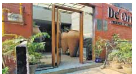
Pieces of broken window glass lie on the floor after an explosion outside a club in Chandigarh

political arena? Your area of work is very different," the Bench retorted. After Paul revealed he had been to over 150 countries, the Bench asked him whether each of the nations had ballot paper voting or used electronic voting. The petitioner said foreign countries had adopted ballot paper voting and India should follow suit. "Why you don't want to be different from the rest of the world?" asked the Bench. There was corruption and in June 2024, the Election Commission announced they had seized Rs 9,000 crore, Paul responded. "But how does that make your relief which you are claiming here relevant?" asked the Bench, adding "if you shift back to physical ballot, will there be no corruption?". Paul claimed CEO and co-founder of Tesla, Elon Musk, stated that EVMs could be tampered with and added TDP chief N Chandrababu Naidu, the current chief minister of Andhra Pradesh, and former state chief minister YS Jagan Mohan Reddy had claimed EVMs could be tampered with.