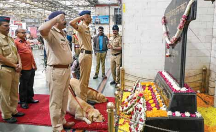
Police officers with their dogs pay tribute to the martyrs of the 26/11 Mumbai terror attacks on its anniversary