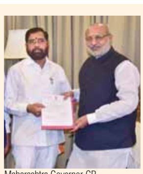
Maharashtra Governor CP Radhakrishnan receives Shiv Sena leader Eknath Shinde's resignation as Chief Minister