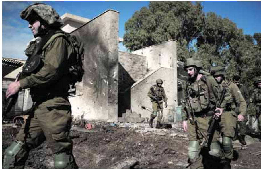
Israeli soldiers inspect the site where a rocket fired from Lebanon landed in a backyard in Kiryat Shmuna, northern Israel on Tuesday.

expressed growing optimism over a ceasefire, Israel has continued its campaign in Lebanon, which it says aims to cripple Hezbollah's military capabilities. Israeli jets struck at least six buildings in Beirut's southern suburbs Tuesday. One strike slammed near the country's only airport, sending large plumes of smoke into the sky. There were no immediate reports of casualties. The airport has continued to function despite its location on the Mediterranean coast next to the densely populated suburbs where many of Hezbollah's operations are based. Other strikes hit in the southern city of Tyre, where the Israeli military said it killed a local Hezbollah commander. The Israeli military also said its ground troops reached parts of Lebanon's Litani River - a focal point of the emerging ceasefire. It said troops clashed with Hezbollah forces and destroyed rocket launchers in the Slouji area on the eastern end of the Litani, just a few km from the border. Under the ceasefire deal, Hezbollah would be required to