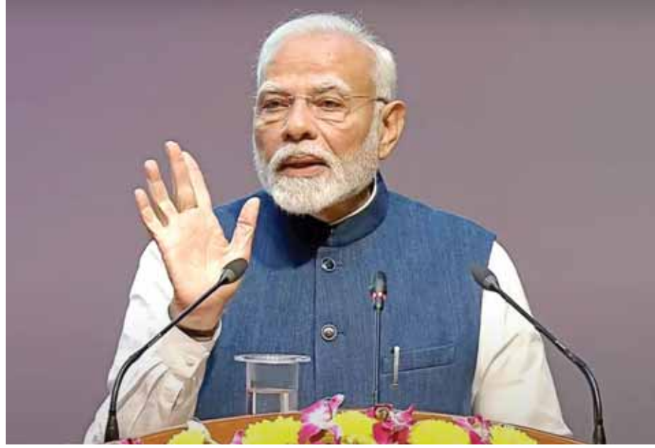
Prime Minister Narendra Modi addresses a gathering during Constitution Day celebrations at the Supreme Court

Hailing the Constitution as a "living stream", Prime Minister Narendra Modi on Tuesday said the sentiment of 'nation first' will keep the Constitution alive for centuries to come. Recalling the words of President Rajendra Prasad in his concluding address to the Constituent Assembly on November 26, 1949, PM Modi said he had stated that India does not need anything more than a group of honest people who will keep the country's interests above their own. Addressing an event marking Constitution Day celebrations at the Supreme Court, Modi said the Constitution has now been fully implemented in Jammu and Kashmir and Constitution Day was celebrated there for the first time. "Our Constitution makers knew that India's aspirations, India's dreams will reach new heights with time. They knew that the needs of Independent India and its citizens will change, challenges will change. That is why they did not leave our Constitution as just a mere book of laws. Rather, they made it a living, continuously flowing stream," Modi said, adding that the Constitution is acting as a "guiding light" at a time when India is going through a period of transformation. "Today every citizen of the country has only one goal, to build a developed India," he said at the event which was attended by Law Minister Arjun Ram Meghwal, Chief