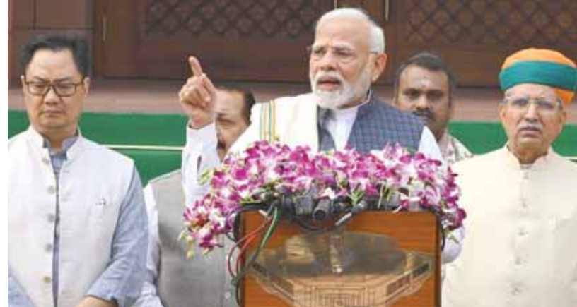
Prime Minister Narendra Modi addresses the media on the first day of the Winter session of Parliament, in New Delhi on Monday. Union Minister for Parliamentary Affairs Kiren Rijju and Ministers of State Jitendra Singh, Arjun Ram Meghwal and L. Murugan are also seen.