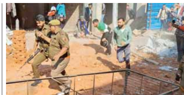
People protesting against a proposed ropeway project along the trek route to the Vaishno Devi shrine clash with police personnel, at Katra in Reasi district.

"With this spirit, I once again invite and welcome all esteemed members of Parliament to approach this session with enthusiasm and vigour," the PM said. He added that the current session of Parliament was special in many ways, with the most significant aspect being the 75-year journey of the Constitution. Congress president Mallikarjun Kharge expressed dismay over the Chair in both Houses of Parliament disallowing the opposition to raise under Rule 267 the issue of corruption allegations against the Adani Group and said the government should "let the truth come out" as the matter is affecting the country's image.