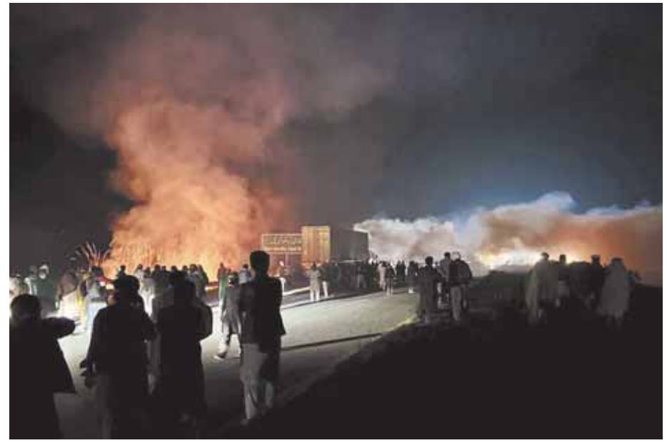
Supporters of Pakistan Tehreek-e-Insaf party, burn bushes to reduce the impact of tear gas shells fired by police officers to disperse them during a rally demanding Khan's release, at a motorway in Ghazi in Attock district, Pakistan