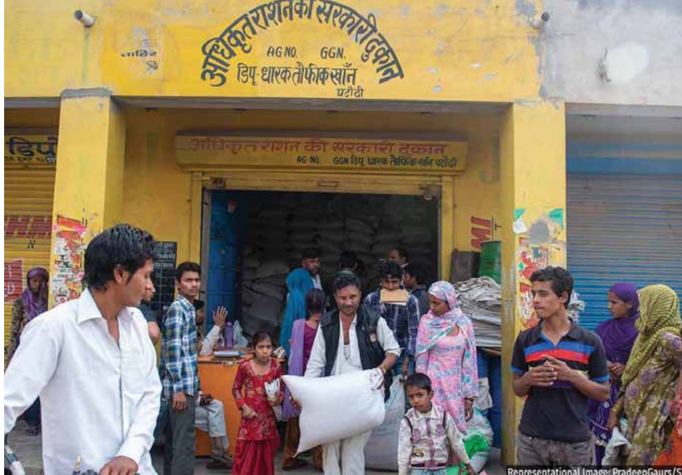
Representational Image: Pradeep/Gaury/Sh

From January 1, 2023, it merged the free part of PMGKAY with the regular food security schemes under NFSA. Now, food is available to all 820 million beneficiaries for free under the new incarnation of NFSA, the PMGKAY. As Prime Minister Narendra Modi announced in November 2023, this arrangement will continue for five years until the end of CY 2028. During the financial year (FY) 2022-23, the Centre's expenditure on food subsidy was Rs 272,000 crore. Apart from expenses under PMGKAY for the whole of that FY, this amount also included the subsidy on food grain given under NFSA at the subsidised price of Rs 2/3/1 per kg for wheat/rice/coarse cereals from April to December 2022. Within this total expenditure, how much money was lost due to pilferage? How does the Study reach Rs 70,000 crore? The authors look at the 'economic cost' (EC) of rice and wheat. This is the MSP paid to farmers plus HDC. During 2022-23, this was Rs 36.7 per kg or Rs 36,700 per ton for rice and Rs 25.9 per kg or Rs 25,900 per ton for wheat. Multiply the pilfered quantity of rice 17 million tons by its EC, we get the cost of its pilferage Rs 62,390 crore. Likewise, multiply 3 million tons of pilfered wheat by its EC, and the cost comes to Rs 7770 crore. Thus, the total cost was around Rs 70,000 crore. This