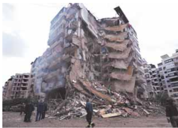
Residents gather in front of a destroyed building that was hit Sunday night in an Israeli airstrike in Dahiyeh, in the southern suburb of Beirut, Lebanon

The Israeli ambassador to Washington says that a cease-fire deal to end fighting between Israel and the Lebanon-based Hezbollah could be reached "within days."