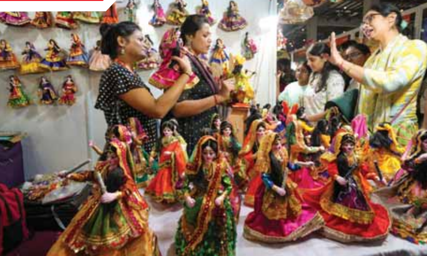
Visitors at a stall at the International Trade Fair at Pragati Maidan, in New Delhi