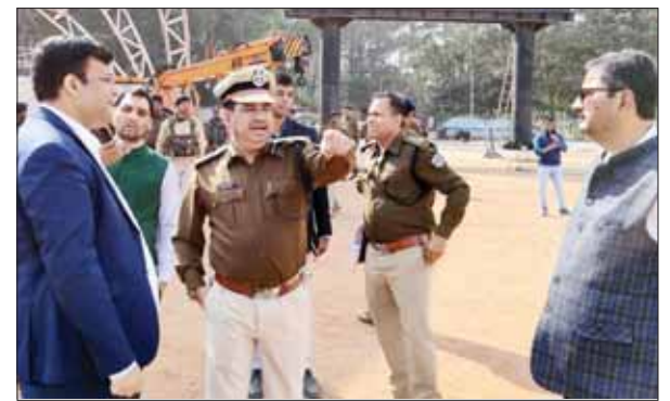
Administrative officials inspecting the oath taking ceremony venue at Morhabadi ground in Ranchi on Monday.

Meanwhile, Ranjan held a meeting on Monday regarding the preparations for the swearing-in ceremony of the Chief Minister and the members of the Council of Ministers. All the top officials of the district administration were present in this meeting. In this meeting, a detailed discussion was held regarding the swearing-in ceremony of the Chief Minister and the members of the Council of Ministers. Leaders of the major parties