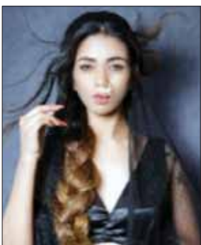
BY RACHNA TIWARI

The modeling industry, long associated with runway shows and high-fashion photo shoots, is undergoing a significant transformation. Today's models are no longer confined to fashion magazines; they are expanding their roles to embrace a wide range of new and exciting opportunities. From fitness modeling and beauty blogging to brand ambassadorship and philanthropy, models