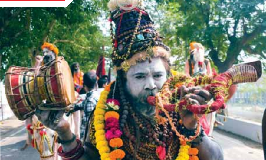
A monk of Panch Dashnam Avahan Akhara during 'Nagar Praveshi' procession, in Prayagraj