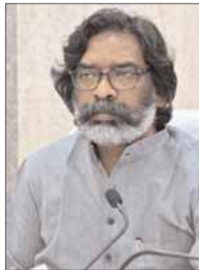
Minister and current BJP state president, is contesting from Dhanwar. In 2019, he won the seat as a JMM candidate. This time, he faces stiff competition from JMM and CPI(M) rivals.