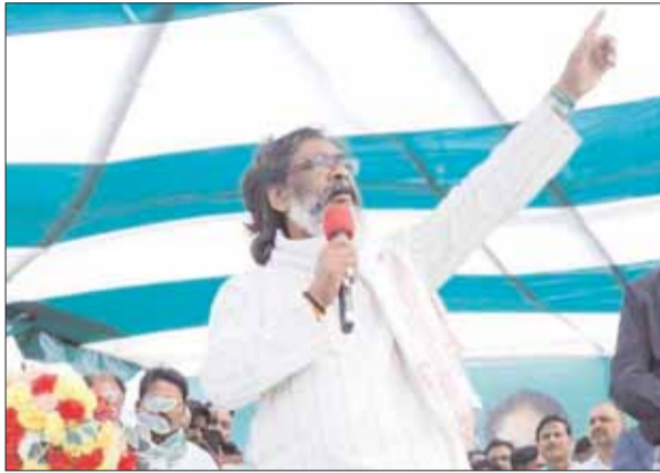
Jamtara, Basant Soren (JMM), contesting from Dumka and Hemant Soren's wife, Kalpana Soren, JMM candidate for Gandey.

Other key candidates are Champai Soren, contesting from Seraikella, Congress leader Dr Irfan Ansari facing JMM's Sita Soren in