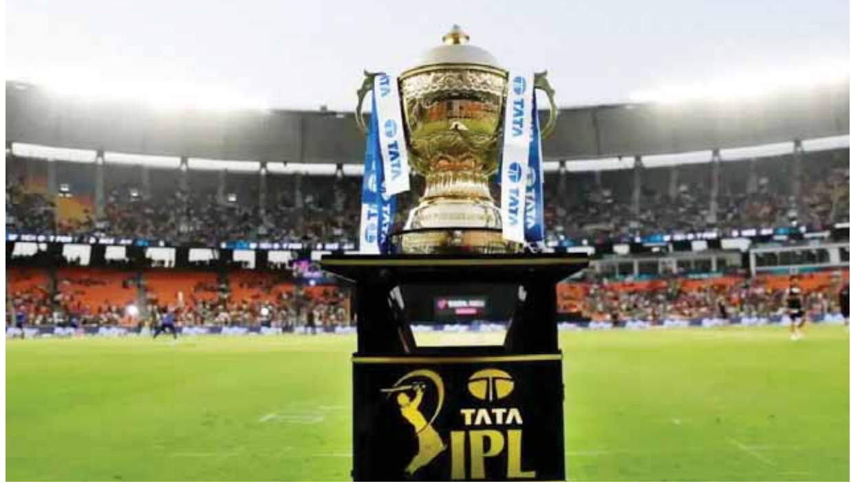
has been scheduled for May 31. The 2027 edition will once again start on March 14 with the final on May 30. All three finals will be held on Sundays. The BCCI had plans to increase the number of