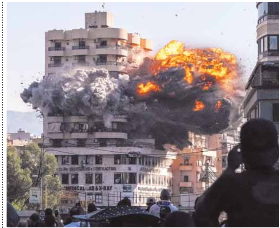
Smoke and flames erupt from a building hit in an Israeli airstrike in Chiyah, in the southern suburb of Beirut, Lebanon, on Friday.

the International Criminal Court’s arrest warrants for Israeli Prime Minister Benjamin Netanyahu and others, saying that the court’s rulings are “insignificant” for Russia, which doesn’t recognise the court’s jurisdiction. The ICC last year issued an arrest warrant for Russian President Vladimir Putin and a number of other top Russian officials, accusing them of war crimes in Ukraine. The Kremlin has brushed off the warrants, saying that in Moscow’s eyes they’re “null and void.” Asked if the ICC warrants for Netanyahu and others can help resolve the tensions in the Middle East, Peskov said: “Well, in general, the actions of the ICC are unlikely to help anything. That’s the first thing. And secondly, we don’t see any point in commenting on this in any way, because for us these rulings are insignificant.”