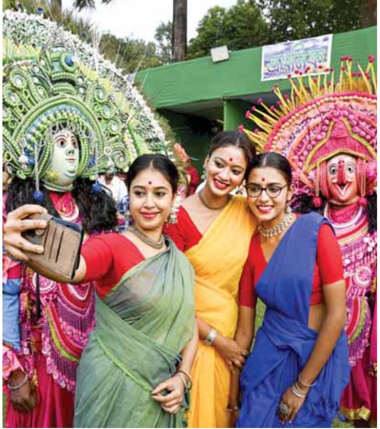
Artists take selfies during 'Jangal Mahal Utsav', a festival to promote tribal arts and culture, in Kolkata.