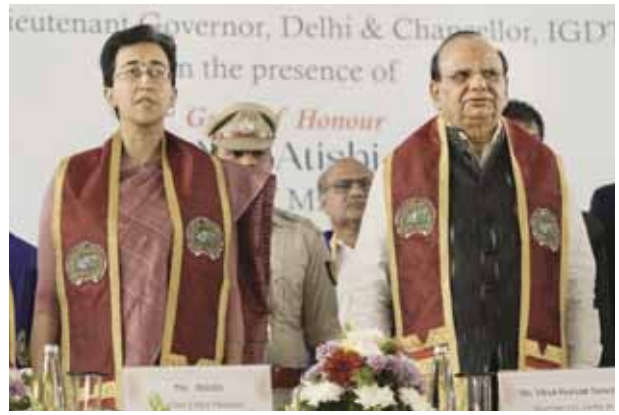
Delhi Lt. Governor Vinai Kumar Saxena, Chief Minister Atishi, Vice Chancellor of the Indira Gandhi Delhi Technical University for Women (IGDTUW), in New Delhi.

In a rare gesture, Lieutenant Governor Vinai Kumar Saxena praised Delhi Chief Minister Atishi on Friday, and said she is "a thousand times better" than her predecessor Arvind Kejriwal. The praise of Atishi comes amidst a backdrop of political friction between the Aam Aadmi Party (AAP) government and the LG over a range of issues, including governance, air pollution, and control of bureaucracy ever since he attained the office at Raj Niwas. These remarks have set the political circles abuzz about the CM's future since her former cabinet colleague Kailash Gehlot, once close to AAP supreme, was also reportedly favoured by the L-G who just quit the party and joined BJP. LG Saxena made the remarks during the convocation ceremony of the Indira Gandhi Delhi Technical University for Women in the national Capital. "I am happy