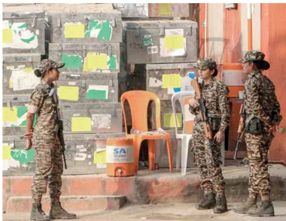
Security personnel stand guard outside a strong room ahead of the counting of votes for the Maharashtra Assembly elections, in Nagpur, Maharashtra.

One-and-a-half months after an interesting day of counting of votes for the Haryana Assembly elections which ultimately retained the Bharatiya Janata Party (BJP) government for a third straight term with initial trends showing a massive lead by Congress, another season of a bitterly contested election, in Maharashtra, and Jharkhand, as well as bypolls in Wayanad Lok Sabha seat, and Assembly segments in Uttar Pradesh, will conclude on Saturday afternoon with the declaration of results. While Wayanad is set to pave the way for Congress candidate Priyanka Gandhi to Lok Sabha who shall join her brother Rahul and mother Sonia in the Parliament, stakes are high for BJP-led National Democratic Alliance (NDA), and Congress-led INDIA bloc in both states, as well as a battle of prestige in the by-polls of Punjab, Kerala, Uttarakhand, and a crucial one in Uttar Pradesh, post the BJP's dismal performance in this year's General Elections. The results of Uttar Pradesh by-polls will be a huge contributing factor in setting a narrative for the next Assembly polls in the state, due in 2027. By-elections to 48 Assemblies constituencies and two Parliamentary constituencies spread across 15 states were also held simultaneously. The Elections for the 81-seat Jharkhand Assembly took place on November 13 and 20, while Maharashtra, which has 288