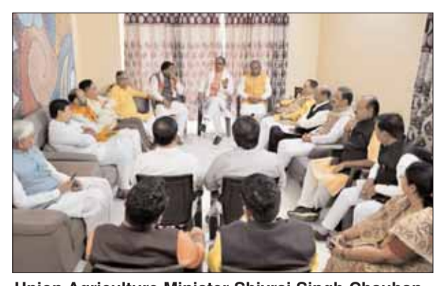
Union Agriculture Minister Shivraj Singh Chauhan and State BJP President Babul Marandi hold a meeting with party officials at the party office in Ranchi on Thursday.

Chouhan plants 50 saplings during his stay in Jharkhand He has planted more than 4000 saplings so far under this campaign. During his stay in Jharkhand, the Union Minister planted saplings with the people here in various cities of Jharkhand including Ranchi, Jamshedpur, Netarhat, Deoghar, Bokaro, Dhanbad. There were many such occasions when