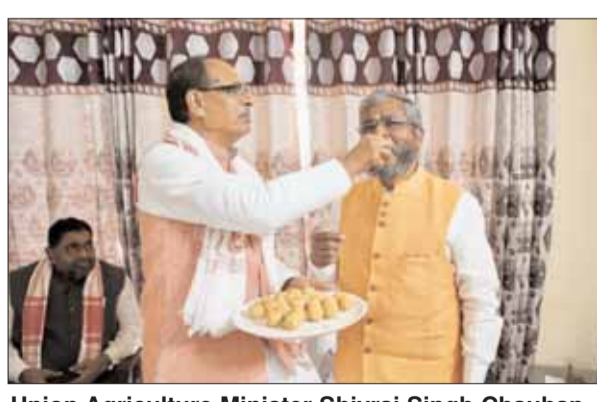
Union Agriculture Minister Shivraj Singh Chauhan offers sweets to State BJP President Babul Marandi after a meeting at BJP office in Ranchi on Thursday.