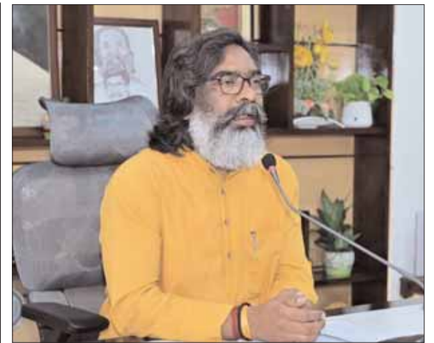
Chief Minister Hemant Soren addresses party workers through video conferencing at his official residence in Ranchi on Thursday.

He said that counting centers have been set up in all the 24 district headquarters of the state. Counting of votes will start from 8 am on November 23. First of all, the postal ballots will be counted. Counting of EVM votes will start from 8.30 am.