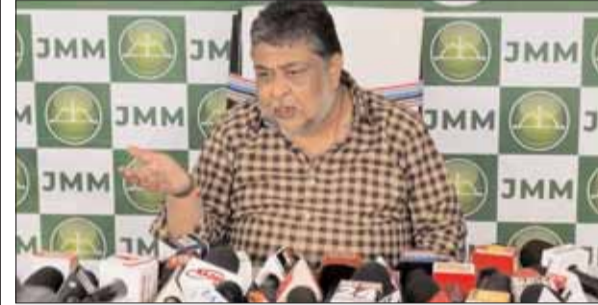
JMM General Secretary Supriyo Bhattacharya during a press conference at the party office in Ranchi on Thursday.

PNS : RANCHI The Jharkhand Mukti Morcha (JMM) unveiled its own version of an exit poll today, calling it the "people's view," and confidently projected a comfortable victory in the 2024 Jharkhand Assembly elections.