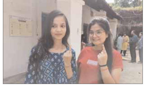
Young voter showing their inked finger after casting their vote in Ranchi on Wednesday.

In some of the state's Naxal-affected areas, voter enthusiasm overshadowed fears of violence. As polling opened, voters showed confidence in the democratic process, leaving their homes to line up at polling stations.