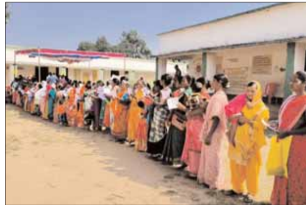
Women stand in a long queue to cast their votes at a polling booth in Lohardaga on Wednesday.

in Kurumgarh of Gumla district, where voting took place for the first time after the formation of Jharkhand state. Due to being highly affected by insurgency, the voters were deprived of their franchise. But this time voters are exercising their franchise at all the polling booths. A different kind of enthusiasm is