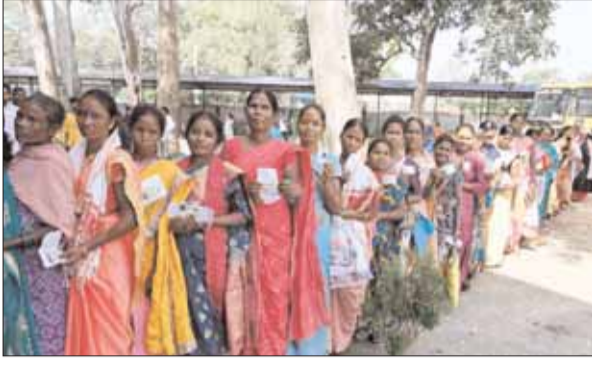
Voters stand in a long queue to cast their votes at a polling station during the first phase of Jharkhand State Assembly elections in Ranchi Jharkhand on Wednesday.