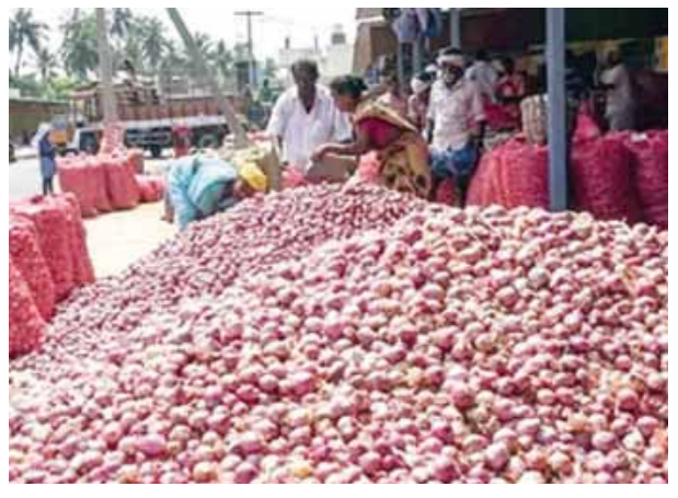
per kg in Nashik. Onions are not produced in Odisha and hence, the state is dependent on other states. Prices of onion and garlic are high outside the state