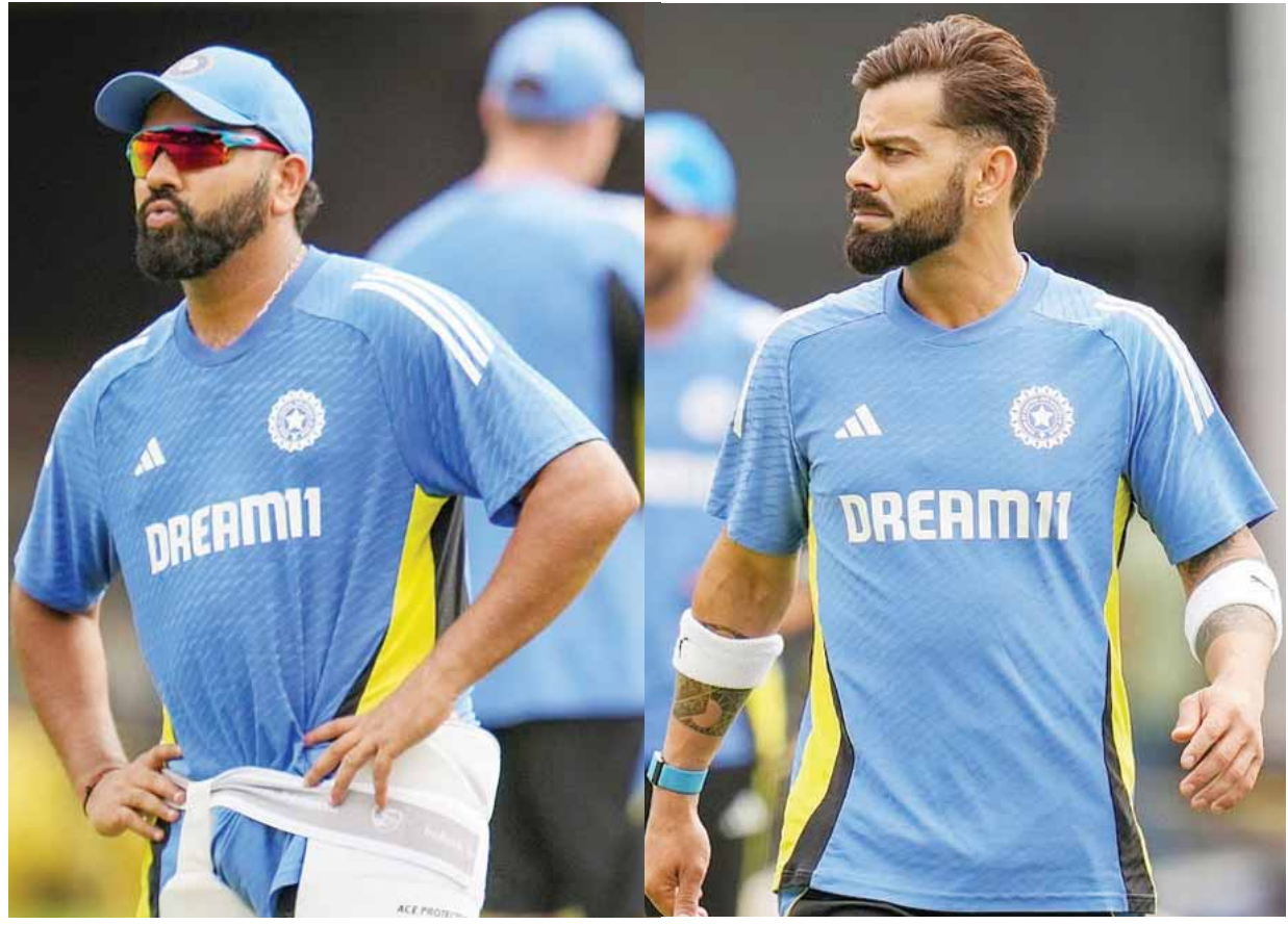
Kohli with the new ball, and their batting. ("They should) work on their technique, freshen up, get away from cricket for as much as they can and then hit the ground running when

PTI ■ NEW DELHI Gujarat Titans have entrusted former India keeper-batter Parthiv Patel with the dual responsibility of serving as their assistant and batting coach in the upcoming IPL, the franchise said on Wednesday. Parthiv will perform the dual role in the support staff led by head coach Ashish Nehra. "The Gujarat Titans are pleased to announce the appointment of Parthiv Patel as their new assistant and batting coach. With a distinguished 17-year career as a former Indian wicketkeeper-batter, Parthiv brings a wealth of experience and knowledge to the team," the franchise said in a statement. "As the Titans prepare for the upcoming Indian Premier League (IPL) season, Parthiv's insights into batting techniques and strategies will play a crucial role in enhancing the players' skills. Parthiv, who is known for his sharp cricketing acumen and ability to mentor young talent, will strengthen the coaching staff and contribute to player development and performance," GT added in the statement. This is the first coaching role in the IPL for Parthiv, who retired in 2020. Right after his retirement, he served as talent scout for Mumbai Indians for three seasons until 2023, and also the batting coach for MI Emirates in the inaugural season of ILT20.