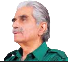
ASHOK K MEHTA

Amid a mounting internal criticism, Nepal's Prime Minister KP Oli faces daunting challenges, from managing a coalition to dealing with China