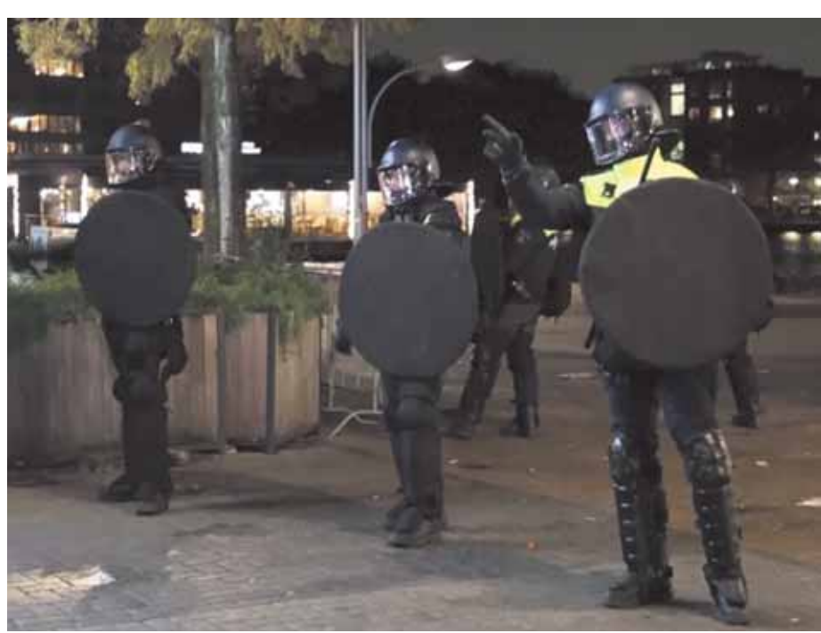
In this image taken from video, police officers patrol in riot gear on the streets of Amsterdam as the city is facing tensions following violence last week.

AP ■ THE HAGUE A senior police officer warned Tuesday of calls for more rioting in Amsterdam, after dozens of people armed with sticks and firecrackers set a tram on fire Monday night as the city faces tensions following violence last week targeting fans of an Israeli soccer club.