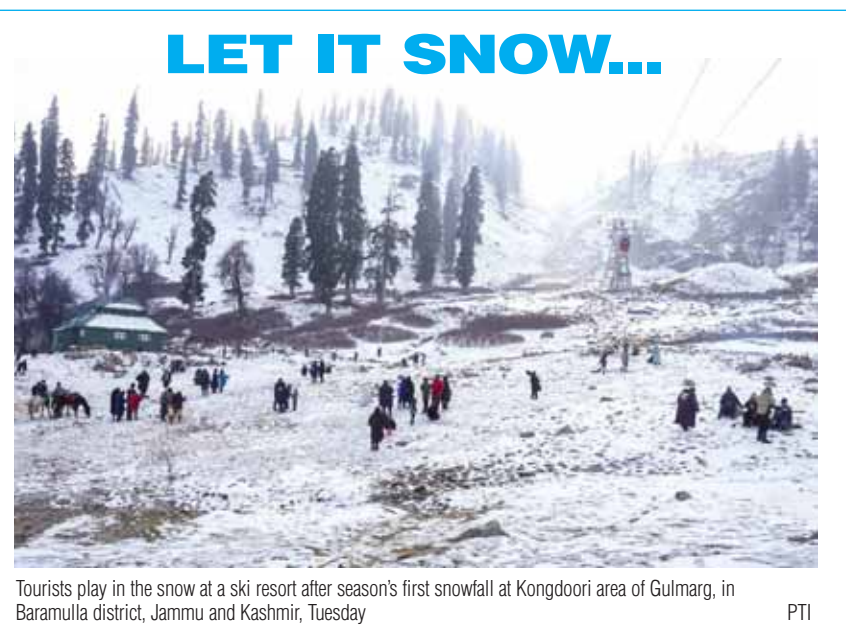
Tourists play in the snow at a ski resort after season's first snowfall at Kongdoori area of Gulmarg, in Baramulla district, Jammu and Kashmir, Tuesday

Retail inflation rose to 6.21 per cent in October from 5.49 per cent in the preceding month mainly due to higher food prices, breaching the Reserve Bank of India's (RBI's) upper tolerance level, according to official data released on Tuesday. The consumer price index-based inflation was 4.87 per cent in October 2023. The National Statistics Office data showed that inflation in the food basket rose to 10.87 per cent in October from 9.24 per cent in September and 6.61 per cent in the year-ago month. The RBI, which kept the key short-term lending rate unchanged earlier this month, has been tasked by the government to ensure inflation remains at 4 per cent with a margin of 2 per cent on either side.