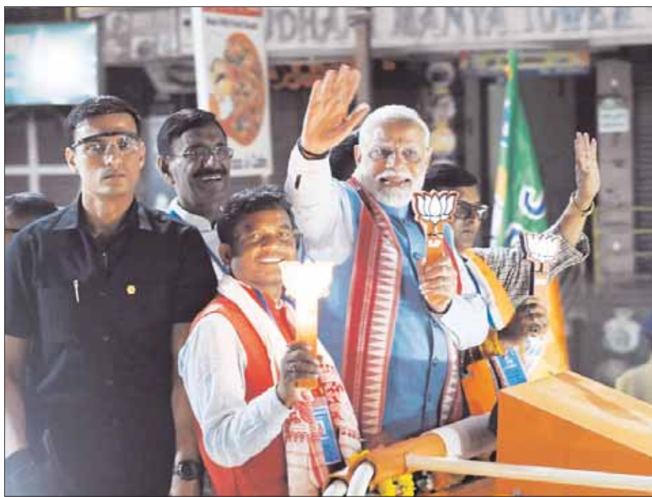
Narendra Modi_1 : Prime Minister Narendra Modi waves a crowd during his roadshow ahead of state assembly elections in favour of BJP candidates in Ranchi on Sunday. Union Minister Sanjay Seth is also seen in the picture.

While addressing an election rally in Chandankiyari of Bokaro district of Jharkhand, PM Modi fiercely attacked JMM and Congress. He said that there is a strong storm in favor of BJP in Jharkhand. This plateau of Chhota