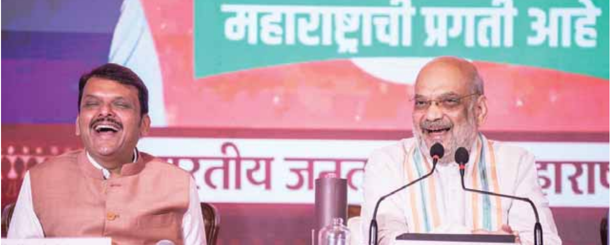
PIONEER NEWS SERVICE ■ MUMBAI

The Bharatiya Janata Party (BJP) on Sunday promised to enact an anti conversion law with stringent provisions in Maharashtra, and also assured a skill census for training as per industry needs as well as free ration to low-income families. Amit Shah, Union Minister for Home Affairs, unveiled in Mumbai a 25-point 'Sankalp Patra 2024', which promises an increase in government's allowance for women to Rs2,100 per month from Rs1,500 under the Ladki Bahin scheme. The party, in its manifesto for the November 20 state Assembly election, also promised to create 25 lakh job opportunities and assured a stipend of Rs 10,000 every month to 10 lakh students in the state. The ruling Mahayuti comprises the BJP, Shiv Sena of the Eknath Shinde faction and Nationalist Congress Party (NCP) led by Ajit Pawar, the deputy chief minister of the state. The BJP's manifesto promises an anti-conversion law and provides for stringent action against forced and deceitful