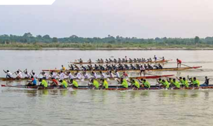
People take part in a boating competition, in Nadia