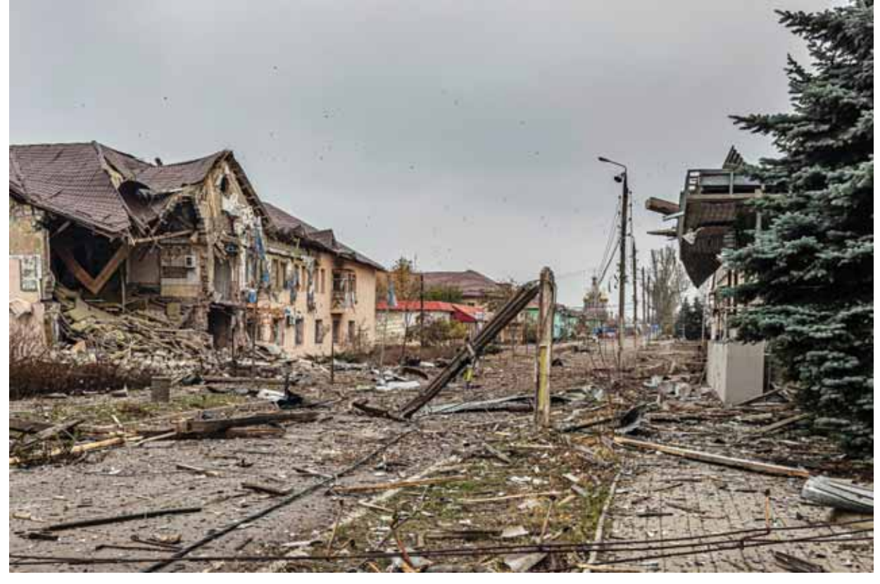
A central streets covered in debris from destroyed residential buildings after Russian bombing in Kurakhove, Donetsk region, Ukraine.

the basements, many are shocked by the state of the destroyed city, suggesting that they have been hiding underground for quite some time. After dressing the children in bulletproof vests and helmets, the White Angels take them to the nearby city of Kostyantynopil, from where other volunteers transport them to refugee registration points in the regional centers of Dnipro or Zaporizhzhia. "We evacuate people every day without stopping. We just dropped people off in Kostyantynopil, and we still have addresses to go through today," Shchus explains. Asked about adapting to work in such challenging and dangerous conditions, the police chief worries about the impact on his team. "I think everyone has already adapted. I wouldn't even call it adaptation. It's more like an unhealthy state of mind. I don't know how this will influence them socially in the future," he says. "These people are living in inhumane conditions, and they're surviving on adrenaline. The war is their life. These are hard conditions to work in, but everyone is working."