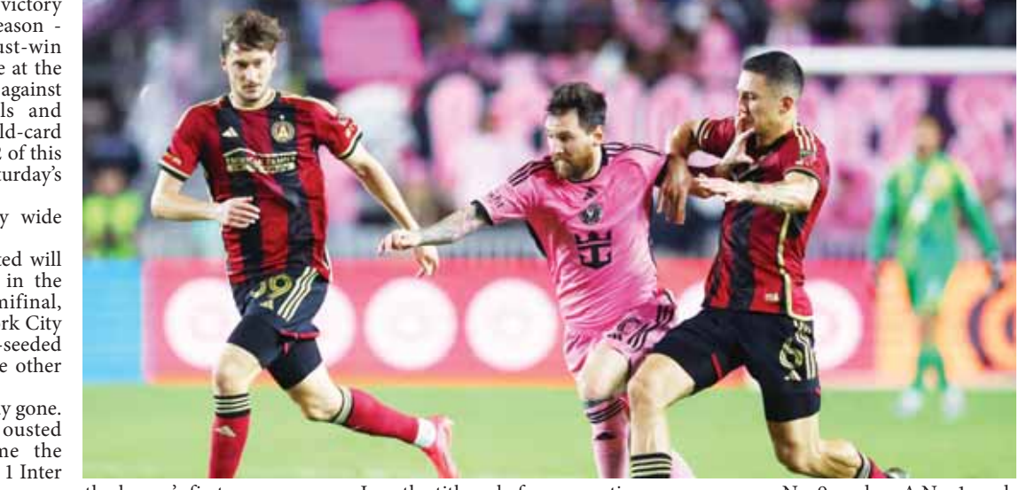
the league's first seven seasons. In the 22 seasons since, the top overall seed has gone on to win the title only four more times. And on paper, there may never have been a bigger upset than this one - a No. 9 seed vs. A No. 1 seed, and not just that, a No. 1 seed with Messi in the lineup. Messi's

It was the fifth win-or-else victory for Atlanta United this season - starting with two must-win matches to keep hope alive at the end of the regular season against the New York Red Bulls and Orlando City, then a wild-card match at Montreal, Game 2 of this series at home and then Saturday's stunner. And the East is suddenly wide open. Ninth-seeded Atlanta United will play No. 4 Orlando City in the Eastern Conference semifinal, while sixth-seeded New York City FC will face the seventh-seeded New York Red Bulls in the other East semifinal. No. 2 Columbus was already gone. No. 3 Cincinnati was ousted Saturday. And then came the biggest surprise of all - No. 1 Inter Miami's season is over. The team with the best record won the MLS Cup four times in