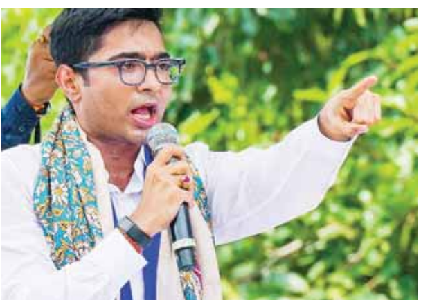
cutting short ambitions of junior leaders, too said, "Abhishek is the best person after Mamata Banerjee and is the future leader of the party." Both Roy's and Ghosh's remarks comes at the heels of an observation made by Kalyan Banerjee, another senior leader and MP, who sought to put to rest what many a senior leaders have termed an "uncomfortable debate," hinting at the point

over who will succeed Mamata Banerjee in the state. The BJP leader's statement also came at a time when number of senior leaders openly backed the candidature of Abhishek Banerjee, the current party general secretary and nephew of the CM. Supporting Abhishek, Kunal Ghosh, TMC spokesperson said, "Abhishek is not a contender. He is a successor." Ghosh in an online post wrote that Abhishek was his leader and was destined to be the next CM of Bengal. Calling him to be a rising star, who deserved to be nurtured and kept under constant watch, Ghosh wrote, "In the course of time, after Mamata Di, Abhishek will one day become the CM of Bengal," as he was the real 'bearer and carrier' of the chief minister's legacy. Even senior leader such as Saugato Roy, who has criticised by many for being a burden on the party and for