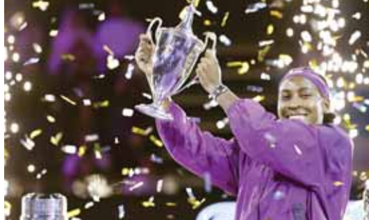
players - Aryna Sabalenka and Iga Swiatek - on her run to the final at the season-ending event in Riyadh. She felt vindicated after that and appeared to take a swipe at observers who wrote her off. "I just love to say I'm right. Specifically today, I got comments about how I was going to lose badly, so I was just like, 'OK, we'll see.'" Gauff explained. "It's honestly just

AP ■ RIYADH Coco Gauff won the WTA Finals for the first time by rallying to beat Olympic champion Zheng Qinwen 3-6, 6-4, 7-6 (2) in the final. The 20-year-old American came from 2-0 and 5-3 down in the final set and was two points from defeat at one stage. Yet she took the set to a tiebreaker and won the first six points. Zheng threatened a comeback but Gauff took the victory off her third match point with a forehand winner as she came into the net. She is the first American to win the Finals since Serena Williams in 2014, and received $4.8 million in prize money. She also is the youngest player to win it since Maria Sharapova in 2004, the year Gauff was born. Gauff beat the world's top two