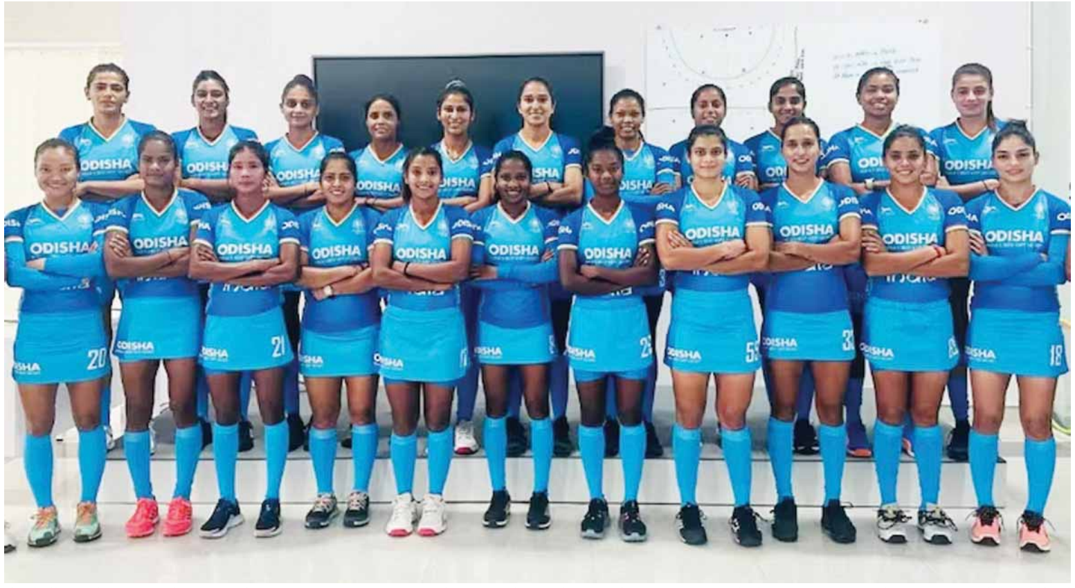
the ball you know you have the gas to regain the ball," he said. "I am not willing to look at the past, that is history for me. Always live in the present and the present is that we have Asian Champions Trophy to defend which can get the entire