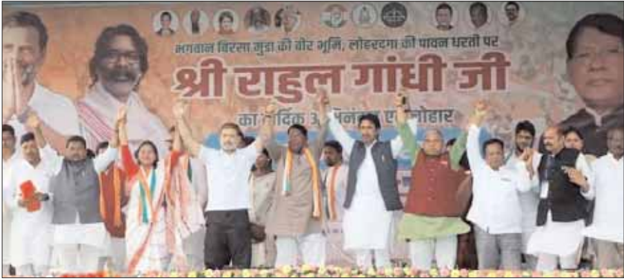
AICC Member Rahul Gandhi, State Minister Rameshwar Oraon along with party candidate during an election campaign rally in Lohardaga on Friday.

The worst leader of Congress was holding an election rally in favor of Bhushan Bada of Congress. In the year 2019, Bhushan