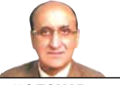
K S TOMAR

As Donald Trump returns to the White House, he may redefine the boundaries of American leadership and influence in an increasingly multipolar world