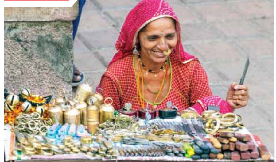
A Rajasthani nomad vendor waits for customers, in Pushkar