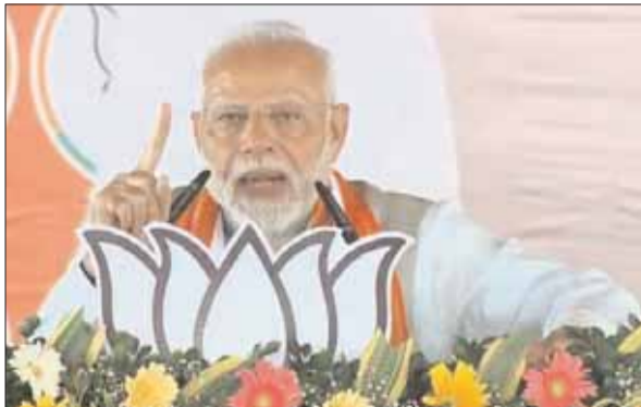
Prime Minister Narendra Modi addresses a gathering during an election campaign rally in Chaibasa, West Singhbhum, Jharkhand on Monday.