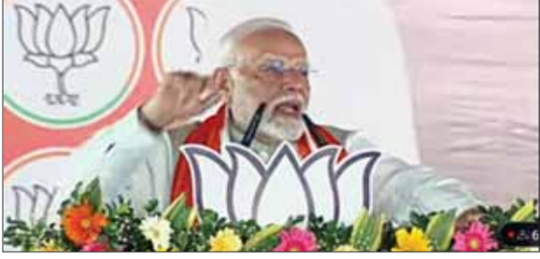
NITYANAND DUBEY : GARHWA

Prime Minister Narendra Modi today said that wherever Congress and its allies have come to power by telling lies, they have ruined that state. The Congress President has also accepted that Congress gives false guarantees. I don't know how the truth has come out of Mallikarjun Kharge's mouth knowingly or unknowingly. He said that these absurd announcements of Congress will bankrupt the states. PM Modi was also addressing a rally organized in Garhwa on Monday.