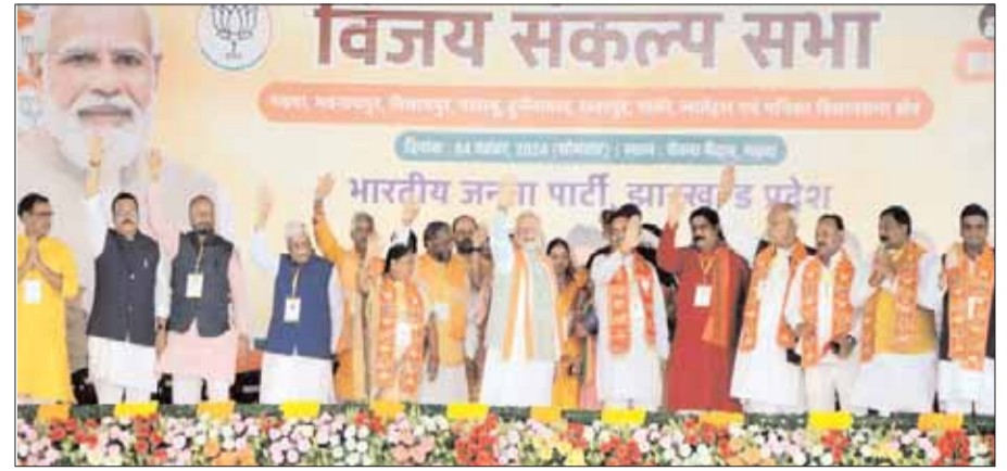
Prime Minister Narendra Modi, BJP Jharkhand President Babulal Marandi alongwith party candidates during an election campaign rally at Chetna Maidan in Garhwa on Monday.

In his first election rally in Garhwa since the announcement of Assembly election in Jharkhand, Prime Minister Narendra Modi accused the ruling government of JMM, Congress and RJD of corruption that disproportionately affects the poor, Dalits, tribals, and backward communities. Modi criticising the coalition government for misappropriating funds from the Centre allocated for various schemes, stating it is time for a "double engine government" in Jharkhand to ensure development over the next 25 years.