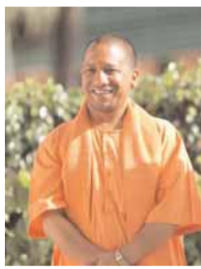
PNS : JAMSHEDPUR

BJP's high-energy election campaign in Kolhan is set to gain momentum as Uttar Pradesh Chief Minister Yogi Adityanath visits Jamshedpur on Tuesday. The firebrand leader will address a major rally at Sakchi's Aambagan Ground, where he is expected to energize the party's base and galvanize support across the four key assembly constituencies of East, West, Potka, and Jugsalai.