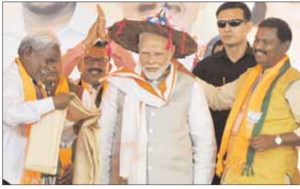
Former Union Minister Arjun Munda (right) presents a traditional hat to felicitate Prime Minister Narendra Modi while Champai Soren (left) welcoming him with a traditional shawl at an election campaign rally in Chaibasa, West Singhbhum, Jharkhand on Monday.