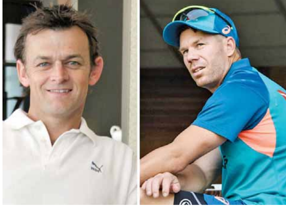
was a clean sweep - I cannot remember when that's happened to them, just losing a series, let alone a clean sweep - I think that will raise some questions internally. "The pressure and the expectation and the desire from a passionate cricketing nation to see that change around, that'll ride heavily on those shoulders of all those players." Gilchrist said India has the wherewithal to regroup after the heavy setback. "There are a few ageing players (with the Indian team)

Australian legends Adam Gilchrist and David Warner have little doubt that Indian players' psyche would have been scarred after the recent whitewash at home by New Zealand, but they said it will be naive to consider Rohit Sharma's side "easy beats" in the five-Test Border-Gavaskar Trophy, beginning at Perth from November 22. The Tom Latham-led Kiwis blanked India 3-0, marking one of the lowest points in their Test history, also denting the chances of qualifying for the World Test Championship (WTC) final next year. "It does (series defeat has an impact), more for the Indian players and the Indian team internally. They have to be asking themselves pretty hard questions," former wicketkeeper batter Gilchrist told Fox Sports. "But I'm not expecting them to come out and be easy beats, but I do think on the back of that loss and the fact that it