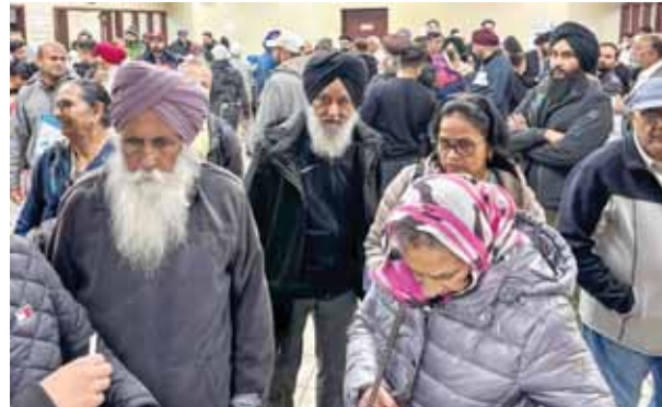
Indians at a consular camp in Brampton, Ontario, Sunday, November 3, 2024. The consular camp witnessed "violent disruptions" on Sunday as per Indian High Commission in Canada PTI

Brampton's Hindu Sabha Temple on Sunday, prompting the High Commission of India in Ottawa to issue a strong statement, condemning the attack by "anti-India" elements. Jaiswal also pointed out that it remains "deeply concerned" about the safety and security of its citizens in that country, asserting that the diplomatic officers providing consular services to Indians "will not be deterred by intimidation, harassment and violence". "We remain deeply concerned about the safety and security of Indian nationals in Canada. The outreach of our Consular officers to provide services to Indians and Canadian citizens alike will not be deterred by intimidation, harassment and violence," he said. According to a PTI report from Ottawa, protestors