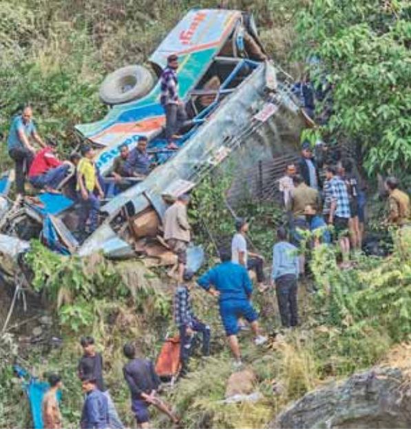
Rescue and relief work underway after a passenger bus fell into a gorge in Kupri area, in Almora, Uttarakhand

Sources in the poll panel said political parties had requested for a change in the polling date, citing festivals such as Kalpathi Rastholsavam (November 13-15), Kartik Purnima (November 15) and Prakash Parv of Sri Guru Nanak Dev (November 15). The parties said the festivals may impact voter turnout in these states. "Representations have been received in the Commission from various recognised national and state political parties (including BJP, INC, BSP, RLD) and some social organisations for change of date for poll in some Assembly constituencies having by-elections on 13th November, 2024, considering large scale social, cultural and religious engagements on that day which may cause inconvenience to large number of people, give rise to various logistic issues and may lead to reduced voters participating during the poll," the EC said.