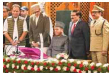
CM Omar Abdullah, Speaker pro-tem Mubarak Gul with Speaker Abdul Rahim Rather

The portals of the Jammu and Kashmir Legislative Assembly were thrown open after a gap of more than six years allowing newly elected members to attend the maiden address of Lieutenant Governor Manoj Sinha to the first-ever legislative Assembly of the Union Territory after the abrogation of articles 370 and 35-A on Monday. The last Budget session of the Mehbooba Mufti-led Peoples Democratic Party-Bharatiya Janata Party (PDP-BJP) alliance government was adjourned sine die by the speaker on February 13, 2018. The alliance government later collapsed in June 2018 leading to the Governor's rule. On August 5, 2019, the erstwhile state of Jammu and Kashmir was reorganised into two Union territories. Meanwhile, a ruckus broke out on the floor of the Assembly soon after the unanimous election of veteran National Conference leader Abdul Rahim Rather as speaker of the house. Waheed ur Rehman Para, a PDP MLA, tried to grab the limelight by bringing in a resolution against the abrogation of Article 370 without giving any advance notice to the chair. Chief Minister Omar Abdullah reacted on the spur of the moment calling out the act as a mere photo exercise. It was also 'vociferously'