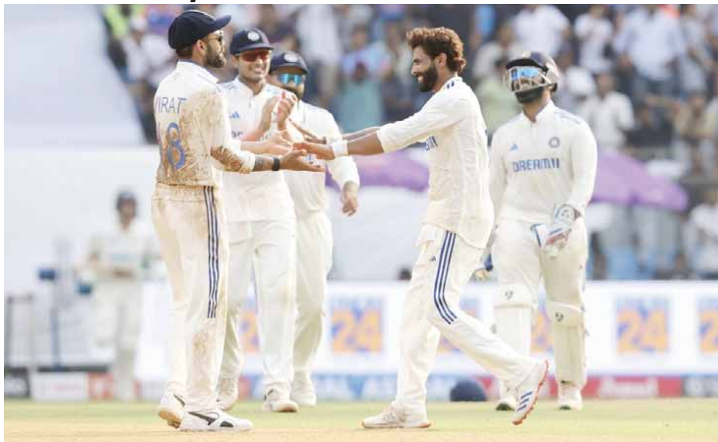
Tom Latham's (1) off and middle stumps in the first over. Earlier, India's progress suffered a severe blow with the exit of Pant towards the end of the morning session, as its effects were felt acutely when play resumed post

Having made a subdued impact so far, Ashwin's delight on getting Rachin Ravindra (4) stumped was evident as he beat the charge of the batter with bounce and turn. With Glenn Phillips (26) using the long handle to a good effect, Ashwin cleaned up the New Zealand batter for another crucial breakthrough. Young, who batted as solid as he did in the first innings, was Ashwin's third victim giving the bowler catching practice after being outfoxed on a carrom ball. The 37-year-old Ashwin made impact beyond his bowling when he took an outstanding catch to end a stubborn 50-run association between Young and Daryl Mitchell (21), who, for a passage of play, threatened to take the game away. Young and Mitchell had steadied the ship after New Zealand's top-order was blown away, but the latter's charge against Jadeja proved costly as he did not get the distance in his stroke. From mid-off, Ashwin covered 19 metres running sideways to his left and put in a fabulous dive to complete the dismissal, post which New Zealand crumbled further. Tom Blundell (4) chopped one onto his stumps off Jadeja while Ashwin cleaned up Phillips, who had switched to aggressive batting knowing New Zealand desperately needed more runs. At the start of Kiwis' reply, Akash provided a rare sight of a pacer disturbing a batter's furniture on turning track when he dismantled