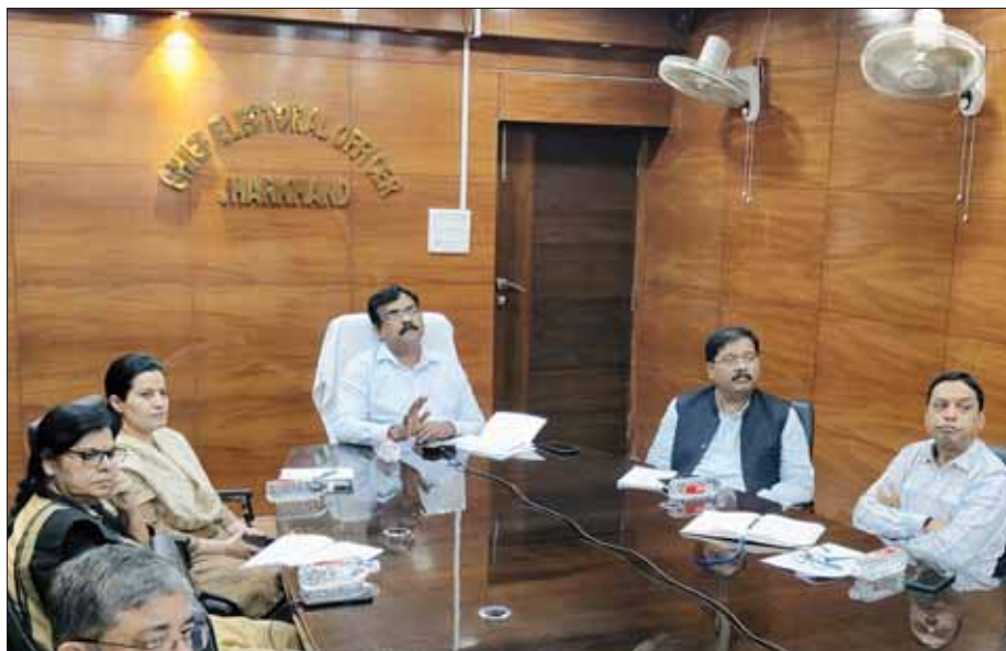
CEO, Jharkhand holds a meeting with all DEOs in Ranchi on Saturday.

Meanwhile, reviewing the preparations related to Assembly Elections 2024 with all the District Election Officers on Saturday the CEO said that ensure finalization of all preparations for the Assembly Elections 2024. Along with motivating voters to vote, review the availability of minimum facilities at the polling stations. He said that the Presiding Officer should get a trial run of the online application to be used at the time of voting on November 9, so that there is no difficulty on