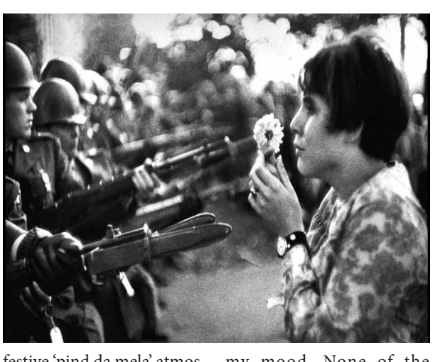
festive 'pind da mela' atmos-

I was thrilled beyond words. That day, under a gentle winter sun, I took my seat near the massive gate where the ceremony unfolds. It was a spectacle to beholdsmartly dressed soldiers marching in perfect sync on both sides of the border. The crowd was electric, brimming with patriotic fervor, singing Bollywood