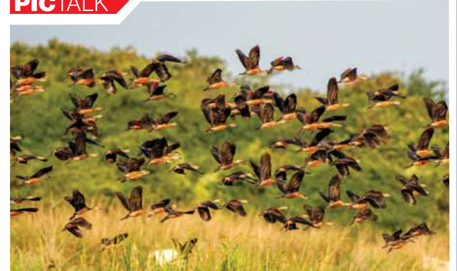
A flock of whistling ducks fly at the Pobitora Wildlife Sanctuary, in Morigaon

claimed tens of thousands of lives. There is no let up in Israel's attacks on Gaza where the human crisis is getting worse. The fighting extended to Israel's northern border when Hezbollah escalated its attacks, prompting Israel to retaliate. While the ceasefire offers a glimmer of hope, challenges loom large. The success of the agreement depends on its strict implementation, particularly the disarmament of militias in Lebanon. The Lebanese government, already struggling with economic and political crises, will face immense pressure to assert its authority over Hezbollah, a deeply entrenched and well-armed organisation. Whatever the reasons for this truce but it definitely gives peace a chance. The agreement's implications for regional peace are profound. If upheld, it could reduce tensions along Israel's northern border, allowing displaced civilians to return home and facilitating humanitarian relief in affected areas. For Lebanon, the deal could bolster its sovereignty by curbing the influence of armed non-state actors, potentially paving the way for greater stability. However, unresolved issues, including the ongoing Israel-Hamas conflict and tensions with Iran, continue to pose risks to lasting peace. The role of the US, France, and UNIFIL will be critical to ensuring compliance and rebuilding trust.