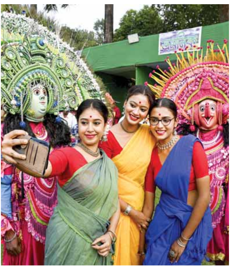
Artists take selfies during 'Jangal Mahal Utsav', a festival to promote tribal arts and culture, in Kolkata.