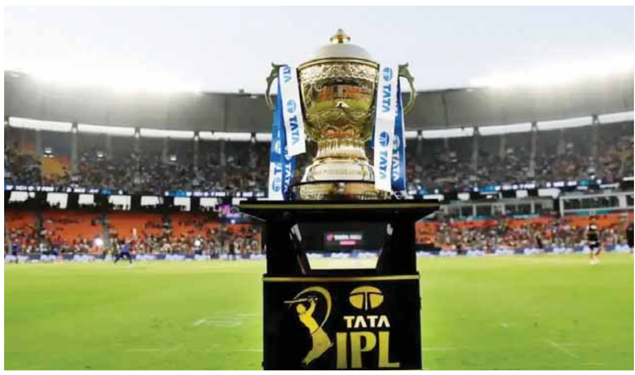
has been scheduled for May 31. The 2027 edition will once again start on March 14 with the final on May 30. All three finals will be held on Sundays. The BCCI had plans to increase the number of