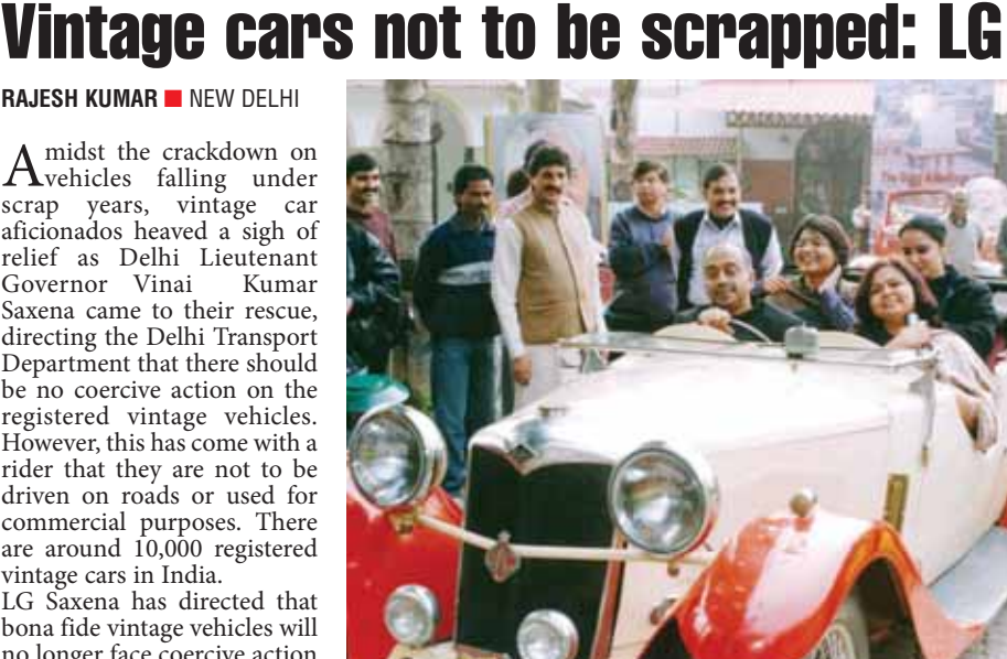
Former Union Minister Vijay Goel with one his coveted vintage cars which he used to take out as part of the exhibition he started to mark the birthday of former Prime Minister Atal Bihari Vajpayee

Acting on a representation made by the Heritage Motoring Club of India, highlighting that their vehicles are being impounded by the authorities and requesting for clarificatory orders in this regard, the LG had asked his Secretariat to issue appropriate directions. The transport department's data shows there are Continued on page 2 | 60,14,493 such vehicles in