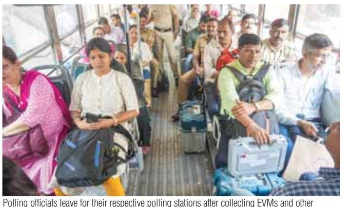
election materials from a distribution center on the eve of voting for the Maharashtra Assembly

While the Shinde Shiv Sena will slug it out with the Uddhav Thackeray-led Sena in as many as 39 seats. The feuding NCPs, one led by Ajit Pawar and another headed by Sharad Pawar himself,