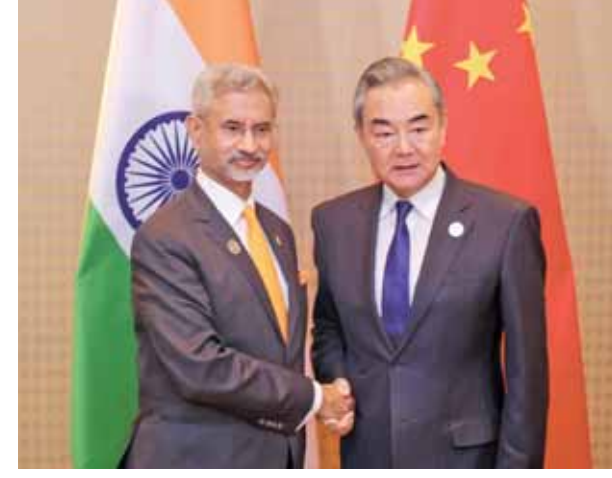
External Affairs Minister S Jaishankar in a meeting with China's Foreign Minister Wang Yi on the sidelines of the G20 Summit in Rio de Janerio

Days after the two sides reached an agreement on October 21 on disengagement in Demchok and Depsang, Indian and Chinese militaries completed the process marking a virtual end to over four-year standoff in the two