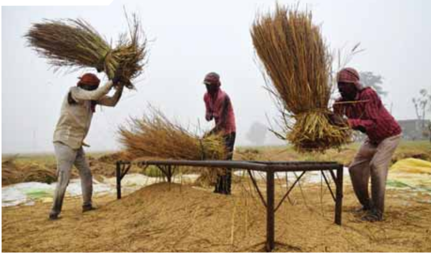
Labourers thresh paddy at a field on the outskirts of Amritsar