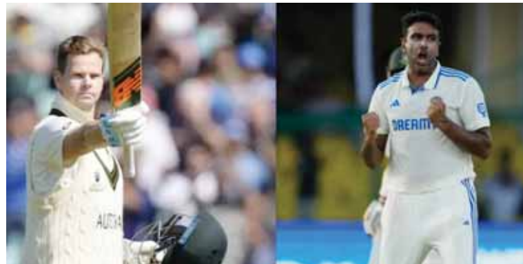
he wants to," he added. Ashwin's Test bowling average stands at a modest 42.15 in Australia compared to his home average of 21.57. Smith hoped to land the first blow on the 38-year-old to gain an early upper hand in the five-match series, beginning at Perth from November 22.

Australian batting talisman Steve Smith wants to adopt a proactive approach against Ravichandran Ashwin in the upcoming Border-Gavaskar Trophy to avoid his struggles against the Indian spinner during the 2020-21 series. Ashwin had nicked off Smith thrice during that rubber, and later in 2023 the Indian off-spinner dismissed the Aussie twice as he could only make 22 runs against his old foe. "I don't like getting out to off-spin in Australia. But he's also a very good bowler and he came in with some decent plans. There were a couple of occasions where he got on top of me," Smith told the Sydney Morning Herald. "But then I got on top of him at the SCG when I was a bit more proactive (Smith made 131 and 81 at Sydney). So, that's key for me. Just be proactive against him and not let him settle and bowl the way