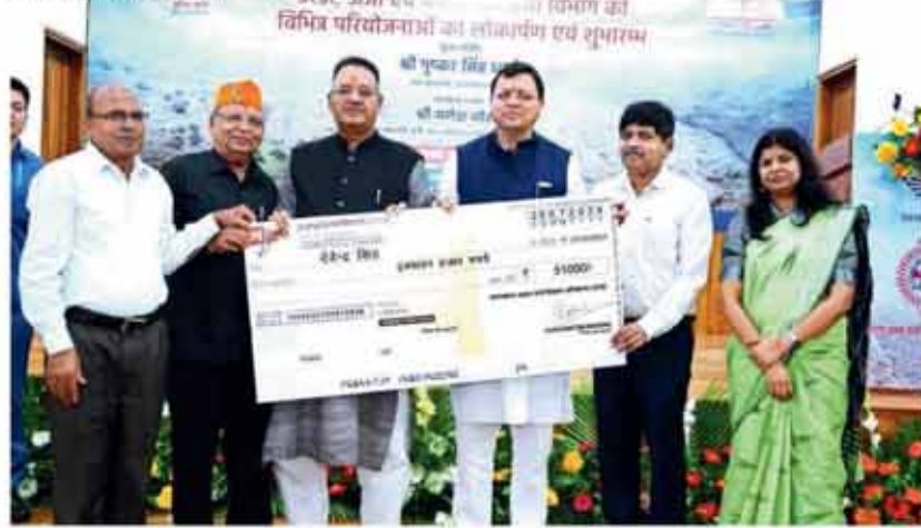
>> Pushkar Singh Dhama, CM, Uttarakhand; R Meenakshi Sundaram, secretary energy; and other dignitaries participating at UREDA event

across different sectors. By leveraging solar energy, the state strives to improve power system stability, encourage rural incomes, enhance the reliability and quality of electricity supply, and create livelihood prospects, especially for youth and women.