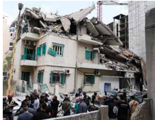
Residents and rescuers gather at the site of an Israeli airstrike that hit a building in central Beirut's Ras-el-Nabaa neighborhood, Lebanon, Sunday.

AP ■ TEL AVIV Israeli strikes in the Gaza Strip overnight killed 12 people, Palestinian medical officials said on Sunday. Israeli police meanwhile arrested three suspects after flares were fired at Prime Minister Benjamin Netanyahu's private residence in the coastal city of Caesarea. In Lebanon, Israeli warplanes pounded the southern suburbs of Beirut after the military warned people to evacuate from several buildings. The Hezbollah militant group has a strong presence in the area, known as the Dahiyeh, and the strikes came as Lebanese officials are considering a United States-brokered cease-fire proposal. One of the strikes hit central Beirut for the first time in weeks. Netanyahu and his family were not at the residence when two flares were fired at it overnight, and there were no injuries, authorities said. A drone launched by Hezbollah struck the residence last month, also when Netanyahu and his family were away. The police did not provide details about the suspects behind the flares, but officials pointed to domestic political critics of Netanyahu. Israel's largely cere-