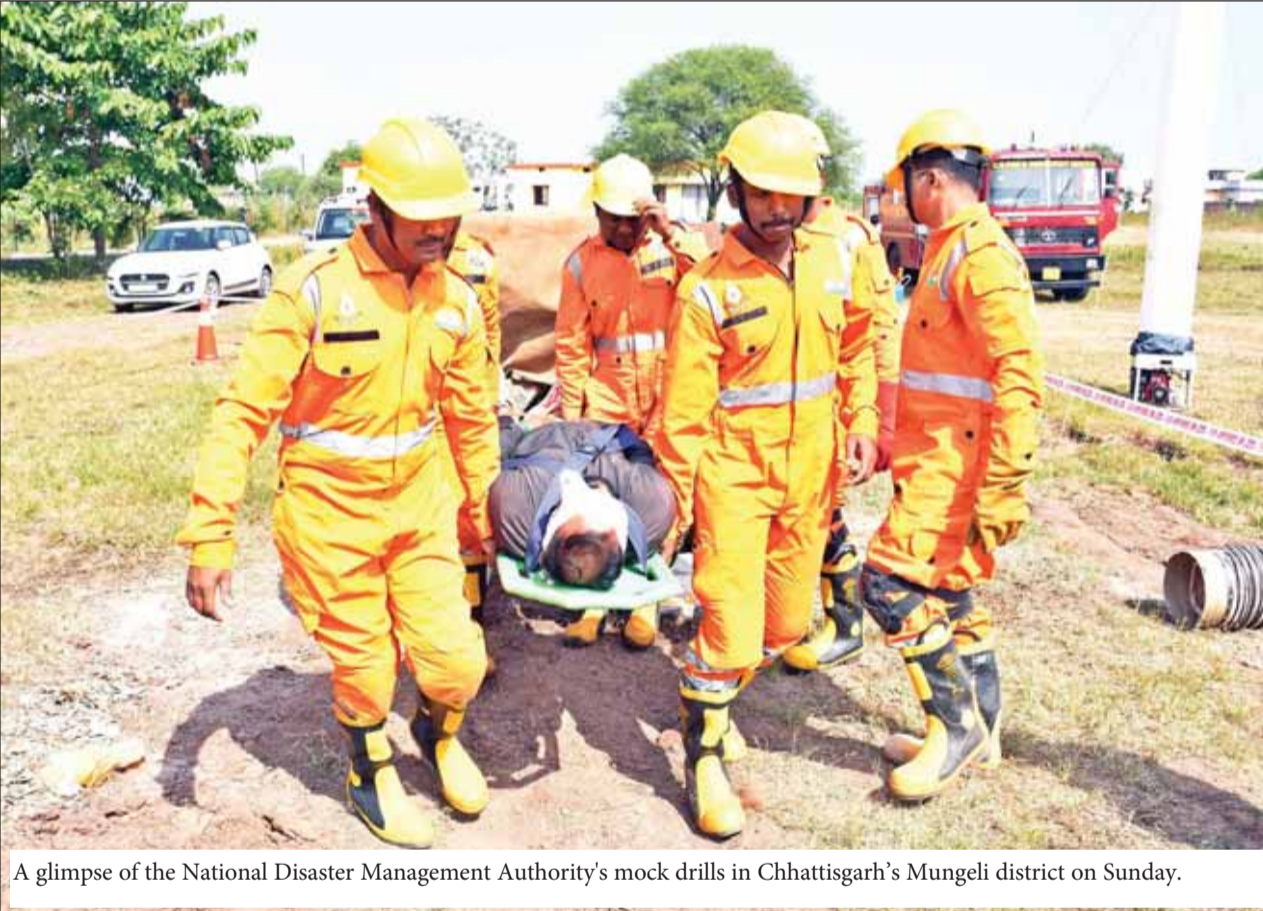
A glimpse of the National Disaster Management Authority's mock drills in Chhattisgarh's Mungeli district on Sunday.

Earlier, the villagers had to travel for hours to collect drinking water if the hand pumps were not working. They ascertained the water's purity through its muddy colour.