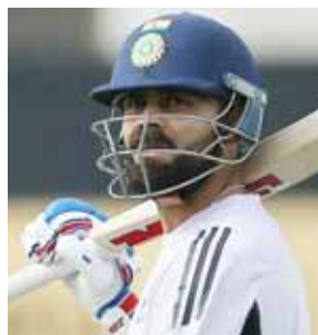
against New Zealand, you've got plenty of ammunition to back yourself up," Fox Cricket noted McGrath as saying on 'CODE Sports'. "So put the pressure on them and see if they're up for it," he added. Kohli, who has been India's batting mainstay for over a

Pace legend Glenn McGrath feels Australia have the "ammunition" to target an "emotional" Virat Kohli, who will be under pressure if he gets off to a poor start at the five-match Test series for the Border-Gavaskar Trophy, starting in Perth from November 22. India have won the last four Test series against Australia, including two Down Under. However, they head into the much-anticipated five-Test assignment on the back of a 0-3 series whitewash at the hands of New Zealand at home. "Without a doubt, especially after coming off a 3-0 loss