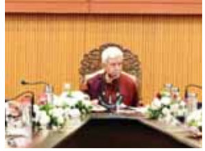
Sinha chaired a high-level security review meeting at the Jammu Convention centre, first after the shifting of the move offices in Jammu.