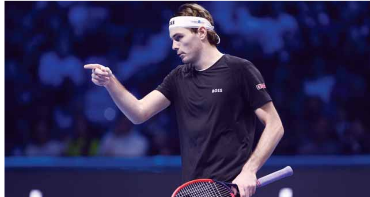
the season-ending events after Coco Gauff won the WTA Finals last week. Fritz's run in New York made him the first American man to reach a Grand Slam singles final in 15 years. He's playing at the ATP Finals for

Andre Agassi in 1999. "I trust my game and I trust my level and I don't feel nearly as uncomfortable in these situations anymore because I've been playing the top guys at big events a lot lately," Fritz said. "I'm getting more comfortable in the moment. I'm really, really confident in my game." Fritz upbeat after loss to Sinner. Fritz came away encouraged from his 6-4, 6-4 loss to Sinner on Tuesday. "I felt much more comfortable from the baseline. ... I had chances to break him in both sets," Fritz said. "He had an equal amount of chances, and he took his. He played the big points better than I did. It didn't feel anywhere near as one-sided as the Open." Sinner noted that Fritz "played a great match." "The difference was just a few points. Tomorrow will be very similar. ... But finals are always different than group matches." Fritz trying to match Gauff. Fritz wins the trophy, it will mark an American sweep of