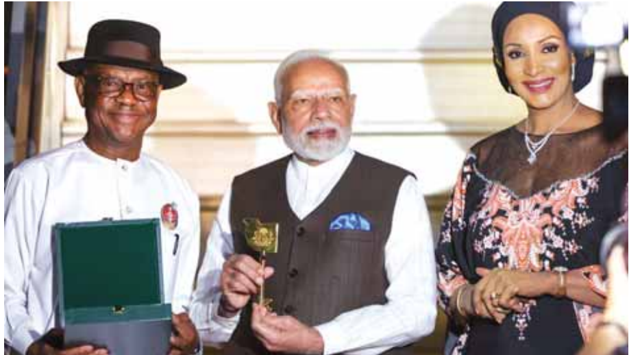
Prime Minister Narendra Modi being received by the Nigerian delegates upon his arrival at the airport, in Abuja, Nigeria, Sunday, Nov. 17, 2024. Modi on Sunday arrived in Nigeria on the first leg of his three-nation visit at the invitation of President Bola Ahmed Tinubu.

India accords high priority to its strategic partnership with Nigeria and it will work towards boosting ties in a range of areas, including defence, energy and trade, Prime Minister Narendra Modi said during his talks with Nigerian President Bola Ahmed Tinubu on Sunday. In his televised opening remarks at the meeting, Modi identified terrorism, separatism, piracy and drug trafficking as major challenges and said the two countries will continue to work together to deal with them. Modi arrived in Abuja early Sunday on the first trip to the country by an Indian prime minister after a gap of 17 years. "We give high priority to our strategic partnership with Nigeria...I am confident that a new chapter in our ties will begin following our talks," the PM said. He also described the around 60,000-strong Indian expatriate community as a key pillar of India-Nigeria relations and thanked Tinubu for ensuring their welfare. The PM also announced that India is sending 20 tonnes of relief supplies for Nigerian people hit by last month's floods. He also referred to the African Union becoming a permanent member of the G20 at the India-hosted summit of the grouping last year and