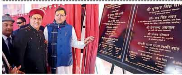
>> Pushkar Singh Dhama, CM, Uttarakhand, inaugurates RMU works at Uttarkashi

UPCL's dedication to quality and governance is evidenced by its various certifications and awards, including NABL certification for its test laboratories and ISO 9001:2015 certification for its corporate office. These efforts highlight UPCL's dedication to providing reliable electricity and driving Uttarakhand's socio-economic growth.