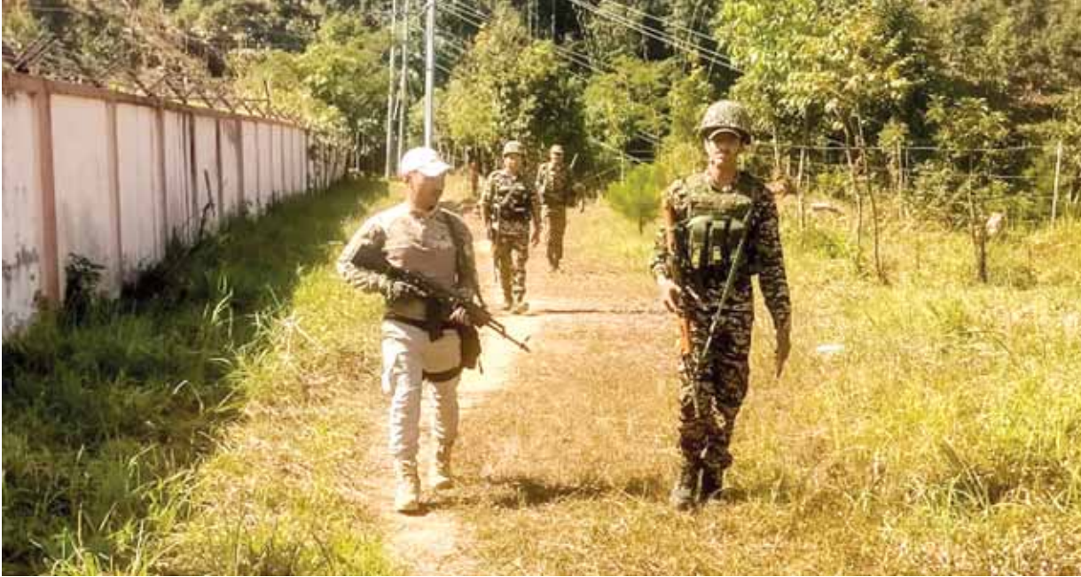
Security personnel patrol in a sensitive area of Manipur. Search operations and area domination were conducted by security forces in the fringe and vulnerable areas of hill and valley districts of the state

Amid escalating unrest in Manipur, Union Home Minister Amit Shah on Sunday cancelled all his rallies in poll-bound Maharashtra and returned to Delhi to hold a meeting to review the volatile situation. Irate mobs set fire to the residences of three more Bharatiya Janata Party (BJP) legislators, one of whom is a senior Minister, and also the home of a Congress MLA in various districts of Imphal Valley, even as security forces foiled the attempt of agitators to storm the ancestral residence of Manipur Chief Minister N Biren Singh, officials said. Later in the evening, the Home Minister held a meeting with senior security and intelligence officials, and reviewed the Manipur situation. Meanwhile, Central Reserve Police Force (CRPF) chief Anish Dayal Singh reached Imphal on Sunday, to monitor and coordinate the security operations in the region. The fresh incidents of violent protests took place on Saturday night even as an indefinite curfew was clamped after people, agitated by the killing of six women and children each by militants in Jiribam district, attacked the residences of three state Ministers and six MLAs earlier on Saturday. Meanwhile, the Manipur Government has requested the Centre to review and withdraw AFSPA from areas falling under the jurisdiction of six police stations in the State. The Centre has reimposed the Armed Forces (Special Powers) Act, 1958 in Manipur's six police station areas, including violence-hit Jiribam. Union Ministry of Home