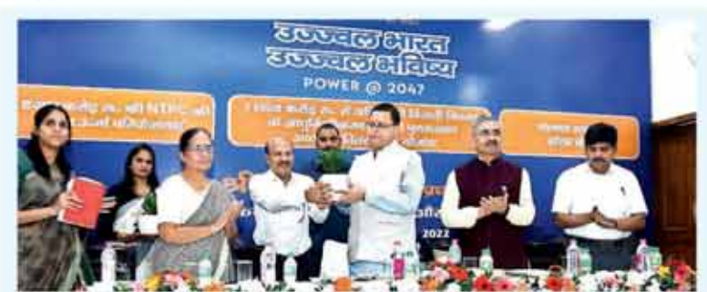
>> Pushkar Singh Dhama, CM, Uttarakhand; R Meenakshi Sundaram, secretary energy; and other dignitaries inaugurating power projects

CM Dhama emphasised the importance of such initiatives in strengthening the state's power supply system, asserting that the advancements in infrastructure will ultimately benefit both the corporation and the residents of Uttarakhand. The successful implementation of RMU works at Tiloth Power House marks a significant step forward.