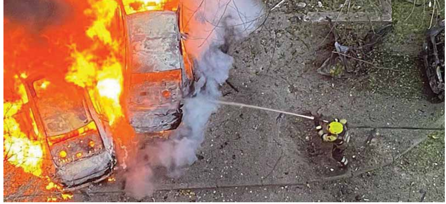
In this photo provided by the Ukrainian Emergency Service, emergency services personnel remove part of a Russian missile that hit an apartment house during massive missile attack in Kyiv, Ukraine, Sunday. AP/PTI

Western allies to bolster the country's air defences to counter assaults and allow for repairs. Explosions were heard across Ukraine on Sunday, including in capital Kyiv, the key southern port of Odesa, as well as the country's west and central regions, according to local reports. The operational command of Poland's armed forces wrote on X that Polish and allied aircraft, including fighter jets, have been mobilised in Polish airspace because of the "massive" Russian attack on neighbouring Ukraine. The steps were aimed to provide safety in Poland's border areas, it said. One person was injured after the roof of a five-story residential building caught fire in Kyiv's historic centre, according to Popko. A thermal power plant operated by private energy company DTEK was "seriously damaged", the company said.