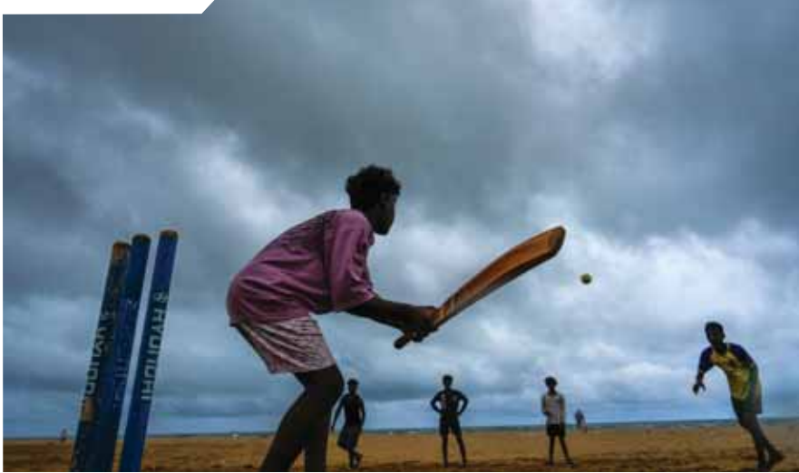
Young men play cricket as dark clouds hover in the sky at the Marina Beach, in Chennai