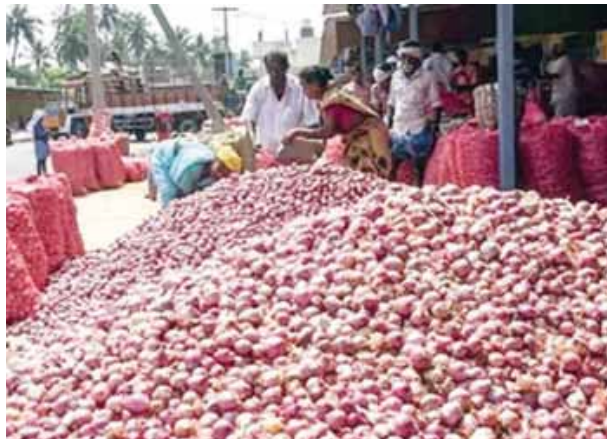
per kg in Nashik. Onions are not produced in Odisha and hence, the state is dependent on other states. Prices of onion and garlic are high outside the state