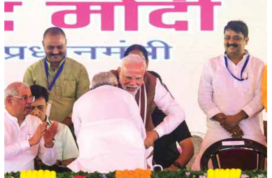
Bihar Chief Minister Nitish Kumar took everyone by surprise at an event in Darbhanga when he tried to touch Prime Minister Narendra Modi's feet. In a video that has gone viral on social media, Nitish Kumar, 73, walked towards PM Modi, 74, with folded hands and bowed to touch his feet in a third such instance this year. However, PM Modi quickly stops the JD(U) leader from touching his feet and is seen shaking his hands. Another video that has gone viral from the same event shows Modi pulling Nitish Kumar to his side as party workers garland the Prime Minister.