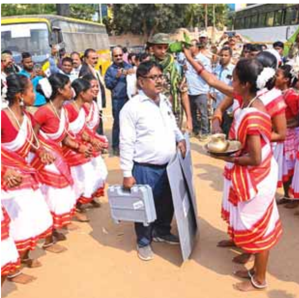
Women from the tribal community give a traditional welcome to a polling official before he leaves for his allotted polling station on the eve of the 1st phase of Jharkhand Assembly elections, in Ranchi, Tuesday

PIONEER NEWS SERVICE ■ NEW DELHI/RANCHI/WAYANAD