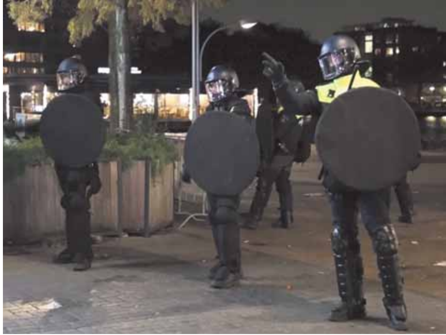
In this image taken from video, police officers patrol in riot gear on the streets of Amsterdam as the city is facing tensions following violence last week.