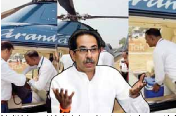
Modi? I demand Modi's helicopter should be searched" The video clip shows Uddhav letting search his bags in the helicopter. "I have nothing against you people. What I am

himself shared it on social media after arriving at Yavatmal in eastern Maharashtra for campaigning, showed the Sena (UBT) chief talking to the election officials who had come to search his election officials, and seeking their identification and appointment letters. "How many politicians have you searched so far?", he asked the officials. After being told that his was the first helicopter that was being searched, Uddhav said: "Am I the first person to be searched? How come that I am always the first politician to be searched? Modi is coming today. Will you be searching for the helicopter of