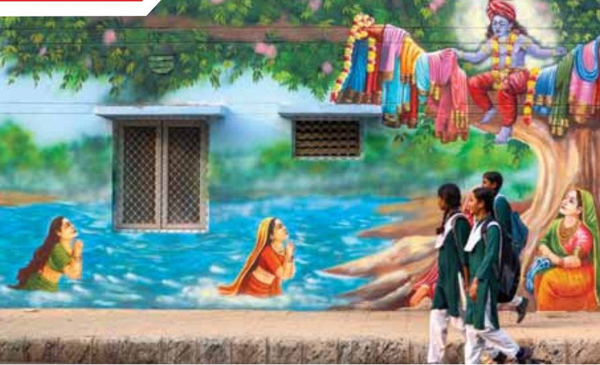
Students pass by a wall painting depicting a scene from 'Krishna Leela', in Prayagraj