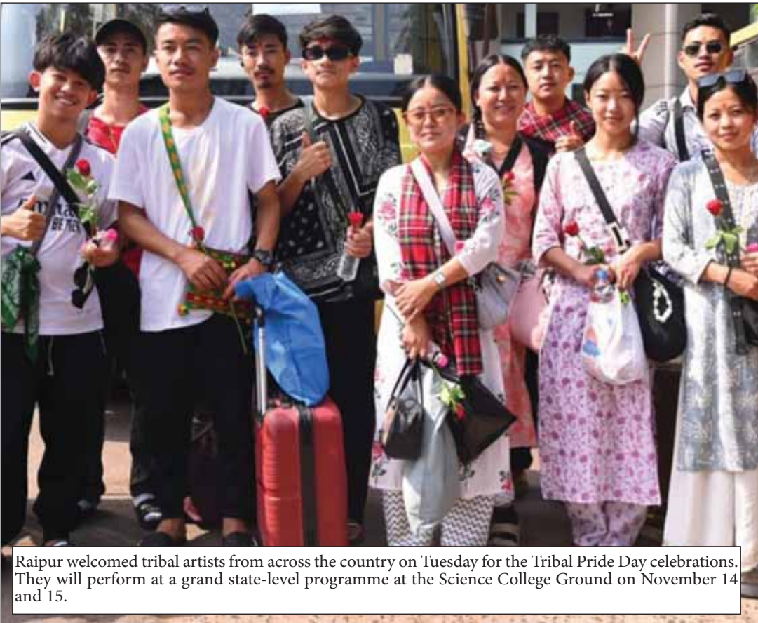
Raipur welcomed tribal artists from across the country on Tuesday for the Tribal Pride Day celebrations. They will perform at a grand state-level programme at the Science College Ground on November 14 and 15.

People can also visit www.arpaneam.com to teach personal safety to children.