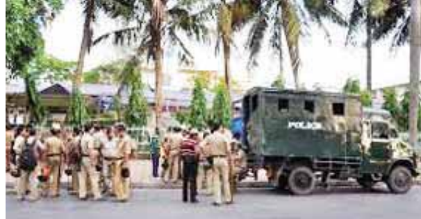
The six Assembly seats that are up for the grab are Sitai and Madarihat seats in Coochbehar and Alipurduar districts of North Bengal, Taldangra and Medinipur in Bankura and West Midnapore districts of Jangalmahal and Haroa and Naihati in North 24 Parganas district north of Kolkata. All but the Madarihat seat was clinched by the Trinamool Congress in 2021 Assembly elections when there was a considerable wave for the BJP which had won 78 out of 294 seats in that year. Though the main fight is like-

The Election Commission of India has made a massive security bandobast for the high-voltage by-elections to the six Assembly seats on Wednesday. The Commission has deployed a total 108 companies of Central Armed Police Force -- about 20 companies more than what was earmarked initially. The CAPF will comprise 40 companies of Border Security Force (BSF), 14 companies of Central Reserve Police Force (CRPF), 12 companies of Indo-Tibetan Police Force (ITBP), 14 companies of Central Industrial Security Force (CISF) and 13 companies of Sashastra Seema Bal (SSB), sources said adding the State police would man the outer ring of the security system. "All the booths will be manned by the central forces and covered by CCTV camera so there should not be any chance of any malpractices," said an EC official.