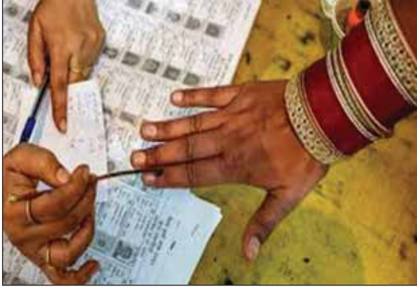
The election was necessitated after sitting BJP state president of the party's youth wing.