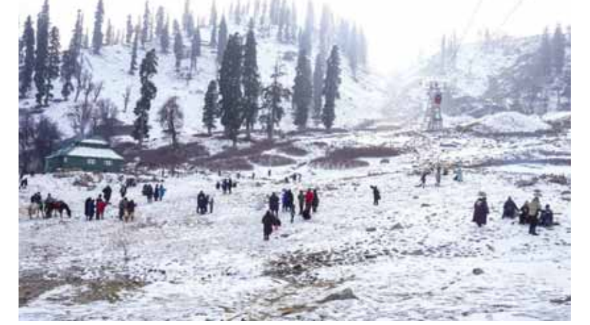
Tourists play in the snow at a ski resort after season's first snowfall at Kongdoori area of Gulmarg, in Baramulla district, Jammu and Kashmir, Tuesday