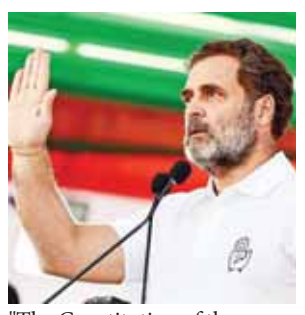
"The Constitution of the country embodies values that have stood for thousands of years, representing the thoughts of Lord Buddha, Sant Basaveshwara, Mahatma Phule, Mahatma Gandhi, Dr Ambedkar, and Chhatrapati Shivaji Maharaj. This Constitution represents equality, love, and respect for all religions. When I show the red-book of the Constitution is shown, Prime Minister Modi criticizes it and me," Rahul said. Accusing Modi of having not read the constitution, Rahul said: "Nowhere in this Constitution allows the government to kill people or oppress the poor and farmers. Prime Minister Modi has not even read this Constitution. The BJP, RSS, and Narendra Modi continuously attack and attempt to dismantle the Constitution drafted by Dr Babasaheb Ambedkar, while the Congress fights to protect it." Dwelling upon the issue of reservations, Rahul said that Modi often claimed that belonged to the OBC community, "yet he consistently disrespects the community." "Despite OBCs constituting 50% of the population, the Modi government allocates only 5% of funds to them, which is a true insult to the community. This is the reason the Congress is determined to conduct a caste-based census and remove the 50% cap on reservations," he said.