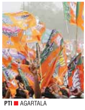
AGARTALA