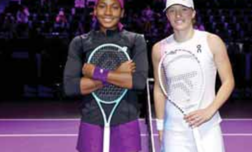
Open champion, also put an end to five-time Grand Slam champ Swiatek's six-match unbeaten run at the WTA Finals, an event the Polish star won a year ago.

AP ■ RIYADH Coco Gauff earned her second victory over Iga Swiatek in 13 career matchups, winning 6-3, 6-4 at the WTA Finals to reach the semifinals of the season-ending tournament. The result means that Swiatek can't move up from No. 2 in the rankings this week, so Aryna Sabalenka will finish the year at No. 1 for the first time. It was Gauff's first victory over Swiatek since the 2023 Cincinnati Open, snapping a four-match losing skid head-to-head. Gauff, the 2023 US