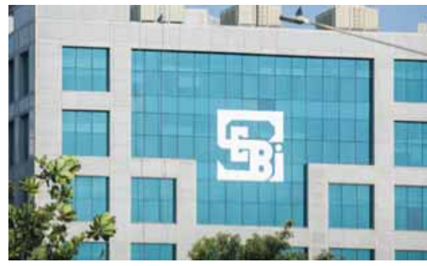
Draft Red Herring Prospectus (DRHP).

In Sebi's parlance, obtaining observations means its go-ahead to float public issues. The Rs 1,085-crore IPO of Rubicon Research is a combination of a fresh issue of equity shares worth Rs 500 crore and an Offer For Sale (OFS) of shares valued at Rs 585 crore by the promoter, General Atlantic Singapore RR Pte Limited, according to the