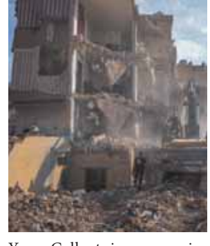
Yoav Gallant in a surprise announcement that sparked protests across the country. Gallant's replacement is Foreign Minister Israel Katz, a longtime Netanyahu loyalist and veteran Cabinet minister. While Netanyahu has called for continued military pressure on Hamas, Gallant said military force created the necessary conditions for at least a temporary diplomatic deal that could bring home hostages held by the militant group. The Israel-Hamas war began after Palestinian militants stormed into Israel on Oct 7, 2023, killing some 1,200 people — mostly civilians — and