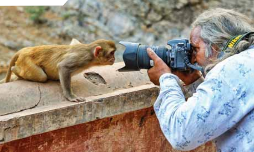
A photographer takes a photo of a macaque monkey at the Shrine Galtaji temple, in Jaipur