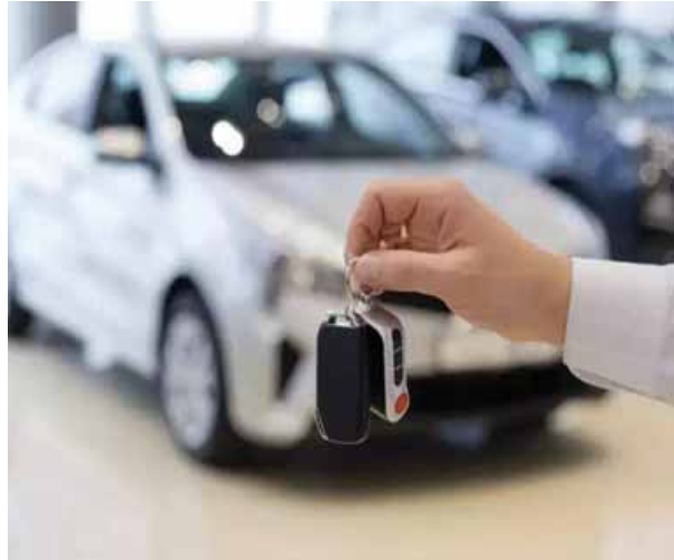
FADA said. Passenger vehicle sales grew 32.38 per cent to 4,83,159

The total vehicle retail sales in October 2023 stood at 21,43,929 units, as per FADA. The strong growth in October this year was largely driven by the rural market, especially boosting two-wheeler and passenger vehicles sales, supported by increased Minimum Support Price (MSP) for Rabi crops,