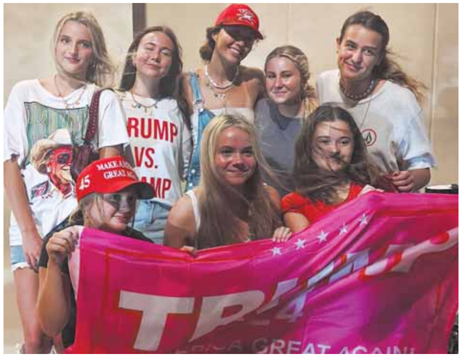
Supporters of Republican presidential nominee former President Donald Trump hold banners as they take part in Trump's Election Night Watch Party, at Palm Beach (Florida).

By midday Wednesday in the Middle East, Donald Trump was elected the 47th president of the United States in a remarkable political comeback. Tensions still remain high between the nations, 45 years after the 1979 US Embassy takeover and 444-day hostage crisis that followed.