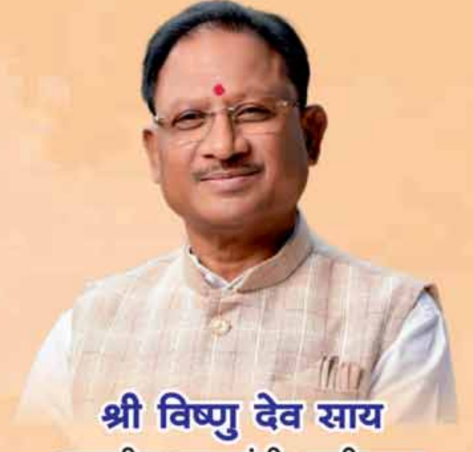
श्री विष्णु देव साय माननीय मुख्यमंत्री, छत्तीसगढ़