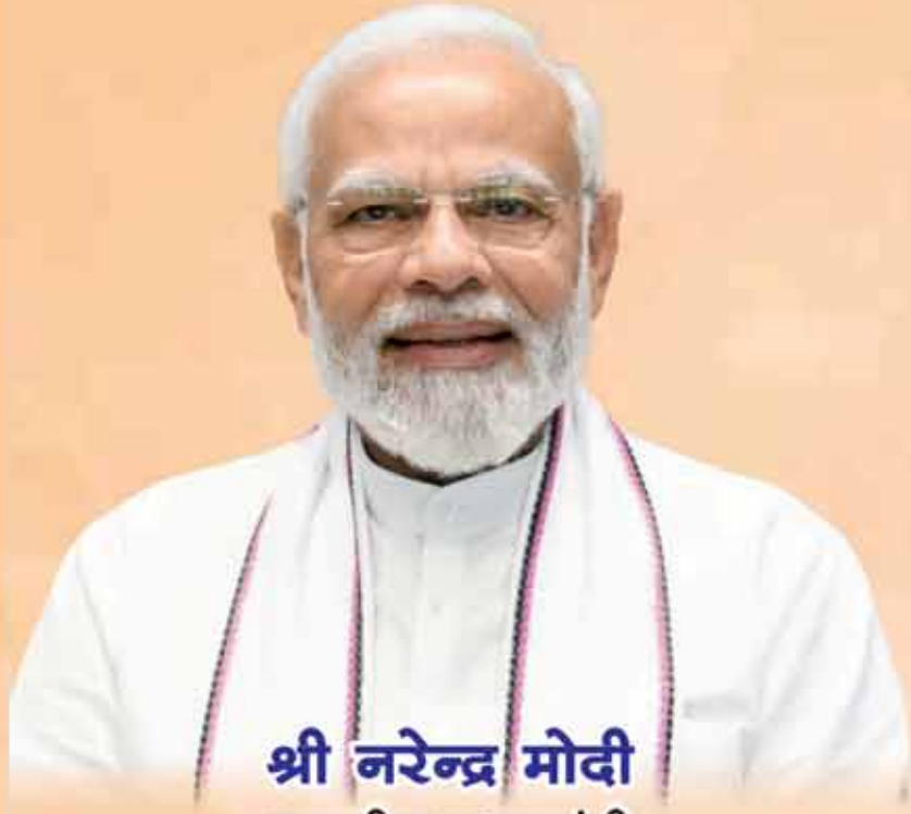
श्री नरेन्द्र मोदी माननीय प्रधानमंत्री