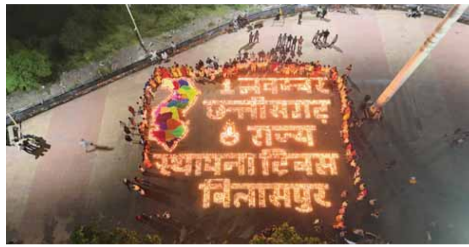
distributed sweets and gifts to sanitation workers.