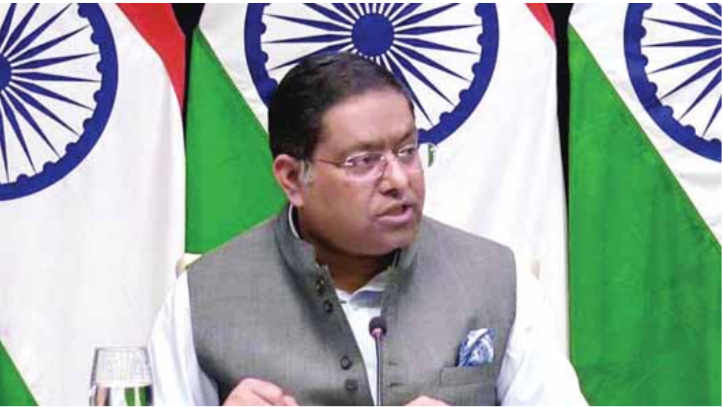
MEA Spokesperson Randhir Jaiswal