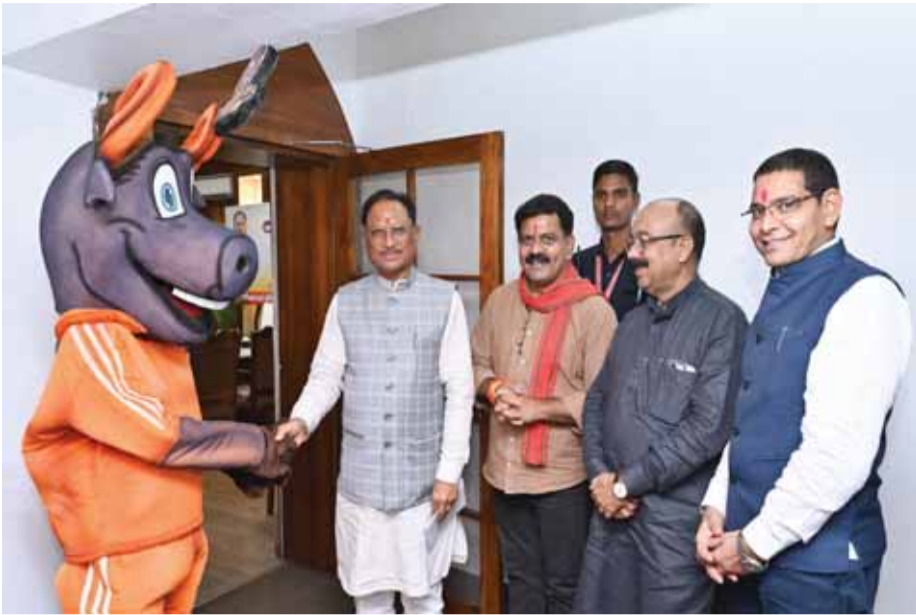
and the mascot of the event. The mascot contains pictures of a wild bison and a