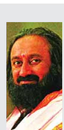
Sri Sri Ravi Shankar Spiritual Guru

H APPINESS is the one thing that everybody is seeking. People do find happiness but it is momentary; for couple of hours or days. True happiness is when you find inner stability and comfort. You know you are connected to something unimaginably bigger and that there is an unshakable power within you. Here are a few pointers to ensure that happiness simply wells up in you. HEALTH: In India, "swastha" refers to one who is established in oneself. A healthy person has a smile on the face, love in the heart and strength and vitality in the body. Seeing life with the eyes of wisdom makes negative emotions go away and you start smiling from the core of your being. ATTACHMENTS: These cause feverishness that take away peace of mind. You are in pieces and fall prey to misery. Your first step is directing your attachment to the Knowledge and the Divine. Your