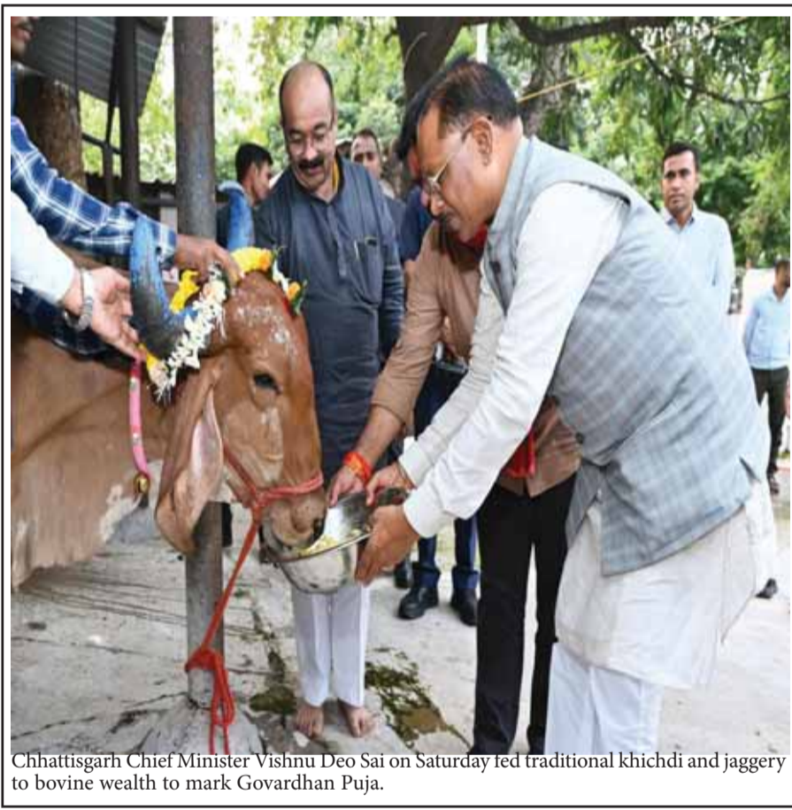
Chhattisgarh Chief Minister Vishnu Deo Sai on Saturday fed traditional khichdi and jaggery to bovine wealth to mark Govardhan Puja.

An allocation of Rs 131.50 crore has been made to upgrade infrastructure in 36 colleges in the region.