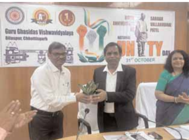
farmer in Gujarat, became a leader of the nation, earning the title Iron Man due to his visionary decisions regarding national integration.