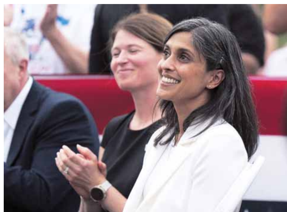
Usha Vance smiles as her husband Republican vice presidential nominee Sen. JD Vance, R-Ohio, speaks at a campaign rally on Friday in Selma, NC.

Residents of Israel's northern communities near Lebanon, roughly 60,000 people, have also been displaced for more than a year. Israel has also stepped up its offensive against Hamas' remaining fighters in Gaza, raising concerns about humanitarian conditions for civilians still there. The World Health Organisation has said it plans to finally resume its polio vaccination campaign on Saturday, but only in Gaza City as towns further north remain inaccessible as Israel tightens its siege. Israel's war in Gaza has killed more than 43,000 Palestinians since October 7, 2023, when Hamas militants killed roughly 1,200 people in Israel and took some 250 hostages back to Gaza. Health officials inside Hamas-run Gaza do not distinguish between civilians and combatants, but say more than half of the dead in the enclave are women and children.