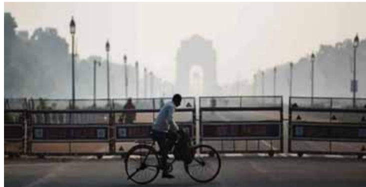
pollution is also causing allergies, leading to irritation and watering of the eyes; and throat infections. "PM2.5 microns can pass through the bloodstream and cause damage to lungs, liver, and kidneys," Goyal said.