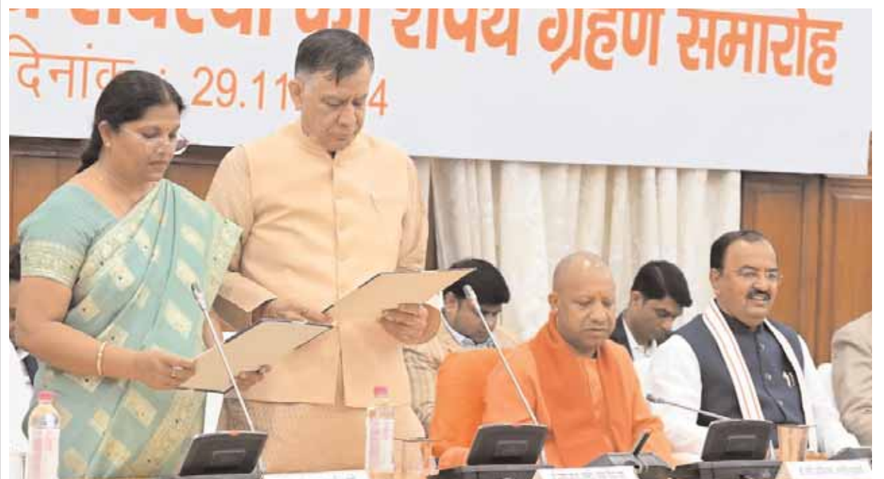
PNS ■ LUCKNOW

On the occasion of the oath ceremony of the newly-elected Bharatiya Janata Party MLAs in the recent bypolls, Chief Minister Yogi Adityanath urged the legislators to unitedly pledge their commitment to the resolution of 'Nation First'. The MLAs expressed their support for the leadership of Prime Minister Narendra Modi and Chief Minister Yogi, pledging to work for the nation's progress and prosperity. Assembly Speaker Satish Mahana administered the oath to the newly-elected MLAs. The swearing-in ceremony for the newly-elected MLAs took place on Friday at the Tilak Hall of the Uttar Pradesh Assembly. Chief Minister Yogi congratulated the winning candidates, calling the victory a resound-