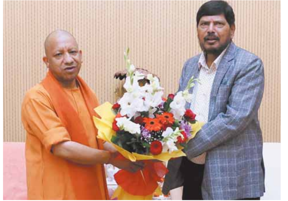
Union MoS for Social Justice & Empowerment Ramdas Athwalwa paid a courtesy call to Uttar Pradesh Chief Minister at his official residence in Lucknow on Friday

flames spreading quickly due to the highly combustible materials stored in the warehouse. The fire brigade worked in challenging conditions, as smoke filled the warehouse, forcing firefighters to wear masks while working inside. In addition to the efforts of the fire brigade, local authorities took swift action to ensure public safety by evacuating nearby homes. The area around the warehouse was cordoned off, and traffic was diverted to ensure that fire trucks could reach the site. The fire brigade's timely intervention prevented any fatalities or serious injuries. As the situation began to stabilise, more fire brigade vehicles were requisitioned to address any remaining threats. A huge crowd gathered near the warehouse to witness the operation. While the exact cause of the fire remains under investigation, authorities have pointed to the likelihood of an electric short circuit as the trigger. Efforts to fully control and extinguish the remaining fire are ongoing.