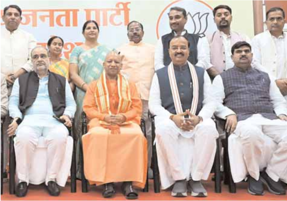
PNS ■ LUCKNOW

Chief Minister Yogi Adityanath, on Friday, lashed out at the opposition parties, accusing them of resorting to baseless allegations in the wake of Bharatiya Janata Party's resounding victory in the recent by-elections to nine Uttar Pradesh assembly seats. Playing the opposition's attempts to discredit the success of the party, he emphasised that their defeat had left them nervous and unable to cope with the BJP's growing influence. He assured that the party would achieve an even more decisive victory in the UP assembly elections in 2027. Yogi Adityanath was addressing the felicitation ceremony of the newly-elected MLAs in the by-elections at the BJP headquarters on Friday.