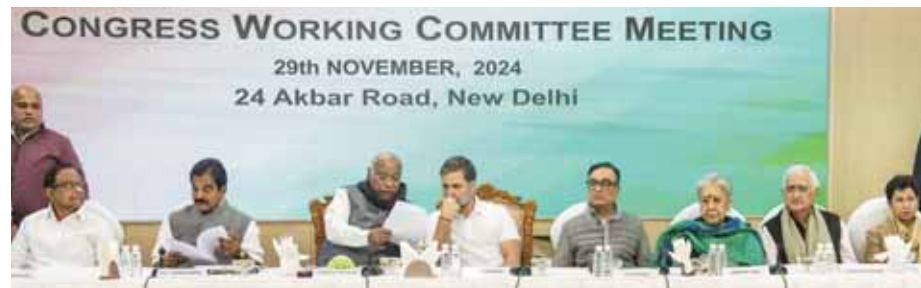
LoP in the Lok Sabha and Congress leader Rahul Gandhi with party President Mallikarjun Kharge and party leaders P Chidambaram, K C Venugopal, Ajay Maken and others during the Congress Working Committee meeting, at the AICC headquarters in New Delhi

Jolted by the recent Assembly poll outcomes for the party, Congress leaders on Friday huddled up on its electoral defeats during which party chief Mallikarjun Kharge asserted that "tough decisions" will have to be taken to strengthen the organisation from the grassroots, accountability has to be fixed, and urged leaders to remain united and not speak publicly against each other. In his address at the Congress Working Committee meeting at the AICC headquarters, Kharge said he believes that the EVMs have made the electoral process "suspect" and stressed that it is the constitutional responsibility of the Election Commission to ensure free and fair elections in the country. Kharge said that due to the Congress' repeated defeats, "fascist forces" are making their roots deeper. "One by one they are also taking over the institutions of the state," he added. The meeting was chaired by Kharge and attended by former party chief Rahul Gandhi and AICC general secretaries Priyanka Gandhi Vadra, K C Venugopal and Jairam Ramesh, among others. While the Maha Vikas Aghadi, of which the Congress is a part, was