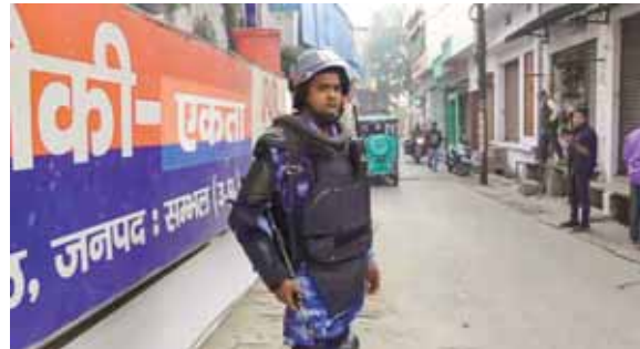
A security official stands guard at Sambhal

The inquiry will also delve into the role of individuals or groups suspected of instigating the unrest. In addition, the commission will scrutinise the actions taken by the police and local administration during and after the incident. The judicial panel has been directed to submit its findings within two months from the date of the notification, and will seek to uncover the reasons behind the violence. Should an extension to this period be required, it will need approval from the state government. Alongside identifying the causes of the violence, the commission will provide recommendations to prevent such incidents from recurring in the future. In a notification issued on November 28, the Governor highlighted the importance of a thorough and transparent investigation into the matter. This will ensure the public's trust in the judicial process and serve the greater interest of justice. Continued on page 8