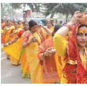
Kalash Yatra being taken out in Varanasi

A Kalash Yatra was taken out on the occasion of the two-day programme of 'Maha Samagam of 51 Shakti Peeths and 12 Jyotirlingas of Maa Sati' under the joint aegis of Center for Sanatan Research and Trident Seva Samiti Trust here on Friday. The Kalash Yatra was taken out from Chittaranjan Park near Dashashwamedh Ghat which reached Kashi Vishwanath Corridor (Shri Kashi Vishwanath Dham) via Godowlia and Bansphanak.