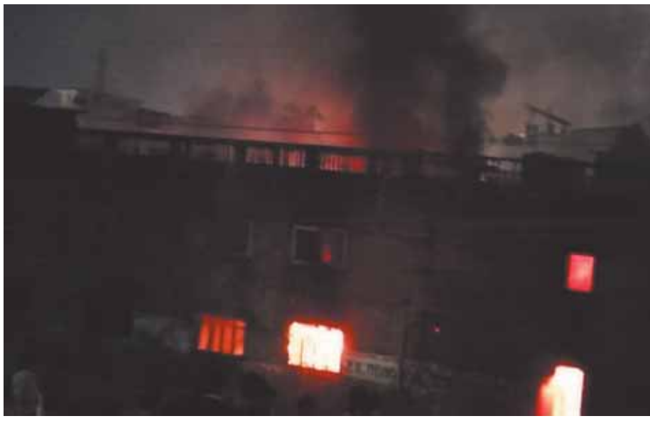
Thick smoke emanating from the furniture warehouse which went up in flames on Friday evening

A massive fire broke out at a three-storey furniture warehouse in Lucknow on Friday evening, causing panic in the surrounding area. The warehouse, located near Shaktinagar Dhal in the Ghazipur police station area, was packed with a large quantity of furniture, mattresses, and other highly flammable materials. The fire spread quickly, engulfing the entire building and creating a chaotic situation in the locality. As soon as the fire was reported, emergency services sprang into action, with a total of 10 fire tenders dispatched to the site. Firefighters worked tirelessly to control the blaze, battling intense flames and thick smoke. The fire spread rapidly due to the presence of mattresses, foam, and wood, which fuelled the fire further. However, the fire brigade was able to prevent the flames from spreading beyond the warehouse and into the nearby buildings. Fortunately, no casualties were