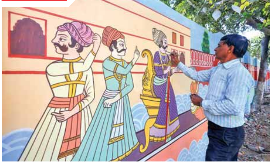
Artist paints a wall as beautification drive ahead of the Rising Rajasthan event, in Jaipur