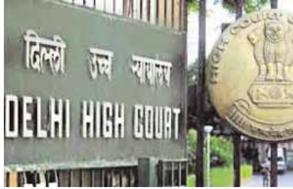
differences within the Delhi administration. It also expressed its anguish over the non-completion of several upcoming hospitals due to lack of funds with the city government. The court said it was getting petitions by legislators everyday with respect to their