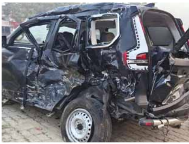
The badly damaged SUV that met with an accident in Tirwa, Kannauj, early on Wednesday morning.