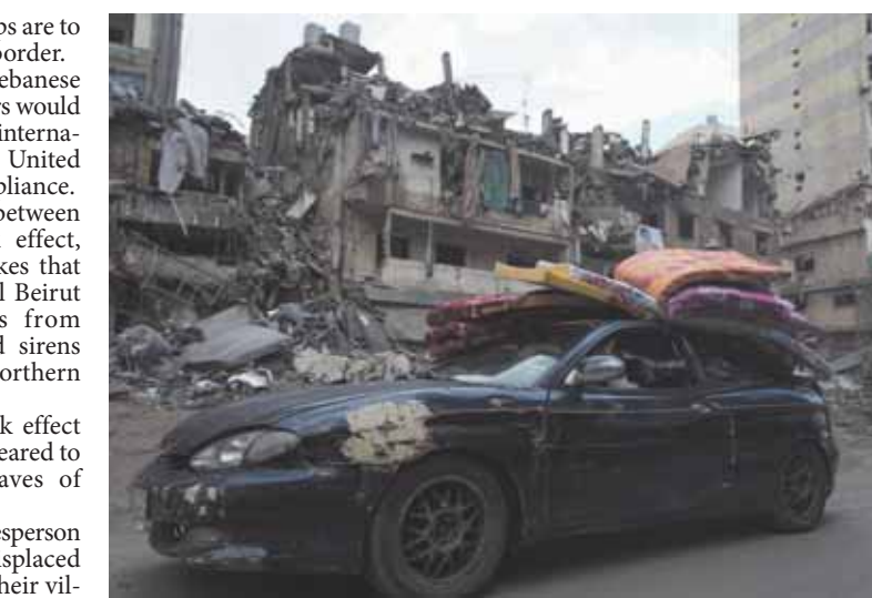
But some videos circulating on social media show displaced Lebanese defying these calls and returning to villages in the south near the coastal city of Tyre. Israeli troops were still present in parts of

Lebanon, while Israeli troops are to return to their side of the border. Thousands of additional Lebanese troops and UN peacekeepers would deploy in the south, and an international panel headed by the United States would monitor compliance. Hours before the ceasefire between Israel and Lebanon took effect, Israel launched broad strikes that shook the Lebanese capital Beirut and a volley of rockets from Hezbollah set off air raid sirens across a large swath of northern Israel. But after the ceasefire took effect early Wednesday, quiet appeared to take hold, prompting waves of Lebanese to head home. Israel's Arabic military spokesperson Avichay Adrae warned displaced Lebanese not to return to their villages in southern Lebanon. The Lebanese military asked displaced returning to southern Lebanon to avoid frontline villages and towns near the border where Israeli troops are still present until they withdraw.