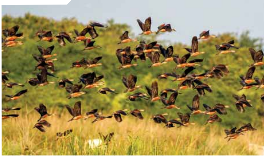
A flock of whistling ducks fly at the Pobitora Wildlife Sanctuary, in Morigaon