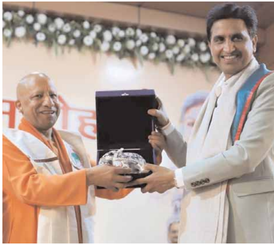
Chief Minister Yogi Adityanath awards honorary DLitt degree to Dr Kumar Vishwas on behalf of Allahabad University

young people throughout history, mentioning the contributions from Lord Ram, Lord Krishna, Lord Buddha, Mahavir and numerous national revolutionaries. He highlighted the sacrifice of Pandit Ram Prasad Bismil, who, before being hanged in Gorakhpur jail, did not ask for freedom or riches, but only wished for the end of the chains of slavery. Chief Minister Yogi also noted that when Veer Savarkar was sentenced to life imprisonment at the age of 28, and when Maharana Pratap fought the Battle of Haldighati at 27, they were young men determined to fight for their homeland. He also recalled the courage of Chhatrapati Shivaji