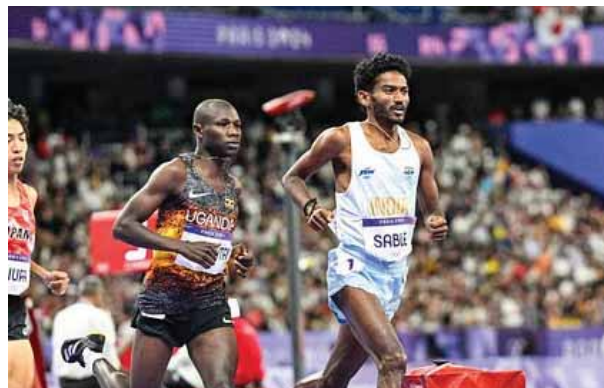
to adapt to endurance. Because speed is just some-

will focus on building up his endurance so that he gets more power while running." Kemboi told PTI Videos in an exclusive interview on the sidelines of Ekamra Sports Literature festival here. The legendary athlete is optimistic about Sable's future but emphasised that the Indian should focus on strategic training. "Just go for high-altitude training... Because we have the best altitude for training in the regions of Kenya and Ethiopia for his body system