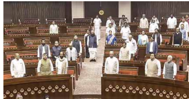
tioned if it is being implemented in letter and spirit. "Are people getting justice, liberty? Is there freedom of expression? Where is fraternity? Only bowing to the Constitution will not lead to it being followed," he said.

Opposition leaders on Tuesday demanded a debate on the Constitution in both Houses of Parliament. Leader of Opposition in Rajya Sabha Mallikarjun Kharge said he and Lok Sabha Leader of Opposition Rahul Gandhi have written to the Chair in the two Houses requesting that a discussion should be held on the Constitution for two days in both Houses.