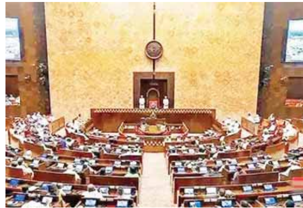
April 2, 2026. Jawhar Sircar of the TMC had resigned in April following the rape-murder of a woman doctor in Kolkata, creating a vacancy in the state. He was otherwise to retire in April 2026.

Bypolls to six vacancies in Rajya Sabha across four states will be held on December 20, the Election Commission announced on Tuesday.