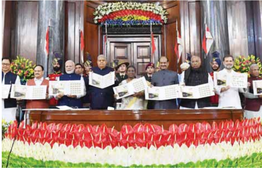
India's Constitution is a living and progressive document and the country's farsighted Constitution-makers provided for a system of adopting new ideas, according to the needs of the changing times, she said.

A commemorative coin and stamp were released on the occasion. Books titled "Making of the Constitution of India: A Glimpse", "Making of the Constitution of India and its Glorious Journey" and a booklet dedicated to the illustration in the Constitution were also released.