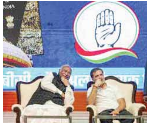
ing any "constitutional integrity or federal character" and alleged that the party was undoing everything that BR Ambedkar and other members of the Constituent Assembly did through the Constitution. Rahul Gandhi said the coun-

Congress leader Rahul Gandhi on Tuesday alleged that Prime Minister Narendra Modi and the RSS were strengthening the wall obstructing the path of Dalits, Adivasis and OBCs, even as he acknowledged that the efforts of the UPA government to bring down that wall were not sufficient.