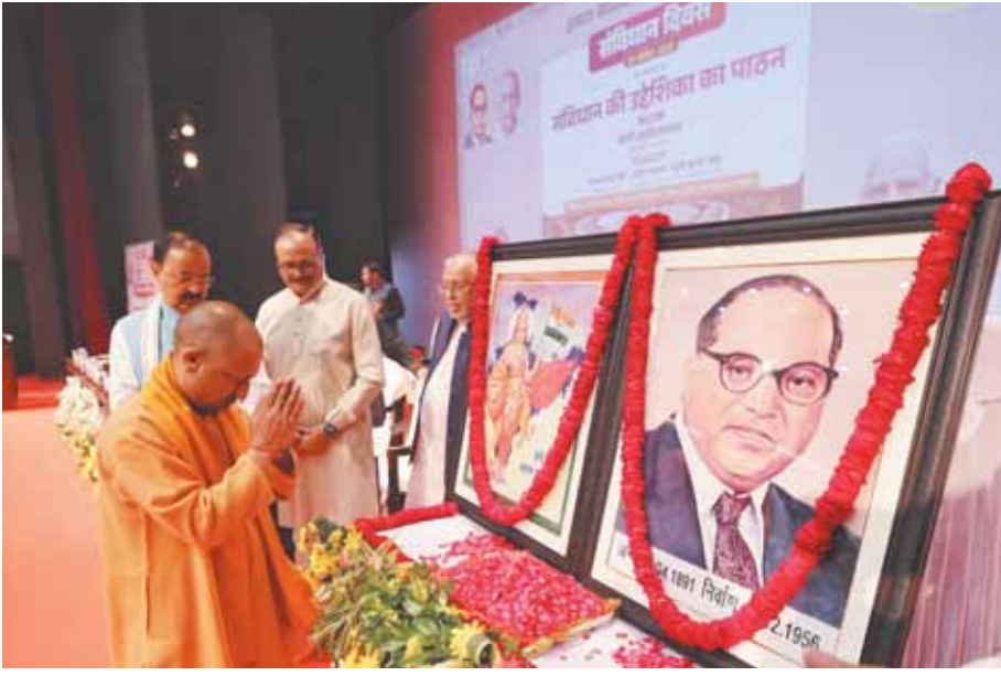
Chief Minister Yogi Adityanath pays tribute to a portrait of Dr BR Ambedkar on Constitution Day at Lok Bhawan on Tuesday

Praising India's democracy, Yogi highlighted that the Indian Constitution ensures equal voting rights for individuals of every caste, opinion, and religion. He noted that while other democracies around the world were grappling with discrimination, India had already granted universal suffrage to all adult citizens in its general elections, a testament to the foresight of Dr Ambedkar and the Constituent Assembly.