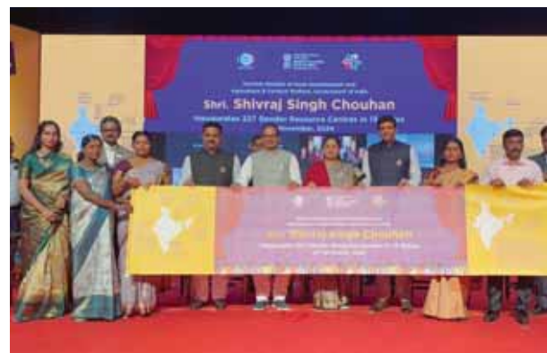
During his address, Chouhan emphasised that the government has undertaken multiple initiatives for the social and economic development of women, stressing that GBV is prevalent not only in rural areas but also in urban spaces, said a statement here.

Union Minister of Rural Development, Shivraj Singh Chouhan, on Tuesday inaugurated 227 new Gender Resource Centres (GRCs) across 13 states, designed to provide survivors of gender-based violence (GBV) with safe spaces, access to vital information, legal support, and a network to report incidents.