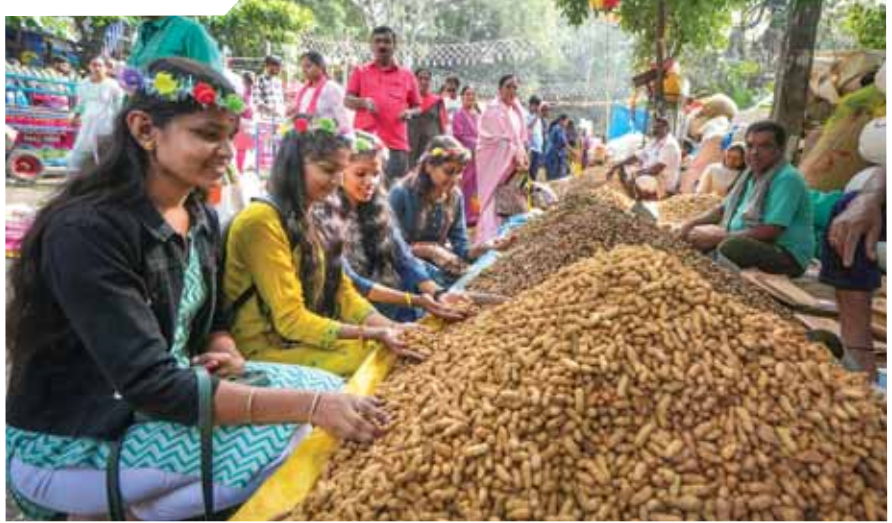
People buy groundnut during the inauguration of the 'Kadalekai Parishes', in Bengaluru