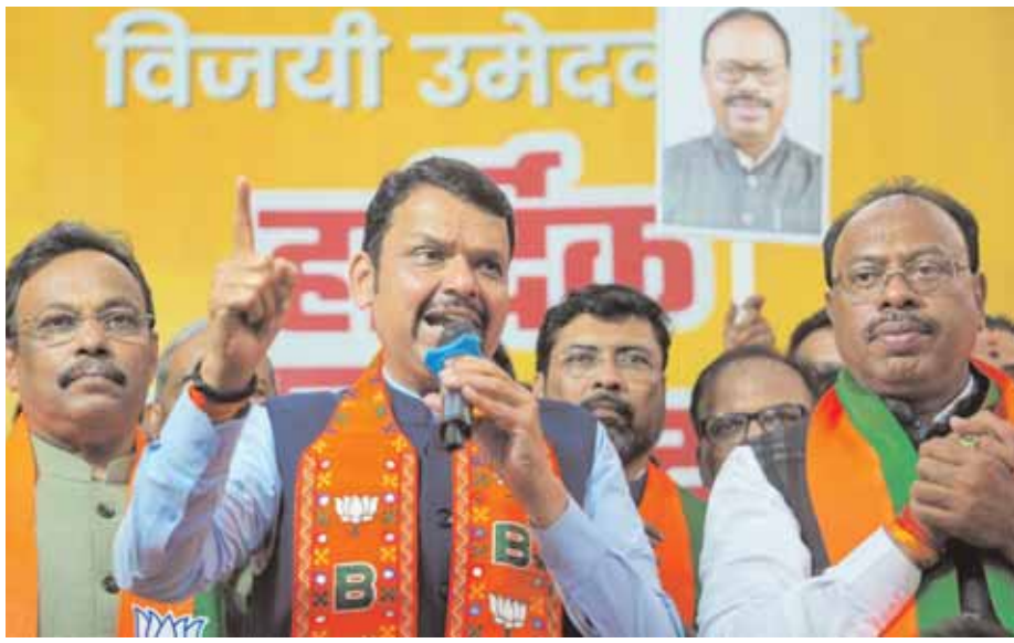
TN RAGHUNATHA ■ MUMBAI

Not many in Maharashtra political circles can forget his much-discussed statement Me-Punha-Yain-Me-Punha-Yain that he had made repeatedly in the run-up to the 2019 state Assembly polls to suggest that he would return as the chief minister of the state. It did not happen then. But, this time around, Devendra Fadnavis will in all likelihood return as the chief minister (CM) of Maharashtra.