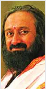
Sri Sri Ravi Shankar Spiritual Guru

A combination of different measures is needed to relieve work-related tension so that it does not affect life at home