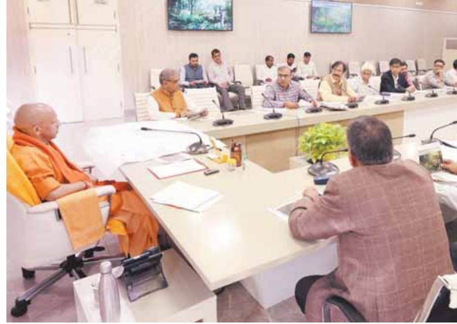
UP Chief Minister Yogi Adityanath chairing a meeting with officials in Lucknow on Tuesday

Uttar Pradesh Chief Minister Yogi Adityanath on Tuesday said the country's first night safari in Lucknow would become operational by December 2026. Chairing a high-level meeting at his official residence, the chief minister said that the safari, spread over 900 acres, would boast of a cafeteria, 7D theatre, auditorium, and ample parking space among other features. "Lucknow's night safari will become a new destination for nature lovers globally," Yogi said, adding that the project is a major initiative of the state government and approval for its construction has been obtained from the Central Zoo Authority, New Delhi. After reviewing the presentation on the proposed Kukrail Night Safari Park and Zoo, he directed that both projects be completed by June 2026, according to an official statement. He emphasised the need to develop a sustainable model for the economy of the night safari and zoo and instructed that 72 per cent of the area be developed with greenery and that the focus should be on solar