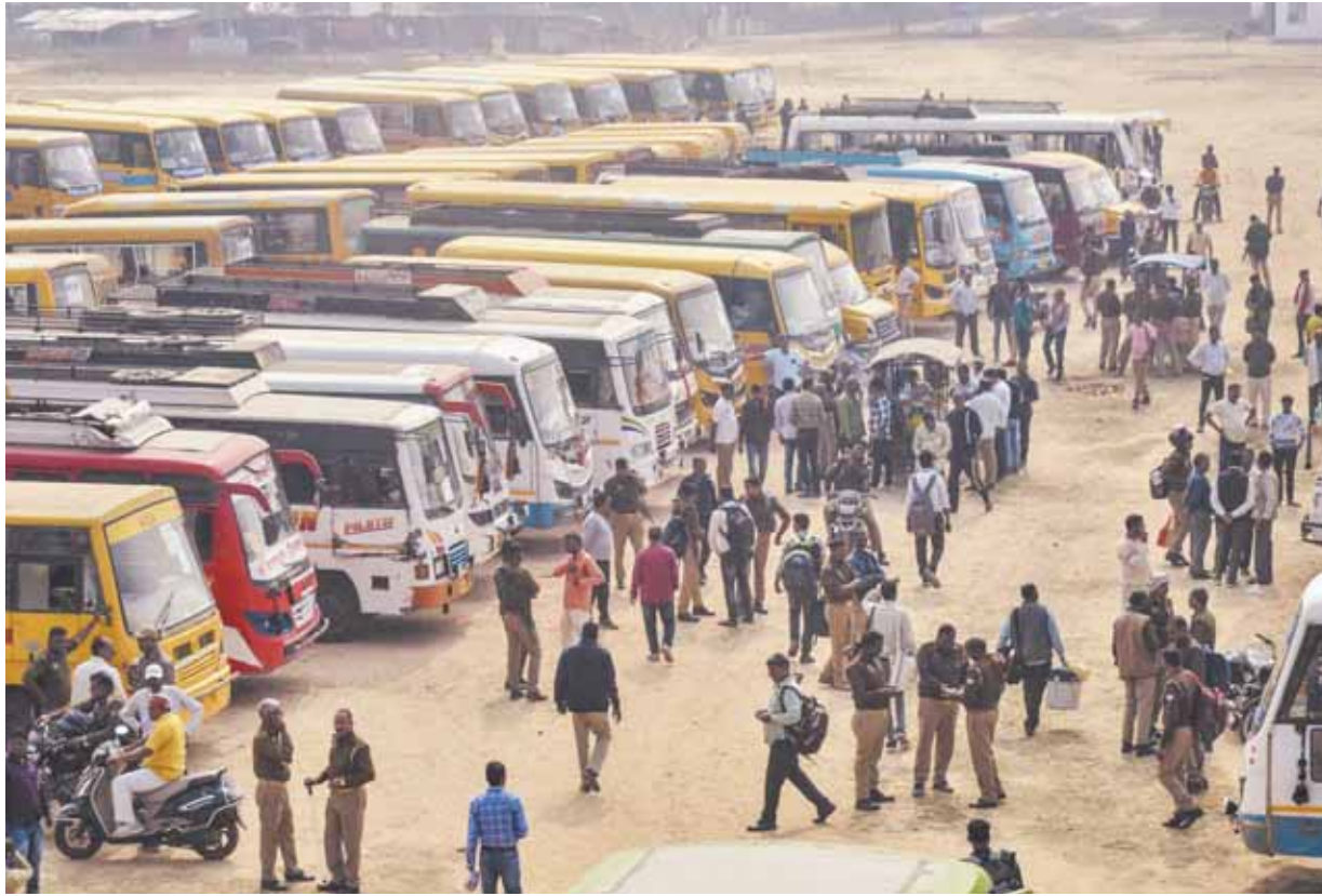
Buses parked at a distribution centre as security personnel and polling officials prepare to leave for poll duty on the eve of bypolls in Mirzapur district on Tuesday

In the first major political contest after the Lok Sabha elections, a direct clash is expected between the BJP and the Samajwadi Party in the by-elections to nine assembly seats in Uttar Pradesh on Wednesday. Congress, a major partner in the opposition bloc INDIA, is not contesting the bypolls and is supporting its partner, the Samajwadi Party. The Bahujan Samaj Party, on the other hand, is contesting all nine seats independently. While Chief Minister Yogi Adityanath led the BJP's charge with his 'batenge to katenge' (divided we fall) slogan, attempting to link Samajwadi Party leaders with 'organised crime and the mafia', SP president Akhilesh Yadav largely focused on 'uniting society' through his 'PDA' (Pichhde, Dalit, Alpsankhyak) formula, and criticised the alleged conflict between the 'double-engine' Central and state governments.