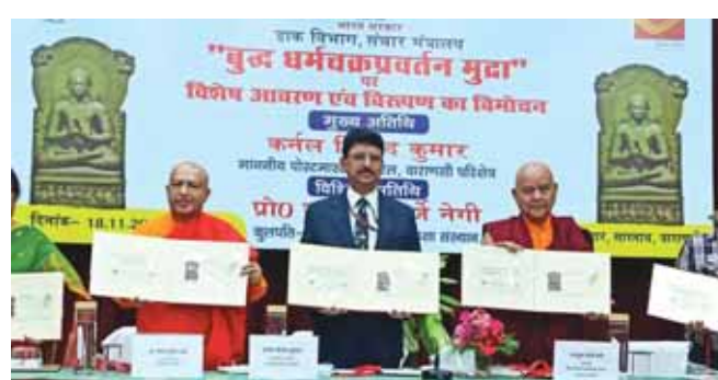
PMG Col Vinod Kumar releasing a special cover on Buddha at Central Institute of Higher Tibetan Studies Sarnath in Varanasi