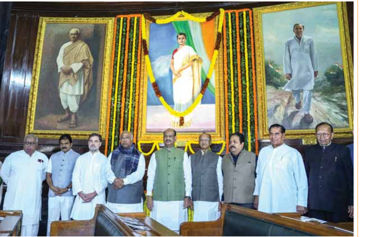
Lok Sabha Speaker Om Birla, Congress President Mallikarjun Kharge and Leader of Opposition Rahul Gandhi and others after paying tribute to former Prime Minister Indira Gandhi on her birth anniversary, at the Central Hall of Samvidhan Sadan, in New Delhi, Tuesday, November 19, 2024