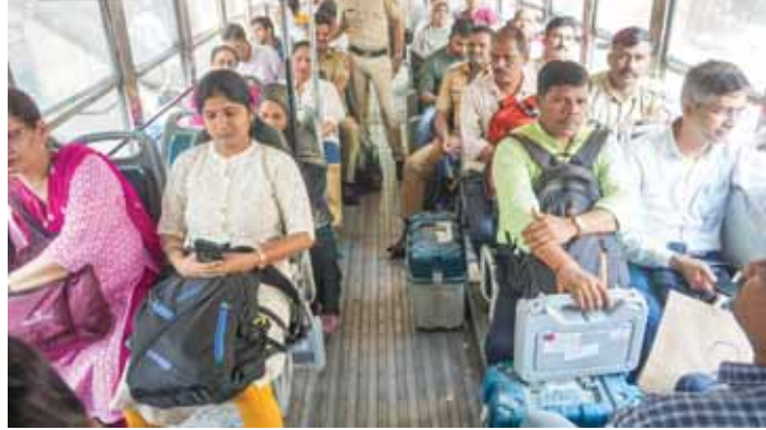
Polling officials leave for their respective polling stations after collecting EVMs and other election materials from a distribution center on the eve of voting for the Maharashtra Assembly polls, in Mumbai

seats. The MVA has allotted the remaining six seats to its smaller allies. The Mayawati-led Bahujan Samaj Party (BSP) fielded the largest number of 237 candidates followed by Prakash Ambedkar-led Vanchit Bahujan Aghadi from which 200 are in the race. The Raj Thackeray-led Maharashtra Navnirman Sena (MNS) is contesting 128 seats. Significantly enough, the BJP, is involved in direct fights with the Congress in at least 75 constituencies across the state. In Vidarbha alone, the two major parties are slugging out against each in as many as 36 out of the total 62 constituencies in the region. Given that the November 20 Assembly polls are being held in the backdrop of two major splits witnessed in the Shiv Sena and NCP in June 2022 and July 2023, there will be several direct fights between the feuding factions of the Shiv Sena and NCP. While the Shinde Shiv Sena will slug it out with the Uddhav Thackeray-led Sena in as many as 39 seats. The feuding NCPs, one led by Ajit Pawar and another headed by Sharad Pawar himself,