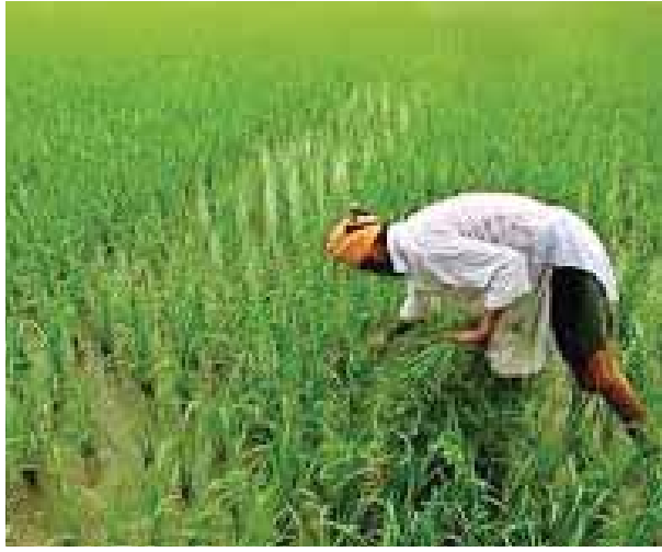
This success however comes with concerns, especially regarding soil health," the minister said. According to Chouhan,

Agriculture Minister Shivraj Singh Chouhan on Tuesday expressed concern over soil degradation affecting 30 per cent of India's land and stressed the need for urgent measures to maintain soil quality for sustainable farming. Addressing a global conference on soil through video conferencing, Chouhan said improving soil health is crucial for achieving Sustainable Development Goals (SDGs) related to zero hunger, climate action and life on land. "We are producing more than 330 million tonnes foodgrains annually and exporting worth USD 50 billion.