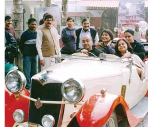
Former Union Minister Vijay Goel with one his coveted vintage cars which he used to take out as part of the exhibition he started to mark the birthday of former Prime Minister Atal Bihari Vajpayee

Amidst the crackdown on vehicles falling under scrap years, vintage car aficionados heaved a sigh of relief as Delhi Lieutenant Governor Vinai Kumar Saxena came to their rescue, directing the Delhi Transport Department that there should be no coercive action on the registered vintage vehicles. However, this has come with a rider that they are not to be driven on roads or used for commercial purposes. There are around 10,000 registered vintage cars in India. LG Saxena has directed that bona fide vintage vehicles will no longer face coercive action by the Transport Department and the Municipal Corporation of Delhi (MCD). According to Raj Niwas, the LG has asked the Commissioner Transport and Commissioner (MCD) to ensure that their enforcement wings desist from coercive action in case of such bona fide vehicles. Acting on a representation made by the Heritage Motoring Club of India, highlighting that their vehicles are being impounded by the authorities and requesting for clarificatory orders in this regard, the LG had asked his Secretariat to issue appropriate directions. The transport department's data shows there are 60,14,493 such vehicles in