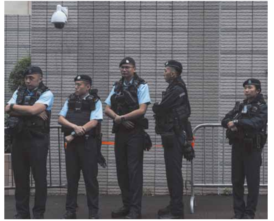
Police officers stand guard outside the West Kowloon Magistrates' Courts in Hong Kong on Tuesday.

Beijing and Hong Kong governments insisted the national security law was necessary for the city's stability. The sentencing drew criticism from foreign governments and human rights organisations. The US Consulate in Hong Kong said the US strongly condemned the sentences for the 45 pro-democracy advocates and former lawmakers. "The defendants were aggressively prosecuted and jailed for peacefully participating in normal political activity protected under Hong Kong's Basic Law," the statement said, referring to the city's mini-constitution. In Beijing, Chinese Foreign Ministry spokesperson Lin Jian told reporters no one should be allowed to use democracy as a pretext to engage in unlawful activities and escape justice. Hong Kong Secretary for Security Chris Tang said in a news briefing that the sentences showed those committing national security crimes must be severely punished. The subversion case involved pro-democracy activists across the spectrum. They include Tai, former student leader Joshua Wong and former lawmakers. Wong was sentenced