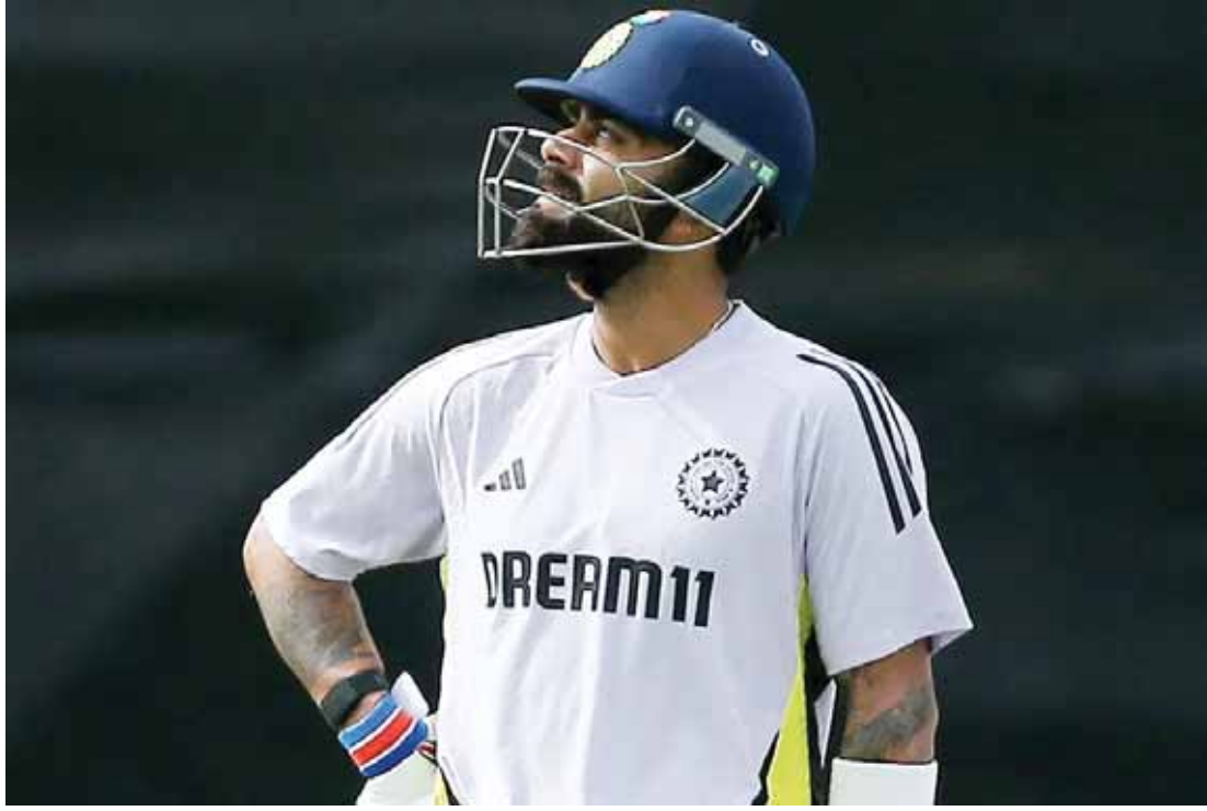
Gavaskar believes these stats will provide a significant confidence boost as Kohli prepares for the upcoming five-match series,

Virat Kohli will be "very, very hungry" for runs following his lean patch against New Zealand, according to former Indian captain Sunil Gavaskar, who feels the veteran batter's strong track record Down Under will boost his confidence heading into the upcoming Test series against Australia. Kohli has faced a challenging patch in all formats over the past few months. In his last 60 Test innings, he has managed just two centuries and 11 half-centuries. This year, he has averaged only 22.72 across six Tests, and in the three games against New Zealand, he could manage only 93 runs. "Because he hasn't scored runs against New Zealand, he'll be very, very hungry," Gavaskar told Star Sports. "Even in that Adelaide Test, where India was bowled out for 36 in the second innings, Kohli scored 70-plus runs in the first innings before being run out," he added. Despite these recent struggles, Kohli has an outstanding record in Australia. The right-hander, who has been part of four tours Down Under, averages a stellar 54.08.