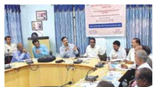
Entomological training workshop being held in Varanasi on Monday.