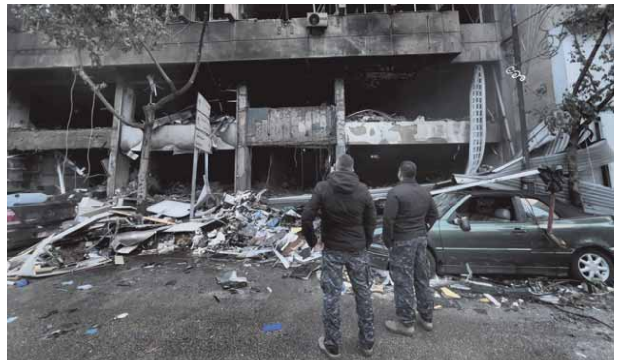
Lebanese policemen stand in front of destroyed shops that were hit Sunday evening in an Israeli airstrike in central Beirut, Lebanon on Monday.

tion "is to make sure the (Israeli) aggression fails to achieve its goals, while negotiation is for the state and the government." A Western diplomat familiar with the talks told The Associated Press there is a sense of "cautious optimism." "Diplomatic efforts are converging towards a cease-fire, but it's still in the hands and heads of key players to decide if it's in their interest or not to stop things right now," said the diplomat, who was not authorized to brief media and so spoke on condition of anonymity. The efforts are aimed at reestablishing a UN buffer zone in southern Lebanon established after the 2006 Israel-Hezbollah war.