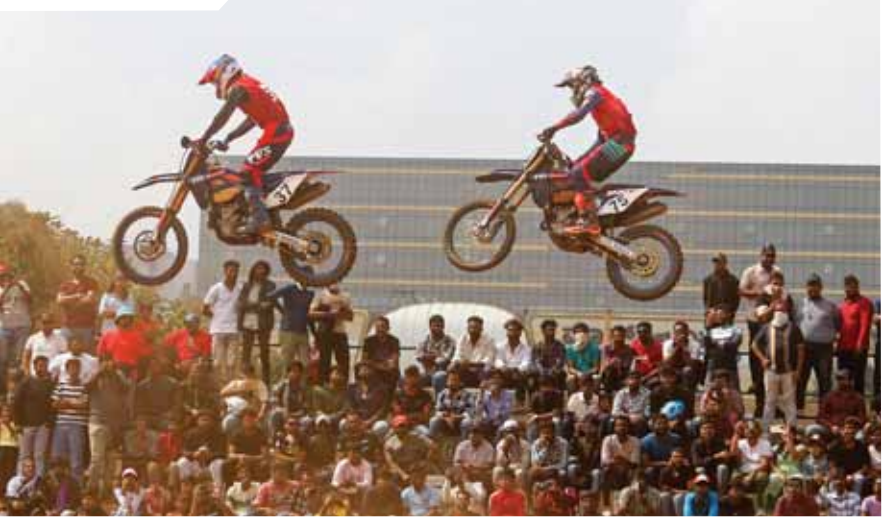
Riders take part in the MRF MOGRIP Supercross Championship 2024, in Bengaluru