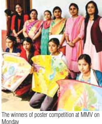
The winners of poster competition at MMV on Monday