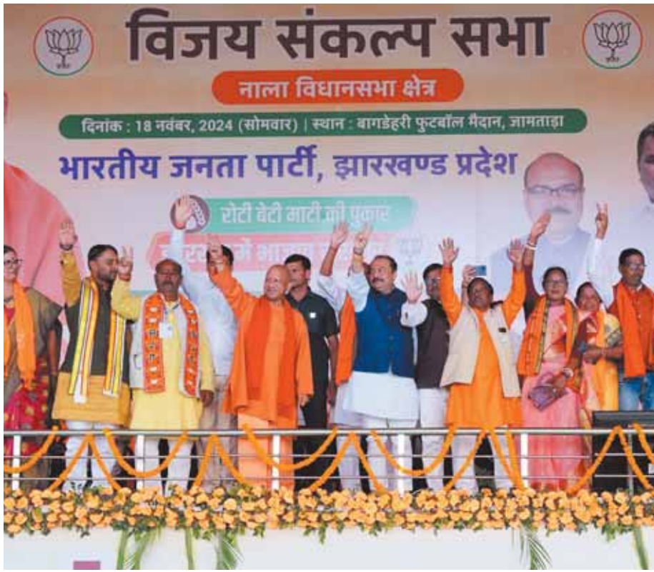
(Right) Chief Minister Yogi Adityanath waves at the crowd at an election rally, and (Right) performs jalabhishek at Baba Vaidyanath temple, one of the twelve sacred Jyotirlingas, in Jharkhand on Monday

Highlighting the illegal activities in Rajmahal, Sahibganj and surrounding areas, Yogi accused the opposition of turning these regions into safe havens for Bangladeshi infiltrators and Rohingya Muslims. “In BJP-led double-engine governments, there is no place for infiltrators, riots, curfews or hooliganism; only good governance and prosper-