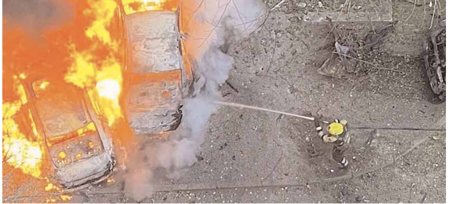
In this photo provided by the Ukrainian Emergency Service, emergency services personnel remove part of a Russian missile that hit an apartment house during massive missile attack in Kyiv, Ukraine, Sunday. AP/PTI

Western allies to bolster the country's air defences to counter assaults and allow for repairs. Explosions were heard across Ukraine on Sunday, including in capital Kyiv, the key southern port of Odesa, as well as the country's west and central regions, according to local reports. The operational command of Poland's armed forces wrote on X that Polish and allied aircraft, including fighter jets, have been mobilised in Polish airspace because of the "massive" Russian attack on neighbouring Ukraine. The steps were aimed to provide safety in Poland's border areas, it said. One person was injured after the roof of a five-story residential building caught fire in Kyiv's historic centre, according to Popko. A thermal repeated emergency power shutdowns and nationwide rolling blackouts. Ukrainian officials have routinely urged