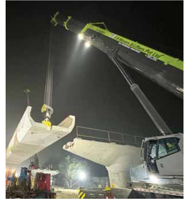
The erection of U-girders for the elevated section under the Kanpur Metro Rail Project began on Saturday.

The erection of U-girders for the elevated section (Agricultural University - Barra-8) of Corridor-2 (CSA - Barra-8) under the Kanpur Metro Rail Project officially began on Saturday. The first U-girder was successfully erected in the morning on Pillars no. 13 and 14 near Company Bagh Chauraha. A total of 184 U-girders will be erected in this section over the coming months. U-girder, approximately 28 metres long and weighing 160 metric tonnes, was carefully positioned with the oversight of senior Kanpur Metro officials and the contracting agency.