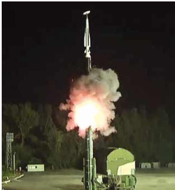
Flight trial of DRDO's long range hypersonic missile being successfully conducted at Dr. APJ Abdul Kalam Island, off-the-coast of Odisha