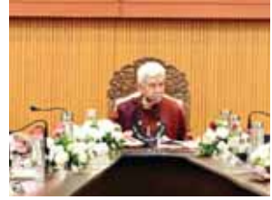
Sinha chaired a high-level security review meeting at the Jammu Convention centre, first after the shifting of the move offices in Jammu. his absence. Sinha chaired a high-level security review meeting at the Jammu Convention centre, first after the shifting of the move offices in Jammu.