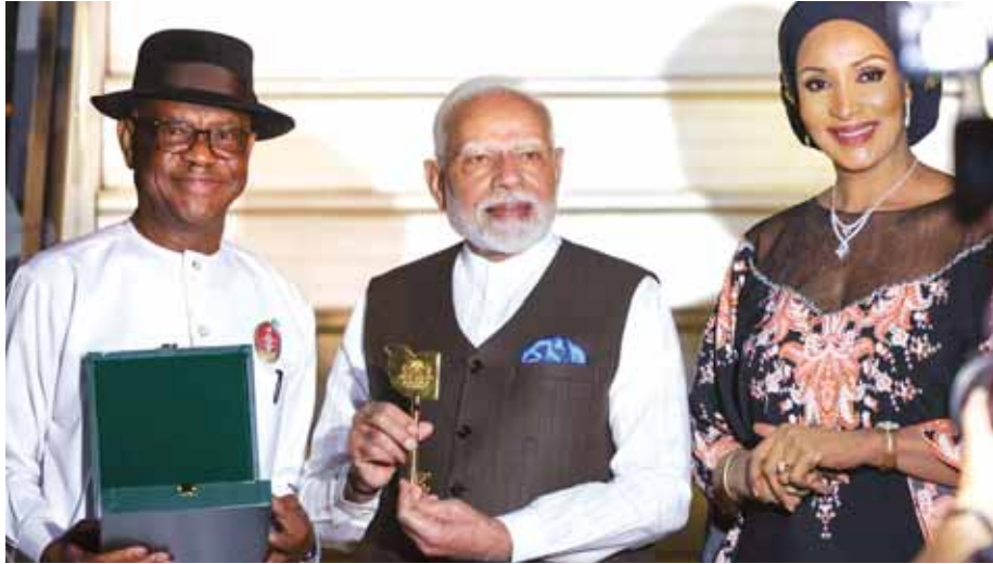
Prime Minister Narendra Modi being received by the Nigerian delegates upon his arrival at the airport, in Abuja, Nigeria, Sunday, Nov. 17, 2024. Modi on Sunday arrived in Nigeria on the first leg of his three-nation visit at the invitation of President Bola Ahmed Tinubu.

India accords high priority to its strategic partnership with Nigeria and it will work towards boosting ties in a range of areas, including defence, energy and trade, Prime Minister Narendra Modi said during his talks with Nigerian President Bola Ahmed Tinubu on Sunday. In his televised opening remarks at the meeting, Modi identified terrorism, separatism, piracy and drug trafficking as major challenges and said the two countries will continue to work together to deal with them. Modi arrived in Abuja early Sunday on the first trip to the country by an Indian prime minister after a gap of 17 years.