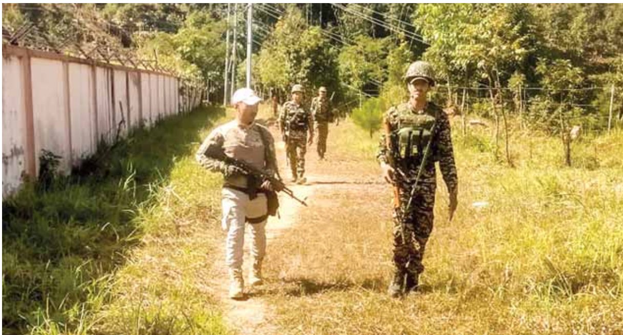
Security personnel patrol in a sensitive area of Manipur. Search operations and area domination were conducted by security forces in the fringe and vulnerable areas of hill and valley districts of the state