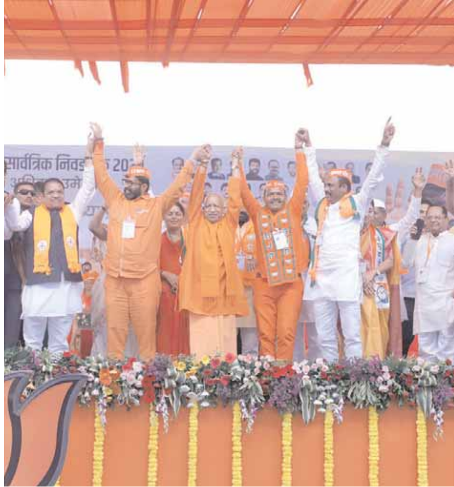
UP Chief Minister during an election rally in Maharashtra on Sunday

killed his mother, sister and aunt. He criticised Kharge for not speaking out against the perpetrators of such atrocities due to fear of his party's leadership. Yogi accused the Congress of appeasing the same extremist elements who continue to disrupt India by stone-pelting during Ganpati Mahotsav and Ramnavami processions or by encroaching on historical sites like Vishalgarh Fort. Yogi asserted that an attack on Sanatan Dharma is an attack on India's foundation and warned of the destructive consequences of such actions. Promising strict measures under a Mahayuti-led government, he vowed to remove encroachments at Vishalgarh Fort and ensure no one dares to disrupt religious processions. He assured that stone-pelters would face decisive action, referencing the 'UP model' of governance. Yogi concluded with a powerful message: "Batenge nahi toh katenge nahi, ek rahenge, toh safe rahenge." Yogi Adityanath emphasised the significance of the upcoming elections for both Maharashtra and India. He contrasted the two main alliances, highlighting the Mahayuti bloc led by Prime Minister Modi, which includes Bharatiya Janata Party, Shiv