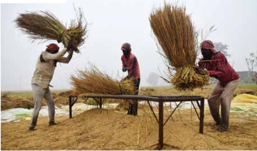
Labourers thresh paddy at a field on the outskirts of Amritsar