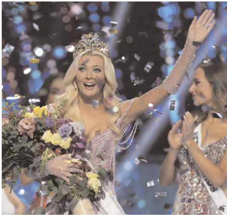
Miss Denmark Victoria Kjalr Theilvig waves after winning the 73rd Miss Universe Beauty Pageant in Mexico City, on Saturday.

inflation in recent years, making it difficult for them to get by. The country is also a major source of irregular migration to Europe, with thousands leaving every year on rickety, artisanal fishing boats in search of economic opportunities. The campaign for the legislative election was marked by sporadic clashes between supporters of different parties. The headquarters of an opposition party were set on fire in the capital, Dakar, and clashes have erupted between supporters in central Senegal in recent weeks, the interior ministry said Monday. On Tuesday, Ousmane Sonko, the country's prime minister who helped catapult Faye to victory, denounced attacks against supporters of PASTEF in Dakar and other cities. "May each patriot they have attacked and injured be proportionally avenged. We will exercise our legitimate right to respond," he wrote on X, before back-peddaling and asking his supporters to remain peaceful in a speech later that day.