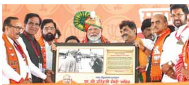
Prime Minister Narendra Modi being felicitated by Maharashtra CM Eknath Shinde and other leaders during a public meeting

Prime Minister Narendra Modi on Thursday said the Congress and its allies are hatching a scheme to have a separate Constitution for Kashmir, and making all efforts for restoration of Article 370. "Will the people of Maharashtra support the Congress and its allies who speak the language of Pakistan," PM Modi said, addressing a rally in Chhatrapati Sambhaji Nagar for the November 20 state Assembly elections. "Congress and its colleagues have passed a resolution to restore Article 370," he said. "When we made Kashmir