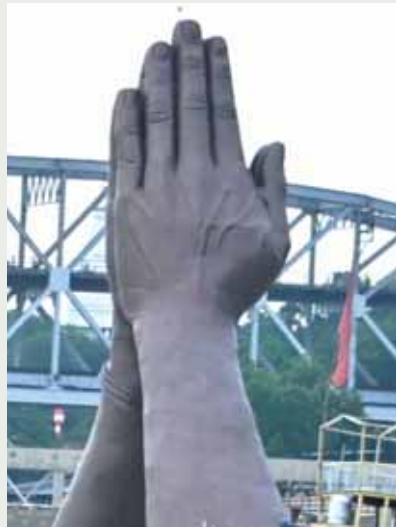
Namaste sculpture at Namoh Ghat in Varanasi which will be inaugurated by Vice President Jagdeep Dhankhar on Friday