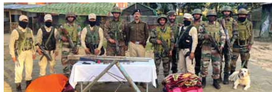
Arms and ammunition recovered during a cordon and search operation conducted by Manipur Police and Security forces in Jiribam district