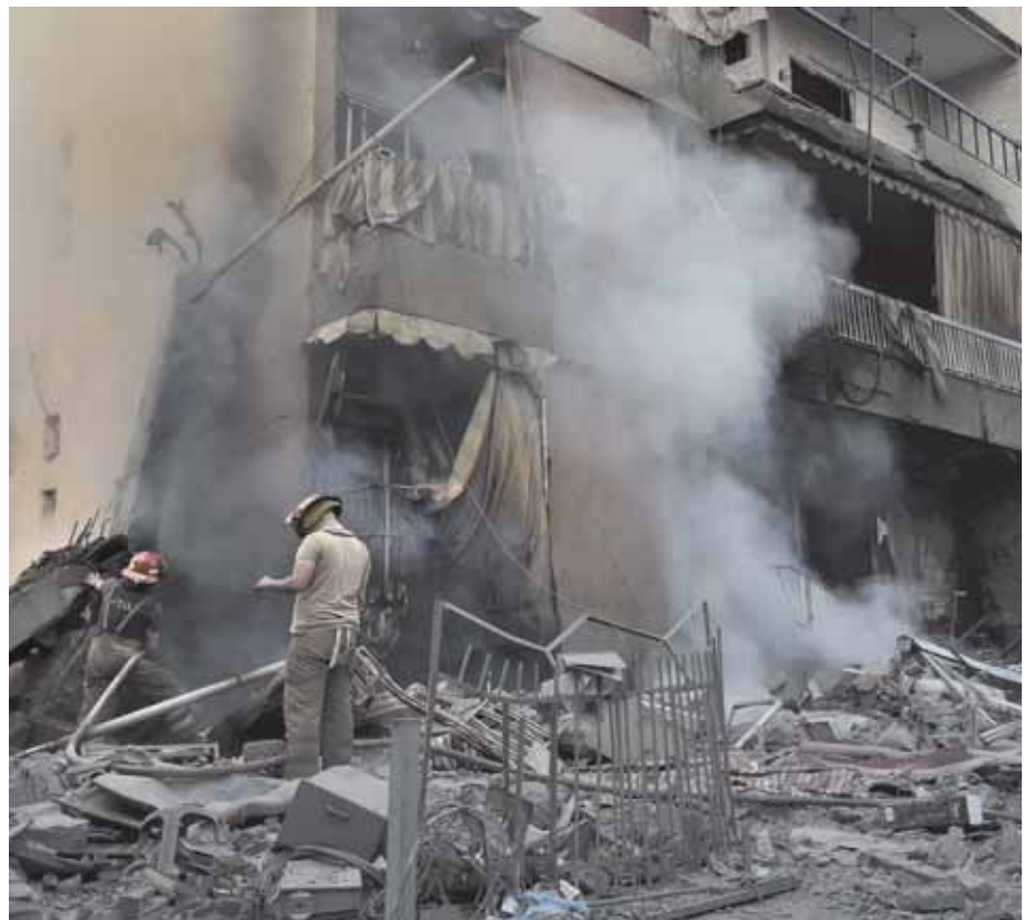
Firefighters try to extinguish a fire as smoke rises from a destroyed building that was hit in an Israeli airstrike in Dahiyeh in the southern suburb of Beirut, Lebanon, on Thursday.