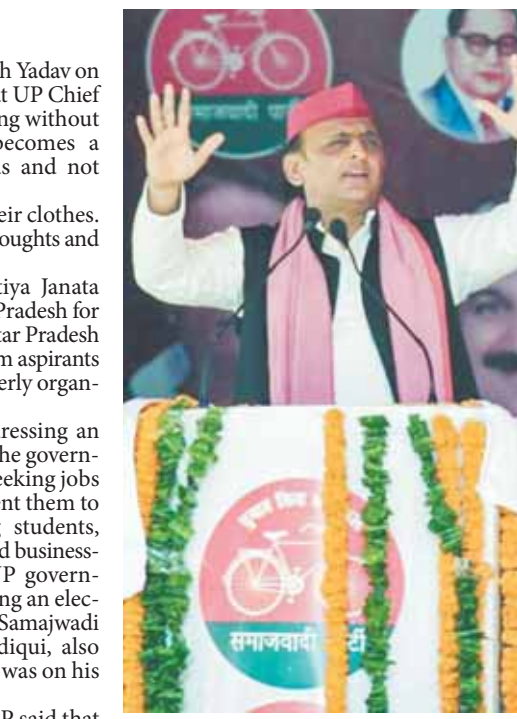
"People know this government is on its way out," he said and added that Yogi Adityanath's chair would not be spared regardless of the outcome of the Maharashtra elections. The SP chief had earlier hinted at tensions between Yogi Adityanath and the BJP's