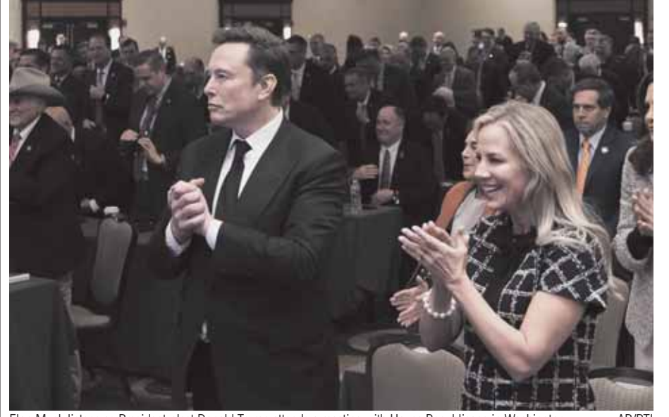
Elon Musk listens as President-elect Donald Trump attends a meeting with House Republicans in Washington.

American people spoke. And so, the president is going to make sure that he puts the American people first. He's going to make sure that we move forward in this process and this transition process in a way that is respectful to the American people and to lead by example," the White House press secretary said. "I think the president has shown that in the past week of that leadership. So, that's what you're going to hear. That's what we're going to continue to do in the 68 days that we have left in this administration," she added.