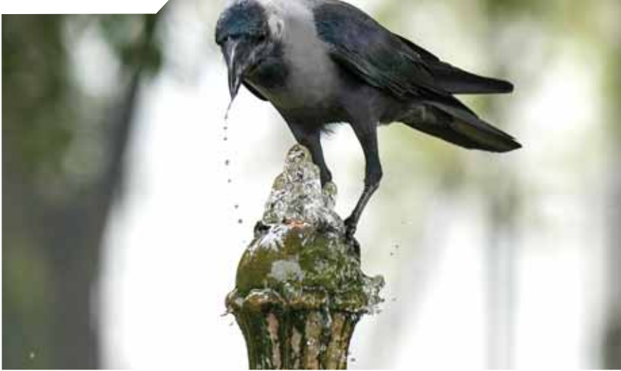
A crow quenches its thirst by drinking water from a fountain, in New Delhi