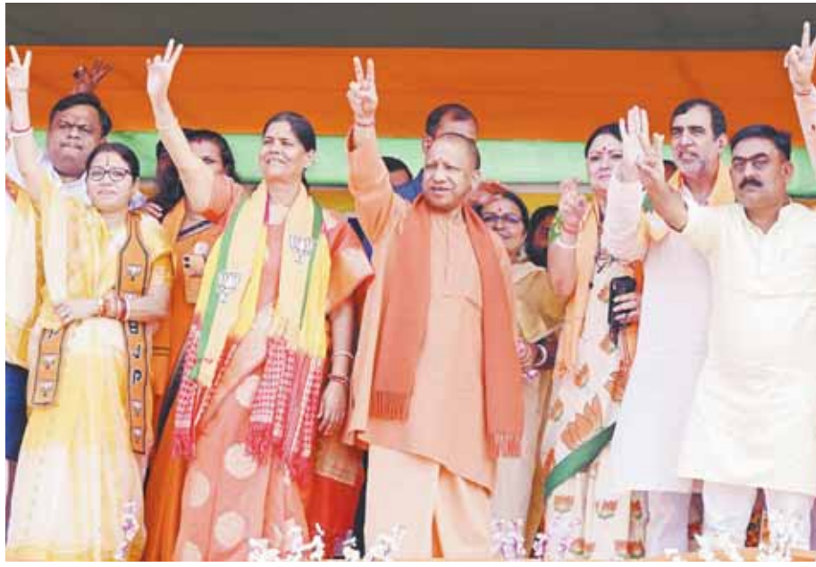
Uttar Pradesh Chief Minister Yogi Adityanath with other BJP leaders during a public meeting ahead of the second phase of Jharkhand Assembly elections, at Nirsra Assembly constituency in Dhanbad district, Jharkhand.