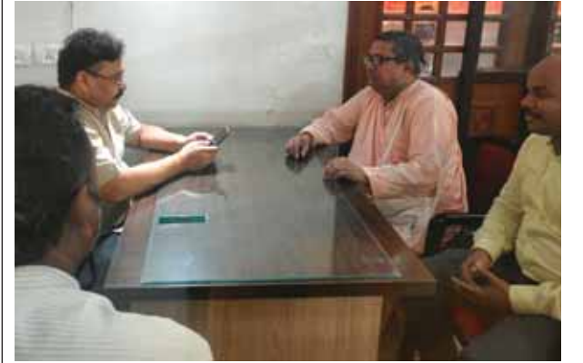
UP Minister of State (Independent Charge) for Stamp and Court Fee and Registration Ravindra Jaiswal listening to problems of the people at PM's Parliamentary Office in Varanasi on Thursday.