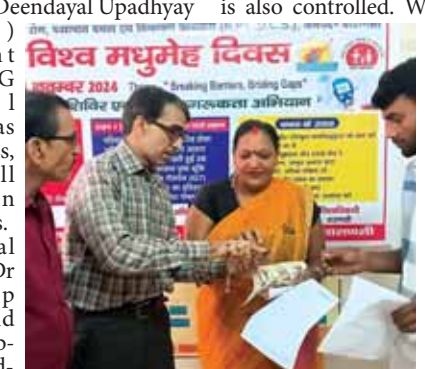
A health programme being held at World Diabetes Day in Varanasi on Thursday.