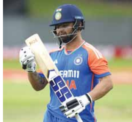
28 runs. The scores 11, 9 and 8 shouldn't be taken in isolation looking at

the past few months, reasons of which aren't exactly clear and it wouldn't be lost on the skipper and interim head coach VVS Laxman. On the face of it, it seems that his batting position and use as a floater at number six and seven isn't helping the Aligarh man's cause. The next T20 World Cup in India is still some distance away in 2026 and Surya, as a skipper, has enough time to dissect and put things back on track for the man, who is too precious to be lost due to lack of clarity. In the current series, Rinku came in at number six in two games and number seven in another and has managed just