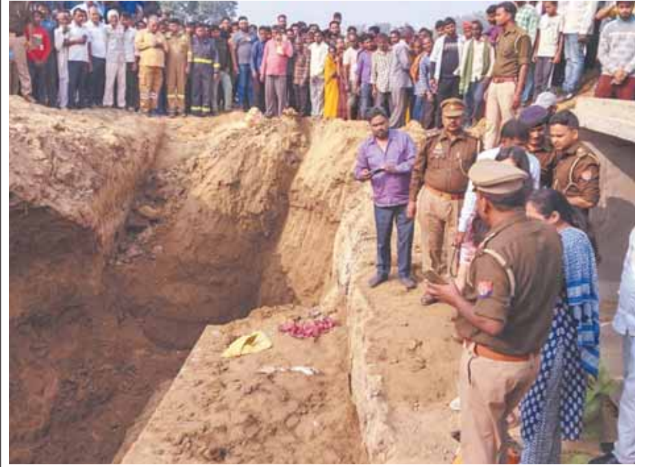
Police personnel conduct investigation as people gather around a mound of mud collapsed in Kasganj on Tuesday