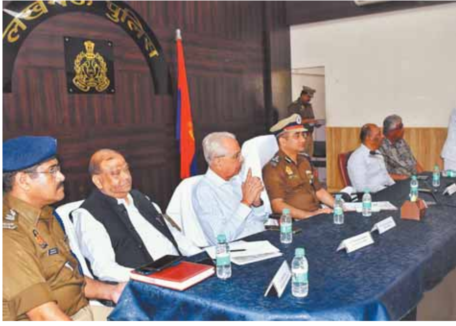
Joint Commissioner of Police (Law and Order) Amit Verma and others in a meeting with representatives from the Uttar Pradesh Hotel and Restaurant Association, along with over a 100 delegates from major hotels and malls

inspection of DFMD/HFMD and bag scanners. He stressed the importance of informing the police about the arrival of foreign delegations and tourists, obtaining necessary permissions for major events (such as celebrity appearances), and adhering to protocols for crowd management and fire safety. "Proper arrangements for crowd management should be in place, along with regular checks of fire-fighting equipment. Restaurants