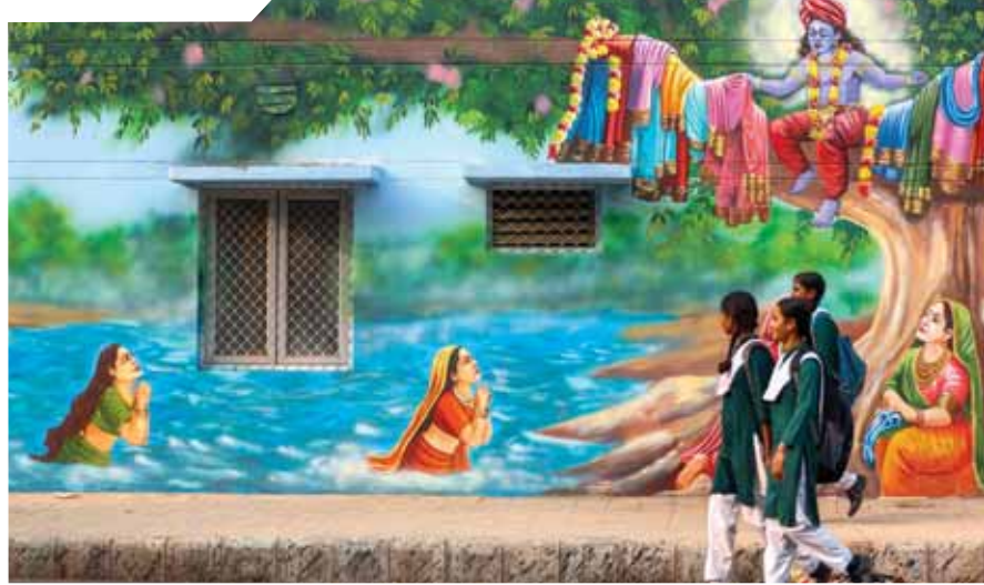
Students pass by a wall painting depicting a scene from 'Krishna Leela', in Prayagraj