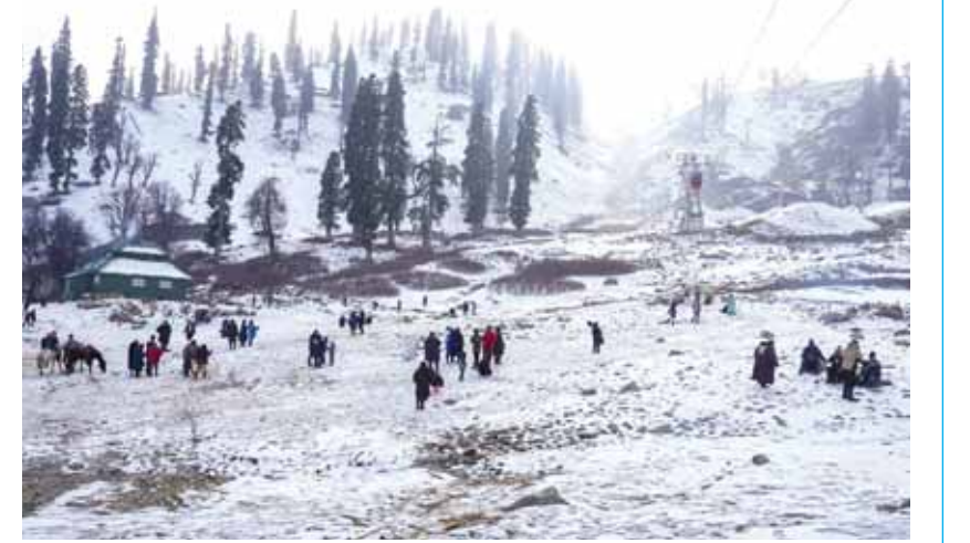
Tourists play in the snow at a ski resort after season's first snowfall at Kongdoori area of Gulmarg, in Baramulla district, Jammu and Kashmir, Tuesday