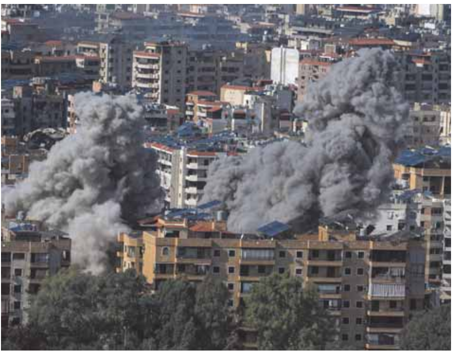
Smoke rises after an Israeli airstrike on Dahiyeh, in the southern suburb of Beirut, Lebanon on Tuesday.

lution. The UN climate chief also emphasised the importance of setting a robust global climate finance goal, framing it as a non-negotiable outcome for COP29.