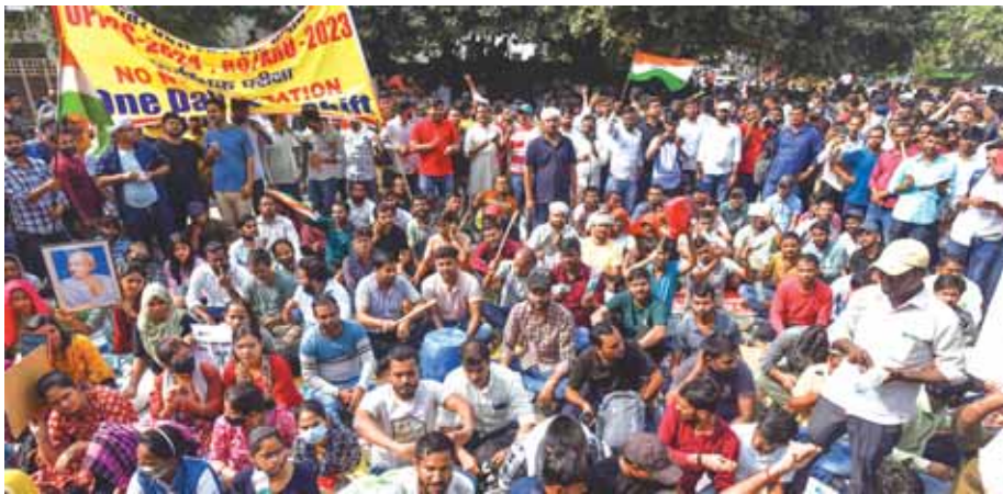
Civil services aspirants in Prayagraj on Tuesday staging a protest against Uttar Pradesh Public Service Commission's (UPPSC) decision to conduct the Review Officer and Assistant Review Officer (RO-ARO) and Provincial Civil Service (PCS) preliminary examinations on different dates.

The protest by aspirants against the UPPSC's decision to conduct the RO-ARO and PCS preliminary examinations on different dates entered its second day on Tuesday. The protesters laid siege to the Uttar Pradesh Public Service Commission (UPPSC) headquarters here on Monday, staging a sit-in even as a large posse of police personnel tried to disperse them. While the district magistrate and the police commissioner held a meeting late on Monday, it remained inconclusive. Most of the protesters spent the night under the open sky while those who had gone home returned on Tuesday morning to join the agitation at the commission's gate. The students were seen holding placards with slogans like, "We will not retreat, we will remain united until we get justice", and "One day, one exam". In a statement issued on Monday, the Akhil Bharatiya Vidyarthi Parishad (ABVP) said in light of the concerns raised by the aspirants over the conduct of the PCS and RO-ARO preliminary exams, the commission should take prompt steps to address the issues related to exam centres, normalisation of