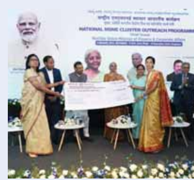
The Finance Minister launched five Nari Shakti branches of Union Bank of India for women entrepreneurs in a step to boost women's power. Union Finance Minister Nirmala Sitharaman virtually inaugurated five Nari Shakti branches of Union Bank of India

from Bengaluru. She urged the bank to develop technology-driven, cluster-based schemes specifically tailored to support women, aiming to empower female entrepreneurs and strengthen financial inclusion for women across the country. Furthermore, she encouraged women entrepreneurs to make use of these schemes and contribute to job creation.