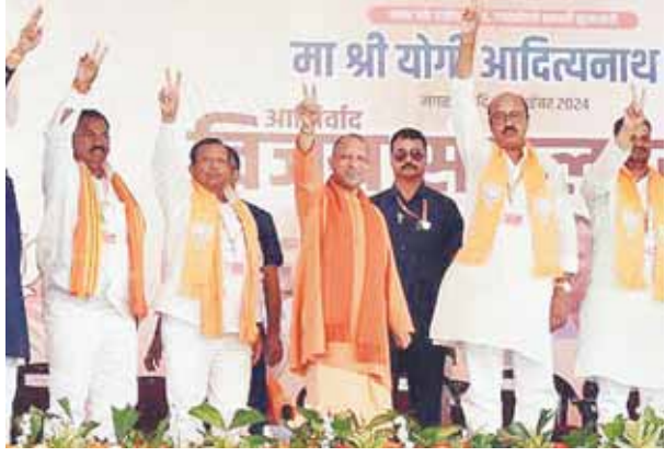
Uttar Pradesh Chief Minister Yogi Adityanath during an election rally in Achalpur, Maharashtra, on Tuesday

In a sharp reaction to Congress President Mallikarjun Kharge's recent remarks, Uttar Pradesh Chief Minister Yogi Adityanath on Tuesday said that as a Yogi, the nation always comes first for him, whereas for Kharge, Congress's appeasement politics take precedence. Addressing a rally in Achalpur, Maharashtra, on Tuesday, CM Yogi said: "For the past three days, Kharge ji has questioned my choice of words. Kharge ji, as a Yogi, I prioritise the nation above all else, just as my leader, Prime Minister Modi, has instructed me to put the country first in all matters. But for you, Congress's appeasement policy remains paramount, preventing you from acknowledging or understanding the truth." Yogi also referenced events after India's independence, reminding the audience of Kharge's family background in Varawatti, which was once under Hyderabad's Nizam. He recounted how, even before independence, the British had begun planning India's partition, emboldening the Muslim League in the process. He asserted that Congress leaders had bowed to the Muslim League at that time, which resulted in the massacre of