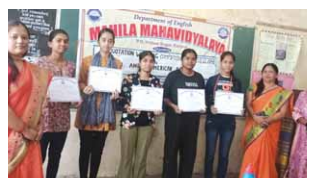
The winners of quotation writing contest at MMV Kidwai Nagar on Tuesday.