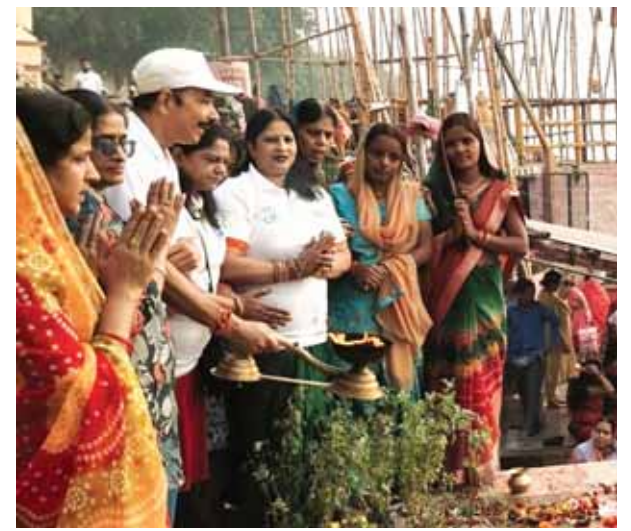
Devotees offering prayers on the occasion of Prabodhini Ekadashi at Panchganga Ghat in Varanasi on Tuesday.

Thousands of devotees took a holy dip in the sacred water of Ganga river at different ghats on the auspicious occasion of Prabodhini Ekadashi, also known as Devotthan Ekadashi, here on Tuesday. The festival was celebrated with traditional gaiety and religious fervour. It also marked the end of Chaturmas and beginning of Hindu wedding season. After taking bath in the Ganga, groups of women assembled at different ghats to celebrate the marriage of Lord Vishnu and Goddess Tulsi. A huge number of women observed a fast and offered prayers to Tulsi. Meanwhile, the activists of Namami Gange have geared up for cleaning Ganga ghats before Dev Deepawali festival. On Devotthan Ekadashi, they collected garbage thrown by devotees at Panchganga, Durga, Brahma and other ghats. They motivated people not to litter. They, along with women, performed Tulsi and Lord Shaligram's marriage and Aarti at Panchganga Ghat and prayed for freedom from diseases in the society. Aarti of Bindu Madhav was performed and 'Makhana Mishri' was offered.