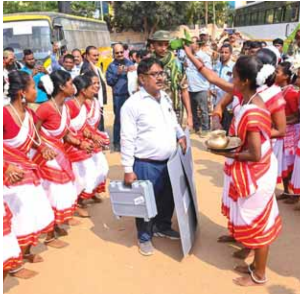
Women from the tribal community give a traditional welcome to a polling official before he leaves for his allotted polling station on the eve of the 1st phase of Jharkhand Assembly elections, in Ranchi, Tuesday

Bypolls are being held due to death of the representatives. Congress general secretary Priyanka Gandhi Vadra is making her electoral debut from Wayanad vacated by her sibling Rahul Gandhi who also won from the Rae Bareilly parliamentary constituency. Voting will be held in seven seats in Rajasthan, six in West Bengal, five in Assam, four seats in Bihar, three in Karnataka, two seats in Madhya Pradesh, and one seat each in Chhattisgarh, Gujarat, Kerala and Meghalaya. Votes will be counted on November 23.