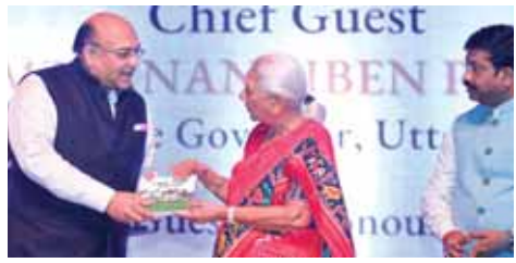
Governor Anandiben Patel being felicitated at the 140th founder's day ceremony of JK Group.