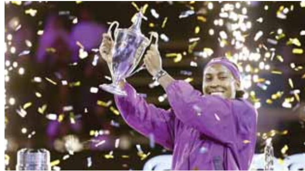
players - Aryna Sabalenka and Iga Swiatek - on her run to the final at the season-ending event in Riyadh. She felt vindicated after that and appeared to take a swipe at observers who wrote her off. "I just love to say I'm right. Specifically today, I got comments about how I was going to lose badly, so I was just like, 'OK, we'll see,'" Gauff explained. "It's honestly just

Coco Gauff won the WTA Finals for the first time by rallying to beat Olympic champion Zheng Qinwen 3-6, 6-4, 7-6 (2) in the final. The 20-year-old American came from 2-0 and 5-3 down in the final set and was two points from defeat at one stage. Yet she took the set to a tiebreaker and won the first six points. Zheng threatened a comeback but Gauff took the victory off her third match point with a forehand winner as she came into the net. She is the first American to win the Finals since Serena Williams in 2014, and received $4.8 million in prize money. She also is the youngest player to win it since Maria Sharapova in 2004, the year Gauff was born. Gauff beat the world's top two