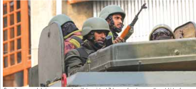
Security personnel during an encounter with terrorists at Zabarwan forest area on the outskirts of Srinagar, on Sunday