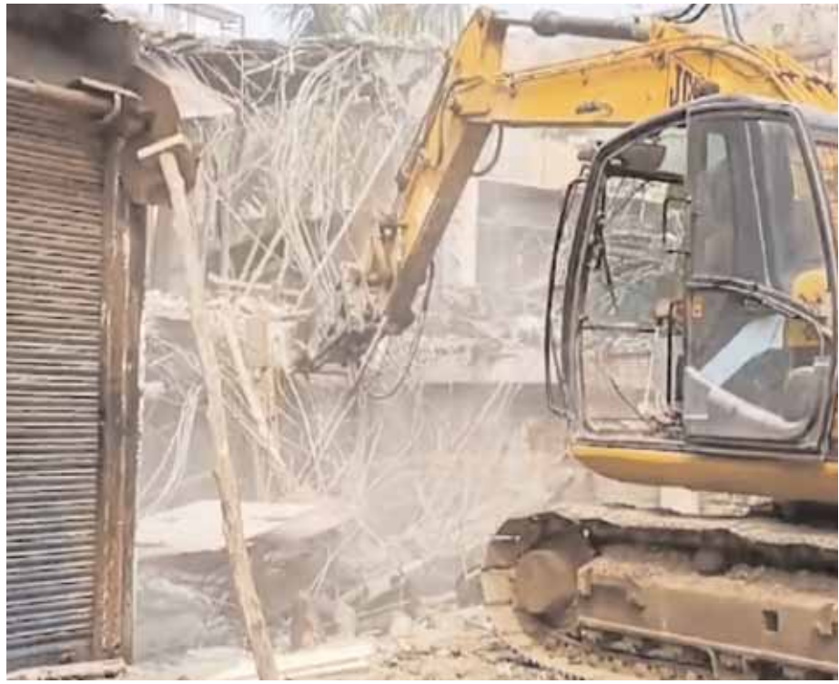
An excavator being used to demolish an illegal building at Kaiserbagh, in Lucknow, on Sunday