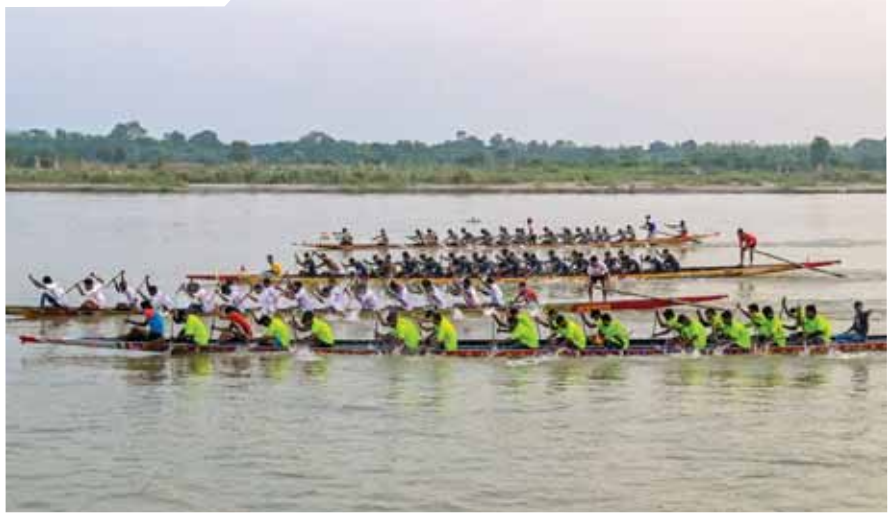
People take part in a boating competition, in Nadia