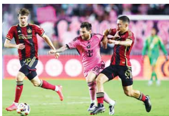
Red Bulls in the other East semifinal. No. 2 Columbus was already gone. No. 3 Cincinnati was ousted Saturday. And then came the biggest surprise of all - No. 1 Inter Miami's season is over.