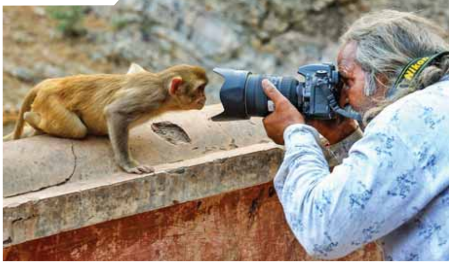
A photographer takes a photo of a macaque monkey at the Shrine Galtaji temple, in Jaipur