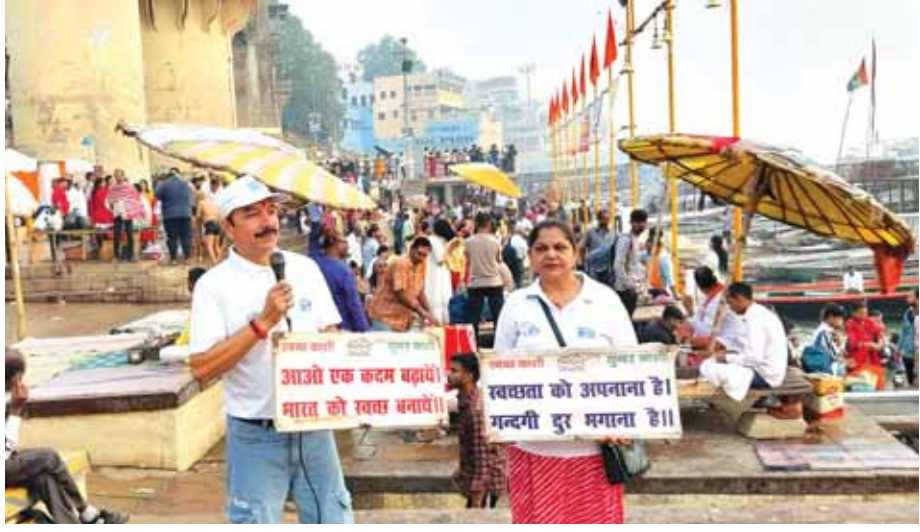
Namami Ganga activists on eve of Sandhya Arghya of Chhath Puja in Varanasi on Wednesday appealing to visitors to keep Ganga ghats clean