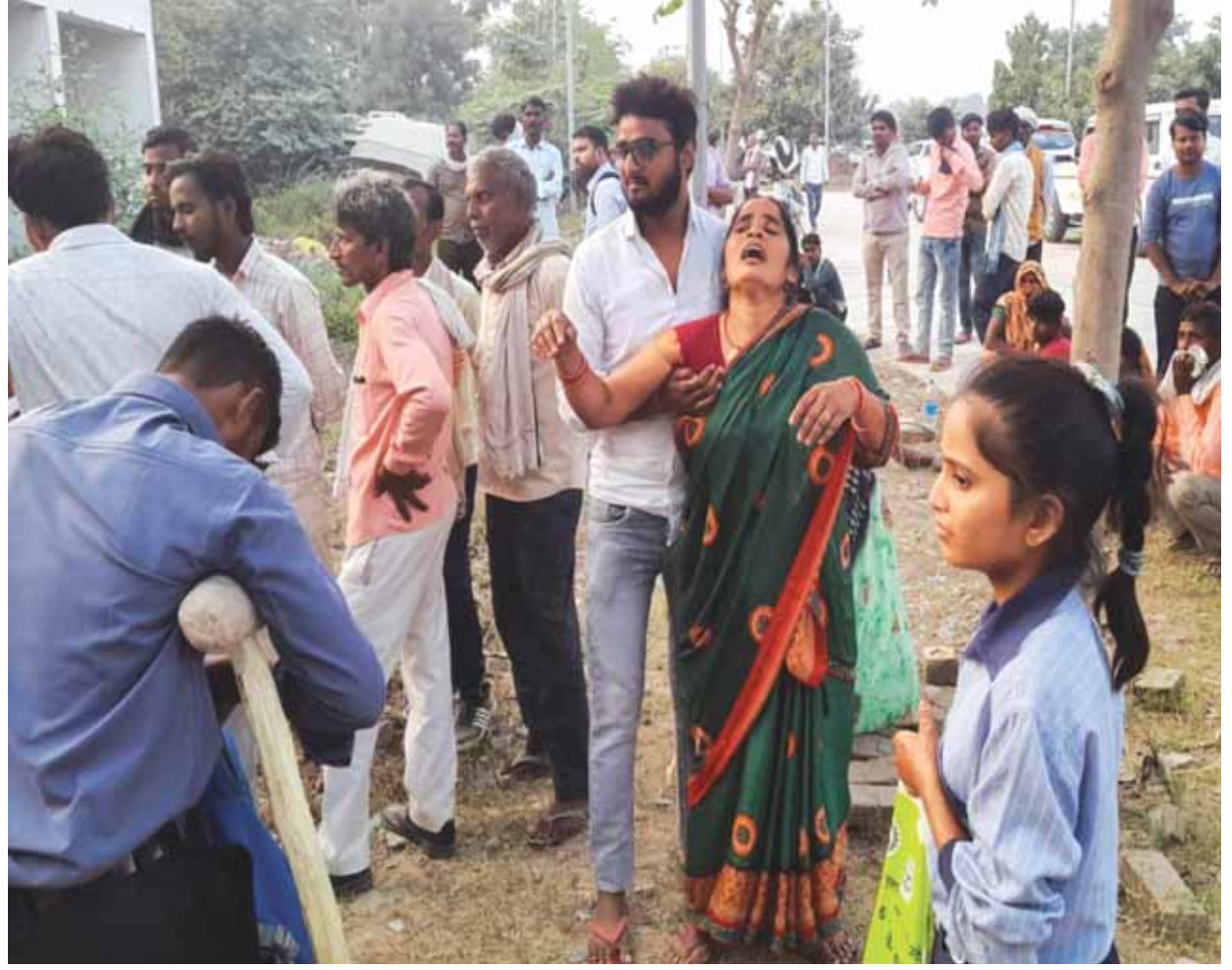
Relatives grief after a collision between a truck and an autorickshaw, leaving 10 people dead, in Hardoi, on Wednesday.