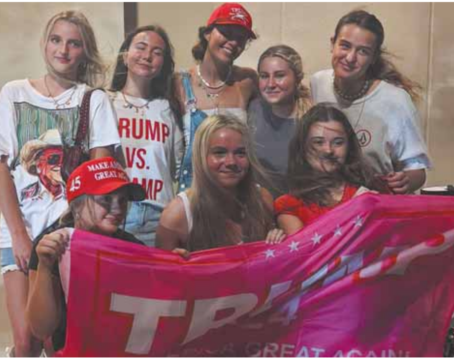
Supporters of Republican presidential nominee former President Donald Trump hold banners as they take part in Trump's Election Night Watch Party, at Palm Beach (Florida).

In Arizona, Shah from the Democratic Party was slightly ahead of his Republican Party's incumbent David Schweikert. He has 132,712 votes as against his rivals 128,606 votes when 63 per cent of the votes were counted.