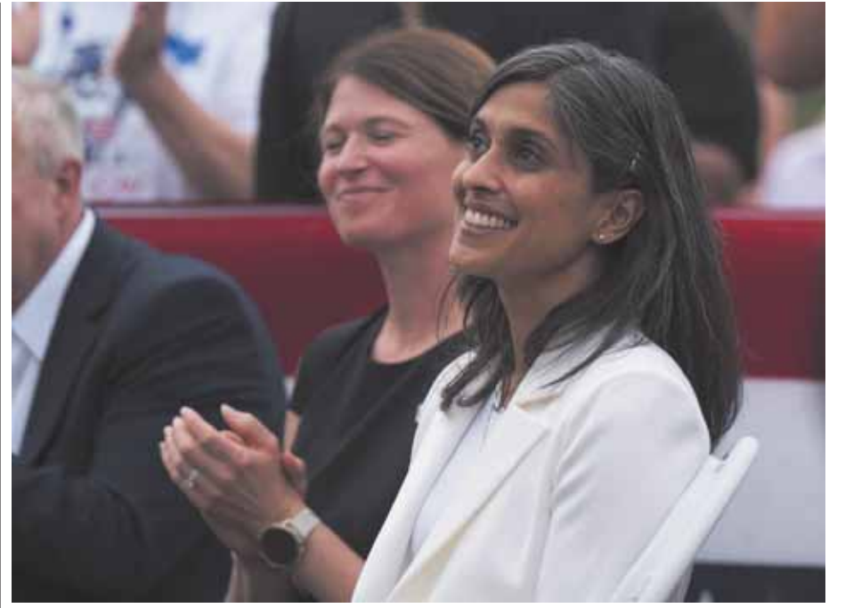
Usha Vance smiles as her husband Republican vice presidential nominee Sen. JD Vance, R-Ohio, speaks at a campaign rally on Friday in Selma, NC.

Residents of Israel's northern communities near Lebanon, roughly 60,000 people, have also been displaced for more than a year. Israel has also stepped up its offensive against Hamas' remaining fighters in Gaza, raising concerns about humanitarian conditions for civilians still there. The World Health Organisation has said it plans to finally resume its polio vaccination campaign on Saturday, but only in Gaza City as towns further north remain inaccessible as Israel tightens its siege. Israel's war in Gaza has killed more than 43,000 Palestinians since October 7, 2023, when Hamas militants killed roughly 1,200 people in Israel and took some 250 hostages back to Gaza. Health officials inside Hamas-run Gaza do not distinguish between civilians and combatants, but say more than half of the dead in the enclave are women and children.