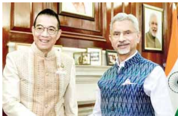
Sangiampongsa's first official visit to India was during July 11-13 for the second BIMSTEC Foreign Ministers' Retreat, hosted by the external affairs minister in New Delhi. On July 12, Jaishankar held a bilateral meeting with Sangiampongsa and hosted a lunch in his honour. During that meeting, the two ministers reviewed progress across various areas of partnership. The two ministers also exchanged views on issues of mutual interest and reiterated their commitment to closer cooperation in sub-regional, regional and multilateral fora. The Ministry of External Affairs had said. In accordance with the vision of the two prime ministers, the ministers reaffirmed the mutual desire for a stronger India-Thailand partnership, it had said. Thailand is a key partner for India in the ASEAN. India's 'Act East' policy, which is in its tenth year, finds convergence with Thailand's 'Act West' policy. Interactions between Jaishankar and the Thai foreign minister have contributed to further strengthening of bilateral ties, it had added.

External Affairs Minister S Jaishankar and his Thai counterpart Maris Sangiampongsa discussed bilateral ties, multilateral cooperation and regional developments during a meeting in Delhi on Saturday. In a social media post, Jaishankar said Sangiampongsa's visit for the Royal Kathina ceremony "exemplifies the longstanding historical and cultural relations" between the two countries. The Thai minister is scheduled to depart India on Sunday. Jaishankar also shared pictures of the meeting at the South Block. "Delighted to meet FM @AmbPoohMaris of Thailand today in Delhi. His visit for the Royal Kathina ceremony exemplifies the longstanding historical and cultural relations between our two countries. We discussed India-Thailand ties, multilateral cooperation and regional developments," he said. Royal Kathina is a traditional Buddhist ceremony.