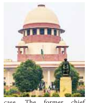
case. The former chief minister and 16 others were killed in a blast at the entrance of the civil secretariat in Chandigarh on August 31, 1995. A special court had sentenced Rajoana to death in July 2007. Rajoana has said that in March 2012, a mercy petition under Article 72 of the Constitution was moved by the Shiromani Gurdwara Parbandhak Committee (SGPC) on his behalf. On May 3 last year, the apex court had refused to commute his death sentence and said the competent authority could deal with his mercy plea. In his fresh plea filed in the top court, Rajoana has said he

The Supreme Court is scheduled to hear on November 4 a plea by Balwant Singh Rajoana, convicted in the 1995 assassination case of the then Punjab Chief Minister Beant Singh, seeking commutation of his death sentence to life term due to an "inordinate delay" in deciding his mercy petition. A special bench of Justices B R Gavai, P K Mishra and K V Viswanathan will hear the plea of the former Punjab Police constable. On September 25, the top court had sought responses from the Centre, the Punjab Government and the administration of the Union Territory of Chandigarh on Rajoana's plea. In his plea, Rajoana has sought directions to the Centre and the Punjab government to commute his death sentence "due to inordinate delay" in its execution and in deciding the "mercy petition filed on his behalf". Rajoana was convicted in Beant Singh's assassination