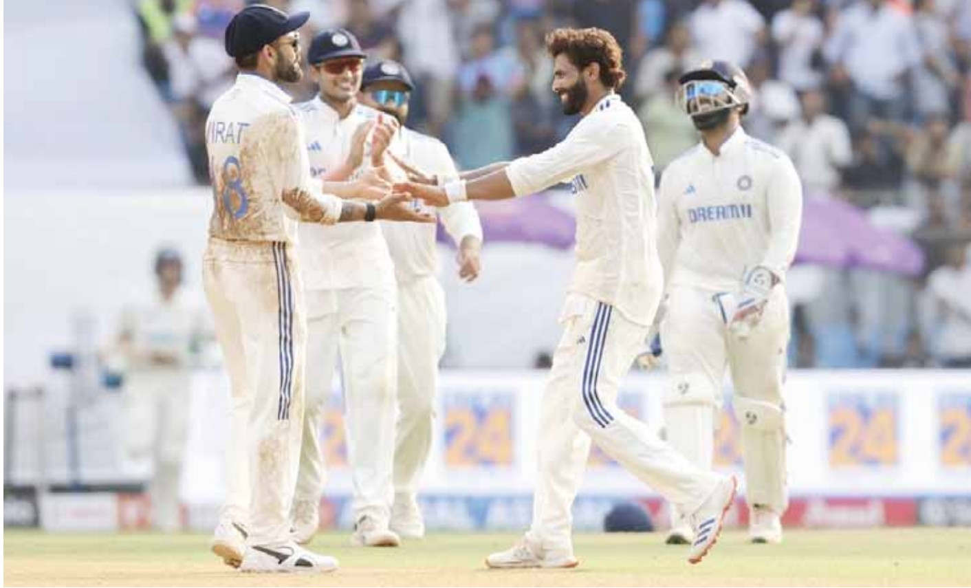
Tom Latham's (1) off and middle stumps in the first over. Earlier, India's progress suffered a severe blow with the exit of Pant towards the end of the morning session, as its effects were felt acutely when play resumed post

Having made a subdued impact so far, Ashwin's delight on getting Rachin Ravindra (4) stumped was evident as he beat the charge of the batter with bounce and turn. With Glenn Phillips (26) using the long handle to a good effect, Ashwin cleaned up the New Zealand batter for another crucial breakthrough. Young, who batted as solid as he did in the first innings, was Ashwin's third victim giving the bowler catching practice after being outfoxed on a carrom ball. The 37-year-old Ashwin made impact beyond his bowling when he took an outstanding catch to end a stubborn 50-run association between Young and Daryl Mitchell (21), who, for a passage of play, threatened to take the game away. Young and Mitchell had steadied the ship after New Zealand's top-order was blown away, but the latter's charge against Jadeja proved costly as he did not get the distance in his stroke. From mid-off, Ashwin covered 19 metres running sideways to his left and put in a fabulous dive to complete the dismissal, post which New Zealand crumbled further. Tom Blundell (4) chopped one onto his stumps off Jadeja while Ashwin cleaned up Phillips, who had switched to aggressive batting knowing New Zealand desperately needed more runs. At the start of Kiwis' reply, Akash provided a rare sight of a pacer disturbing a batter's furniture on turning track when he dismantled