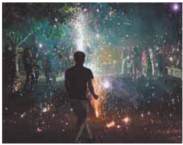
PNS ■ LUCKNOW

The IITR report on Ambient Air Quality following Diwali 2024 reveals alarming increases in particulate matter levels. On Diwali night, PM2.5 levels surged to 324 µg/m 3 , representing a staggering increase of 184% from 114 µg/m 3 recorded on the pre-Diwali night.