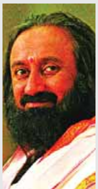
Sri Sri Ravi Shankar Spiritual Guru

H APPINESS is the one thing that everybody is seeking. People do find happiness but it is momentary; for couple of hours or days. True happiness is when you find inner stability and comfort. You know you are connected to something unimaginably bigger and that there is an unshakable power within you. Here are a few pointers to ensure that happiness simply wells up in you. HEALTH: In India, "swastha" refers to one who is established in oneself. A healthy person has a smile on the face, love in the heart and strength and vitality in the body. Seeing life with the eyes of wisdom makes negative emotions go away and you start smiling from the core of your being. ATTACHMENTS: These cause feverishness that take away peace of mind. You are in pieces and fall prey to misery. Your first step is directing your attachment to the Knowledge and the Divine. Your