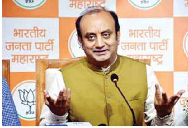
seen leaders such as PV Narasimha Rao and Pranab Mukherjee, who deftly handled the economy under difficult circumstances, and is now seeing the party under the grip of urban