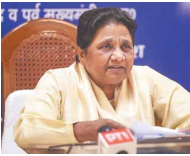
Bahujan Samaj Party president Mayawati addressing a press conference in Lucknow on Saturday

Bahujan Samaj Party (BSP) chief Mayawati on Saturday accused the BJP and Samajwadi Party (SP) of being "hand in glove" in the run-up to the November 13 bypolls to nine Assembly constituencies in Uttar Pradesh in which the BSP is going solo on all seats. Addressing a press conference here, the former UP chief minister also slammed the two parties for their "misleading" slogans — BJP's 'Batenge toh Katenge' (divided we fall) and SP's 'Judenge toh Jeetenge' (united we win) — and said these are designed to divert people's attention from the real issues.