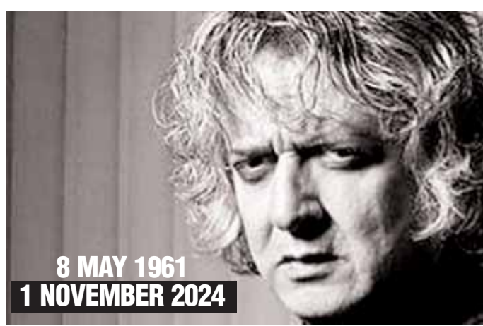
8 MAY 1961 1 NOVEMBER 2024

Indian fashion with his bold yet refined approach. Renowned for his exquisite craftsmanship and meticulous attention to detail, he blended traditional Indian aesthetics with modern sensibilities. From designing costumes for the popular Indian game show 'Kaun Banega Crorepati' to creating breathtaking couture, Bal infused a sense of cultural poetry into each piece. His creations were more than garments, they were expressions of identity and creativity that made every wearer feel special. His passing marks a profound loss not only for the fashion world but also for countless admirers who were