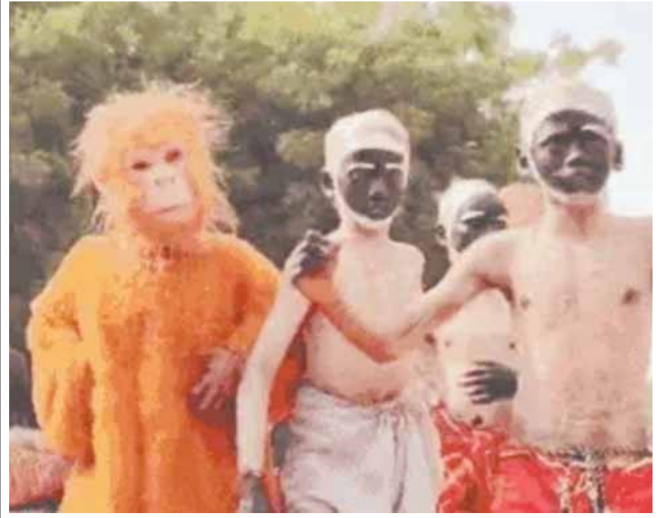
Govardhan Puja procession being taken out in Varanasi on Saturday