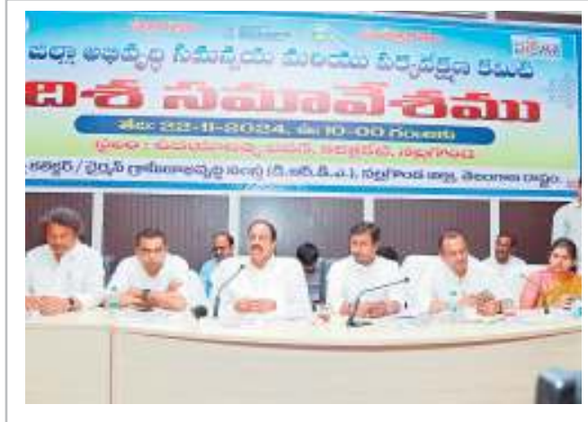
Agriculture Minister Tummala Nageswara Rao at a review meeting in Nalgonda on Friday

Ministers for Roads and Buildings Komatireddy Venkata Reddy stated that the District Development Coordination and Monitoring Committees have been formed for rural development.