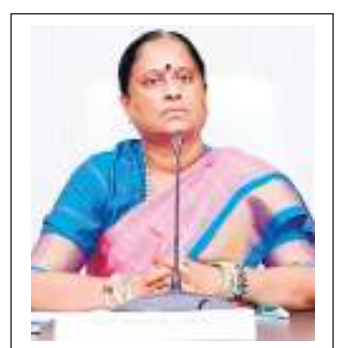
four villages in the Amrabad Tiger Reserve would be shifted to Punarao

in future tourism plans. Forest officials informed her that