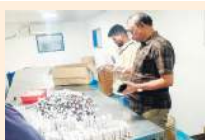
The Task Force team inspecting the pharmaceutical industries in IDA Mallapur on Friday