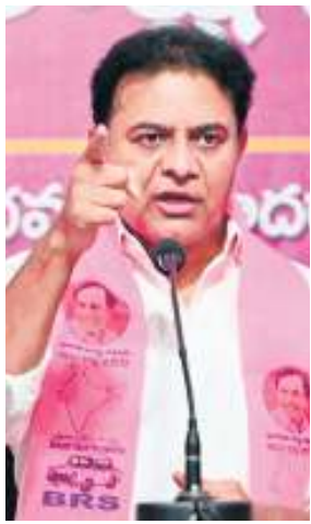
12,400 crore with the Adani Group, including investments in green energy, data centres and cement plants.

He pointed out that the Congress Government of Telangana had entered into business agreements worth Rs