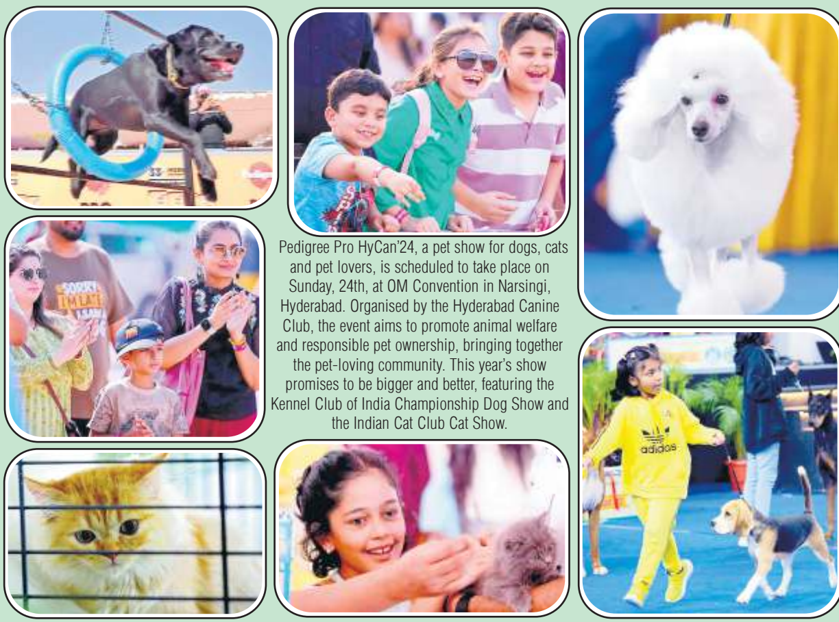
Pedigree Pro HyCan'24, a pet show for dogs, cats and pet lovers, is scheduled to take place on Sunday, 24th, at OM Convention in Narsingi, Hyderabad. Organised by the Hyderabad Canine Club, the event aims to promote animal welfare and responsible pet ownership, bringing together the pet-loving community. This year's show promises to be bigger and better, featuring the Kennel Club of India Championship Dog Show and the Indian Cat Club Cat Show.