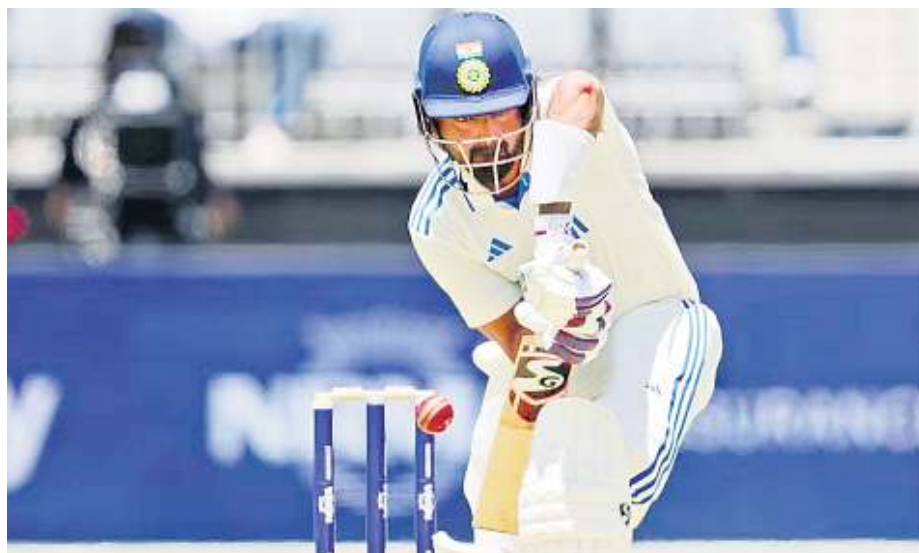
While Starc gave the first breakthrough, his pace-bowling colleague Josh Hazlewood proved to be more successful on the day, returning with excellent figures of 4/29 in 13 overs before the peerless Jasprit Bumrah (4/17 in 10 overs) yet

ball. "I think there was a fair bit of good bowling today. Obviously there was enough in the wicket and it probably felt like it was a hardball wicket," Starc said. "When the ball started to get a little bit softer towards the back end of that Indian innings, it probably didn't do as much. (There was) still enough there, but it didn't do as much as the brand new hardball. "So I guess that's something for teams to take in the second innings. "If you can get through the testing period, it does get slightly easier. That being said, the outfield is quite slow, so that probably made runs a bit hard to come by. That's probably the slowest outfield we've seen over in the west for a long time."