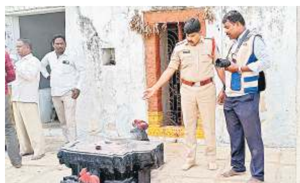
Police officer examining the temple where a Shivalingam was allegedly desecrated in Shadnagar on Friday