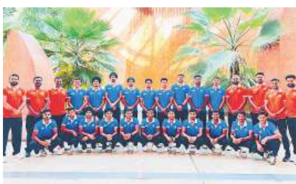
importance of this tournament and the opportunity to showcase our skills on the big stage. Our focus is on giving our best from the very first match and