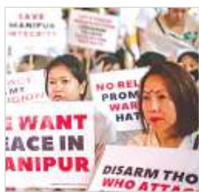
the Kuki community, culminating in protests and clashes. Understanding the ST Status Debate:

The spark for the current violence was a Manipur High Court directive urging the state government to consider granting the Meitei community Scheduled Tribe (ST) status. This decision was met with strong opposition from