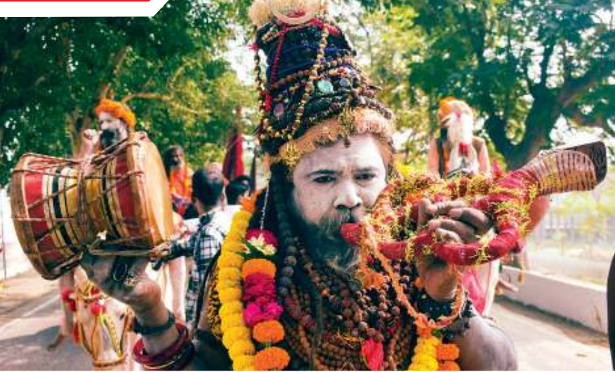
A monk of Panch Dashnam Avahan Akhara during 'Nagar Pravesh' procession, in Prayagraj