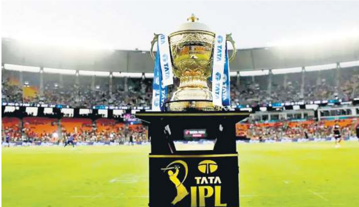
has been scheduled for May 31. The 2027 edition will once again start on March 14 with the final on May 30. All three finals will be held on Sundays. The BCCI had plans to increase the number of