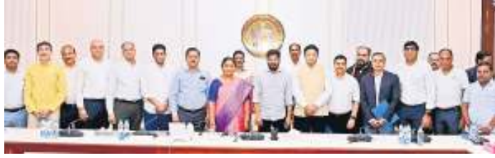
CM A Revanth Reddy and IT & Industries Minister D Sridhar Babu with Green Pharma Companies' representatives at the Secretariat on Friday