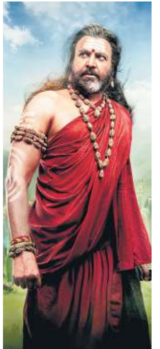
stars Prabhas, Akshay Kumar, Mohan Lal, Sharath Kumar and Kajal Aggarwal and is set for a pan-India release.

A legendary actor Mohan Babu celebrates an extraordinary 50-year career in the film industry, the team behind his upcoming project Kannappa has unveiled a striking first-look poster of his character, Mahadeva Shastri, marking the milestone of his Golden Jubilee year. In the intense and captivating poster, Mohan Babu stands in a powerful pose, dressed in traditional Brahmin attire, with Rudraksha malas adorning his neck and wrists. Holding a weapon, his solemn gaze reflects a deep sense of strength and reverence. The background features a congregation of devoted Lord Shiva followers, adding a spiritual essence to the visual. The quote "Shaivism - When arrogance intertwines with faith, it births a force like no other: Mahadeva Shastri" offers a glimpse into the character's compelling role in the film. Kannappa holds a special place for the Manchu family, as it unites three generations of stars, Mohan Babu, Vishnu Manchu and Avram Manchu. Alongside them, the film also