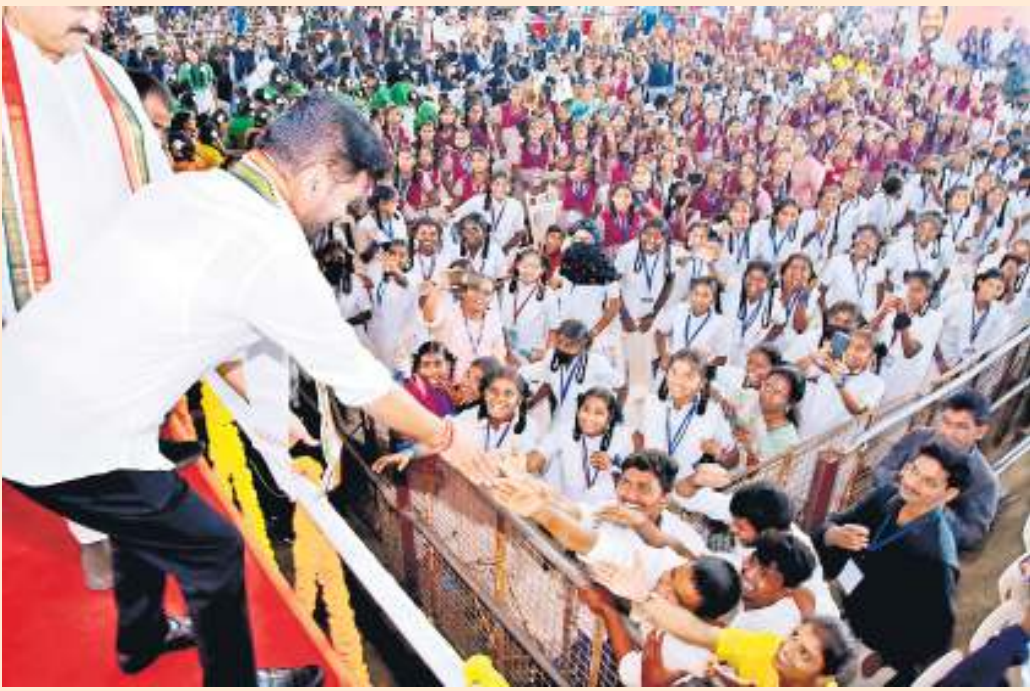
Chief Minister A Revanth Reddy greeting children at a public meeting held on the occasion of Children's Day celebrations at LB Stadium in Hyderabad on Thursday

'Caste survey a mega health check up for society'