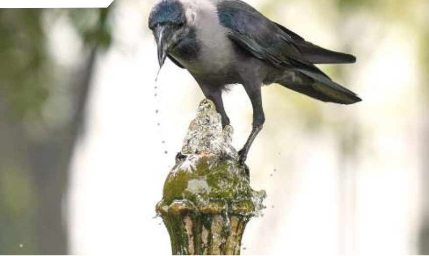
A crow quenches its thirst by drinking water from a fountain, in New Delhi