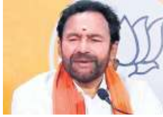
Governor cannot take a decision without consulting legal experts and that the Governor will decide after legal experts give their opinion. Continued on Page 2

The delay in the Governor deciding on the request by the TG government to probe BRS Working President KT Rama Rao doesn't mean that the BJP and the BRS are one, Telangana BJP President G. Kishan Reddy said.