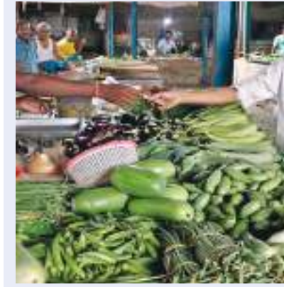
The inflation rate based on the consumer price index increased to 6.21 per cent in October, up from 5.49 per cent in September, according to the data released by

the Ministry of Statistics and Programme Implementation. The increase was driven by the prices of food products, particularly the vegetables, especially tomatoes, onions and potatoes (TOP), rising above 42 per cent.