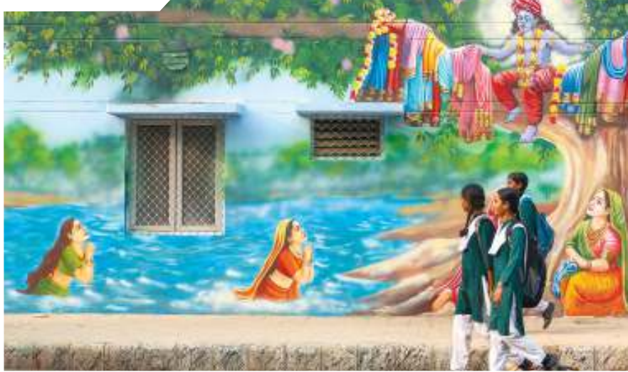
Students pass by a wall painting depicting a scene from 'Krishna Leela', in Prayagraj