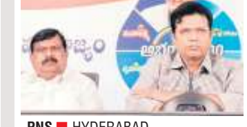
PNS ■ HYDERABAD