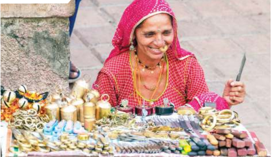
A Rajasthani nomad vendor waits for customers, in Pushkar