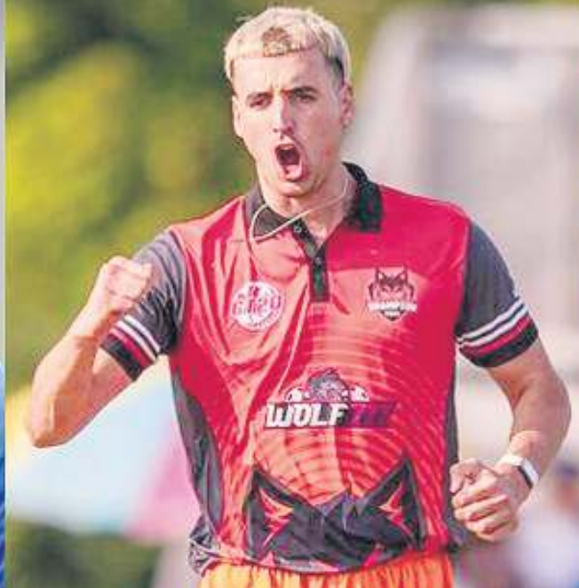
focus on his fitness, has opted out for the 2025 edition as well. The 42-year-Anderson, who retired from Test cricket earlier this year, has registered for the IPL for the first time. The veteran pacer last played a T20 10 years ago in 2014. He has never competed in a global franchise T20 league. He has a base price of Rs 1.25 crore. Netravalkar, who rose to