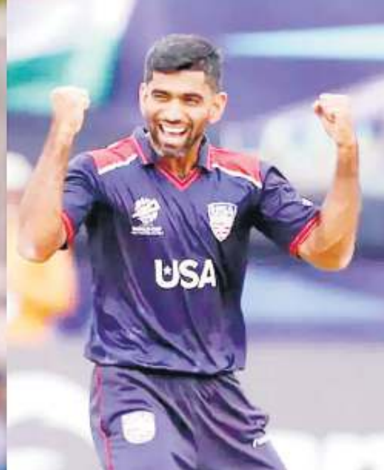
prominence due to his stupendous performance for USA during the T20 World Cup earlier this year, has also lined up to go under the hammer in Jeddah. The software engineer in Oracle has a base price of Rs 30 lakh. Ace Australian off-spinner Nathan Lyon, who has gone unsold in previous auctions, has also entered the fray with the a base price of Rs

of the tournament with 11 wickets to his name from six innings at an average of 10.63 and an economy of 6.88.