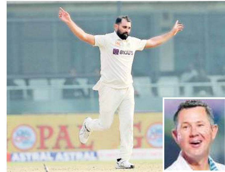
run-scorers over the five Tests. "Leading run scorer, I'm going to go Steve Smith or Rishabh Pant," Ponting said.

Mohammed Siraj, Akash Deep, Prasidh Krishna and the uncapped Harshit Rana. Ponting said, "Shami just leaves such a big hole in that bowling group. Back then (in August), there was still some conjecture whether Shami would be fit or not." "I think taking 20 wickets in a Test match for India is going to be the biggest challenge. I think they'll bat well enough out here with the current group of batters that they've got." While hailing Australia as a more settled unit, Ponting backed India to not be absolute pushovers when the series gets underway from November 22 in Perth. "I think India will win a Test match somewhere through the five Test matches," Ponting predicted. "But I still think now, Australia probably look a bit more settled, a bit more experienced and we know that they're a very hard team to beat at home. So I'll stick with the 3-1." Ponting feels one among the veteran Steve Smith or the flamboyant Rishabh Pant would be the highest