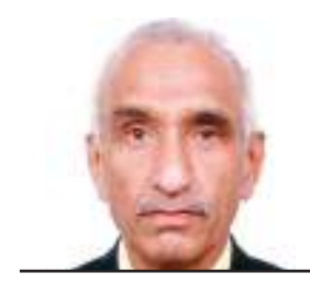
B K SINGH

With the upcoming CoP 29 summit in Azerbaijan, world leaders face mounting pressure to deliver on pledges for climate finance and reduced fossil fuel reliance