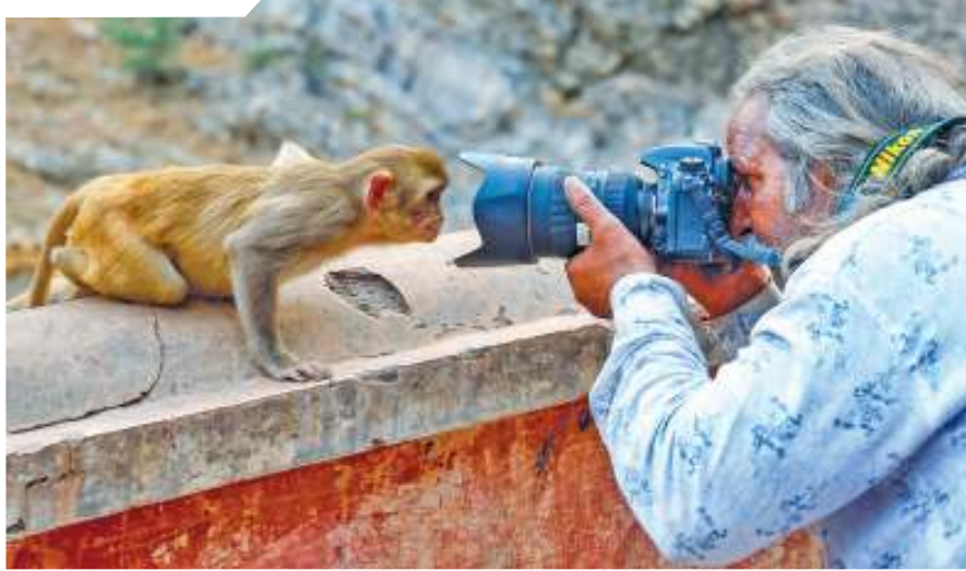
A photographer takes a photo of a macaque monkey at the Shrine Galtaji temple, in Jaipur