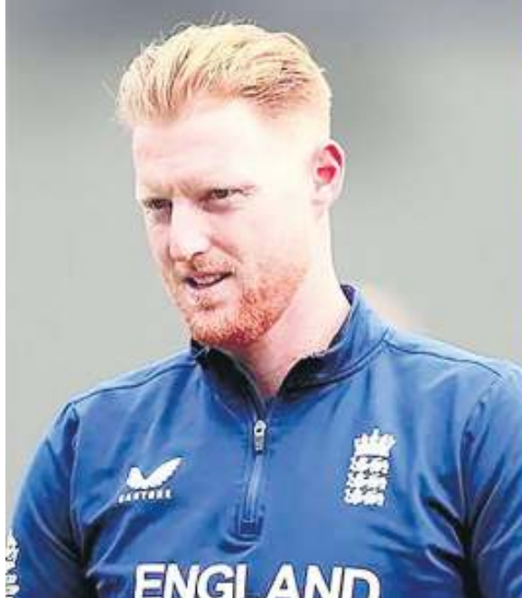
Patel, Prasidh Krishna, T Natarajan, Washington Sundar and Umesh Yadav. India batters Sarfaraz Khan and Prithvi Shaw, who were unsold in the last IPL auction, have registered themselves at the base price of Rs 75 lakh each. Stokes, who had decided to give the last season of the IPL a miss in order to manage his workload and

This list also includes Shardul Thakur, Mohammed Siraj, Devdutt Padikkal, Krunal Pandya, Harshal