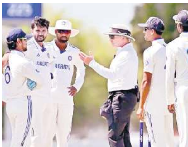
Australia to clarify what transpired on the final day of the match at Mackay. Warner, whose years-long leadership ban has just been lifted by CA, has said the board "squashed" the matter "as quickly as possible" since the Indian senior men's team is bound for a five-Test series Down Under.