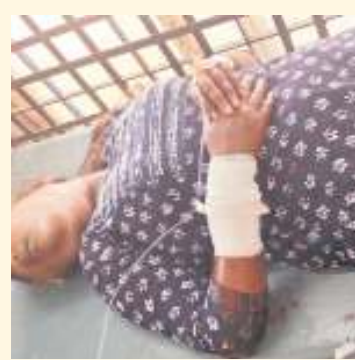
College girl who suffered injury at the hands of youth

According to a police official, the victim knew the accused through a