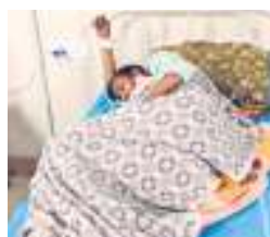
A victim of suspected food poisoning undergoing treatment in hospital