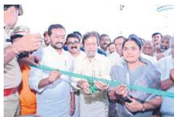
Health Minister Damodar Raja Narasimha inaugurating a dialysis centre in Medak on Monday

During the inauguration, the Minister mentioned that over 100 dialysis patients are receiving treatment at the Medak district hospital. Of these, 22 patients are from the Narsapur constituency. The distribution of patients from Narsapur constituency includes 7 from Narsapur, 5 from Kaudipalli, and 10 from Kulcharam mandal. He noted that 14 patients are being