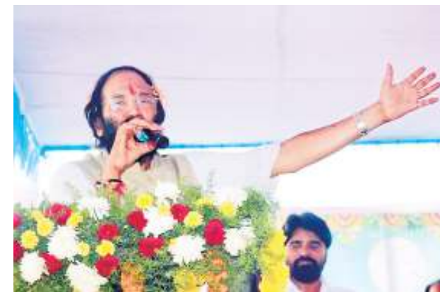
Irrigation Minister N Uttam Kumar Reddy speaking at a meeting in Suryapet district on Sunday