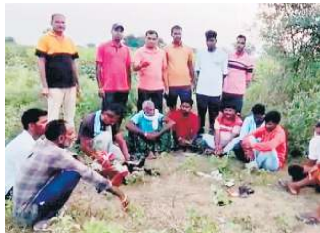
Police rounding up group of people engaging in cockfights and betting at Supak village in Macherial district on Sunday