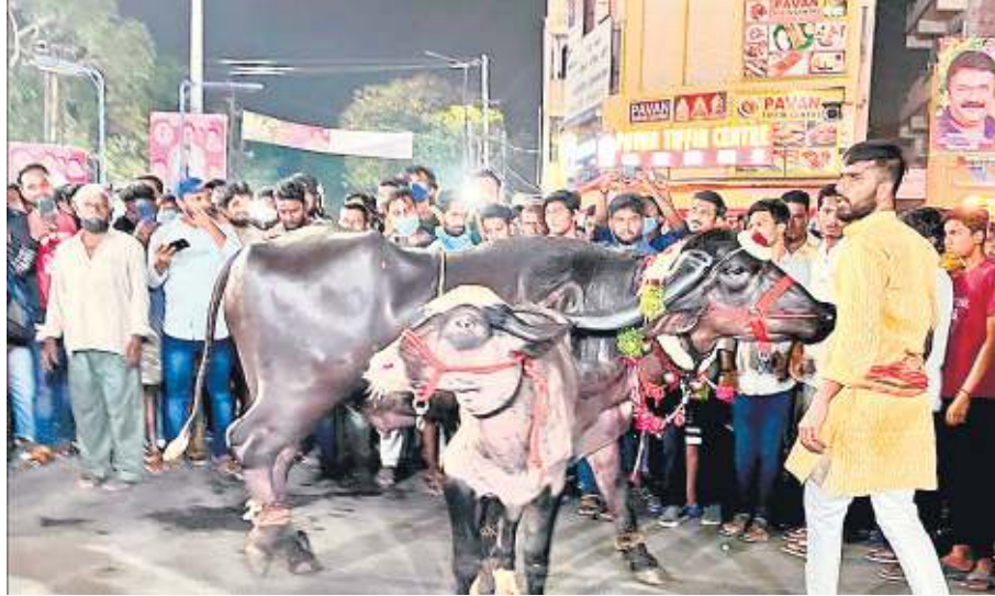
A bull carnival in progress, celebrated annually by the Yadav community of Hyderabad as a part of Diwali on Sunday night

hit the footpath, boundary wall and its grill. It was found that there was a broken number plate inside the car. The accused who has escaped was traced and arrested after verifying the available evidence and sent him for medical examination for alcohol and drug test and other procedure as per the legal provisions. The Banjara Hills Police also confirmed that based on the preliminary investigation, the collision had occurred due to reckless driving resulting in losing control over the vehicle.