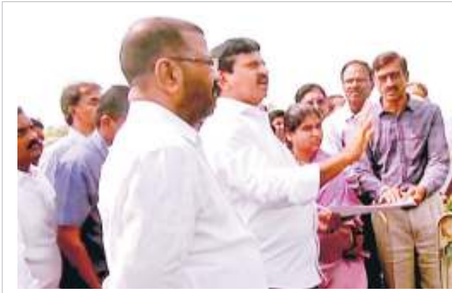
Revenue Minister Ponguleti Srinivas Reddy inspecting Bhadrakali bund in Warangal on Sunday

The government has allocated Rs 158 crore for flood prevention measures at Bhadrakali Lake and Bondivagu. The minister reviewed the map of development works related to flood prevention in Bondivagu Nala, Bhadrakali Nala, and the Bhadrakali catchment area, and provided necessary guidance to the officials concerned for the effective execution of these projects.