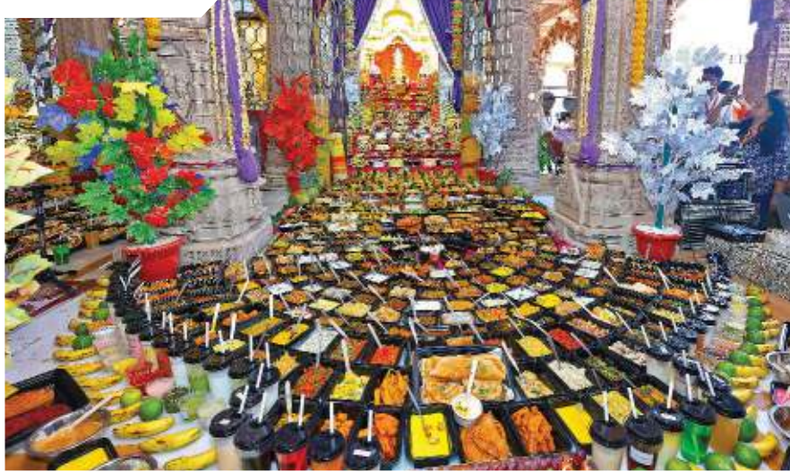
About 1001 food items offered at the Akshardham Temple during the 'Annakut' festival, in Jaipur