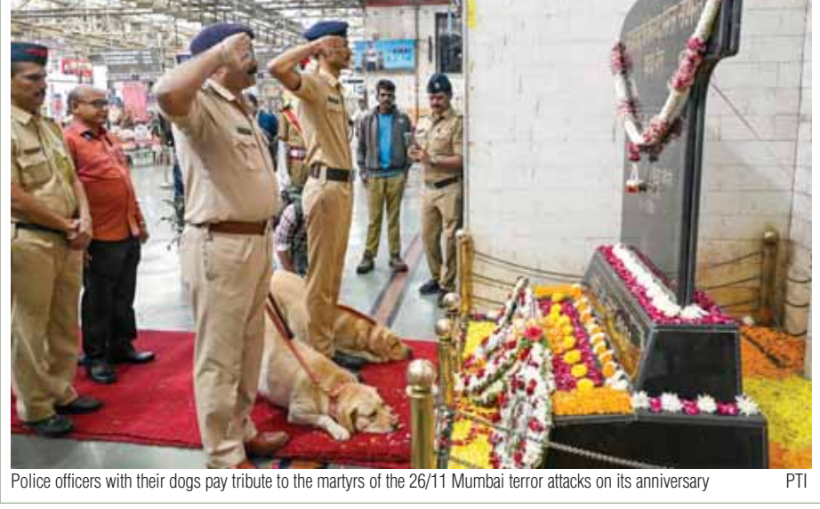
Police officers with their dogs pay tribute to the martyrs of the 26/11 Mumbai terror attacks on its anniversary