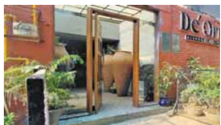
Pieces of broken window glass lie on the floor after an explosion outside a club in Chandigarh

political arena? Your area of work is very different," the Bench retorted. After Paul revealed he had been to over 150 countries, the Bench asked him whether each of the nations had ballot paper voting or used electronic voting. The petitioner said foreign countries had adopted ballot paper voting and India should follow suit. "Why you don't want to be different from the rest of the world?" asked the Bench. There was corruption and in June 2024, the Election Commission announced they had seized Rs 9,000 crore, Paul responded. "But how does that make your relief which you are claiming here relevant?" asked the Bench, adding "if you shift back to physical ballot, will there be no corruption?". Paul claimed CEO and co-founder of Tesla, Elon Musk, stated that EVMs could be tampered with and added TDP chief N Chandrababu Naidu, the current chief minister of Andhra Pradesh, and former state chief minister YS Jagan Mohan Reddy had claimed EVMs could be tampered with. Continued on page 2