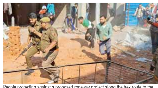
People protesting against a proposed ropeway project along the trek route to the Vaishno Devi shrine clash with police personnel, at Katra in Reasi district.