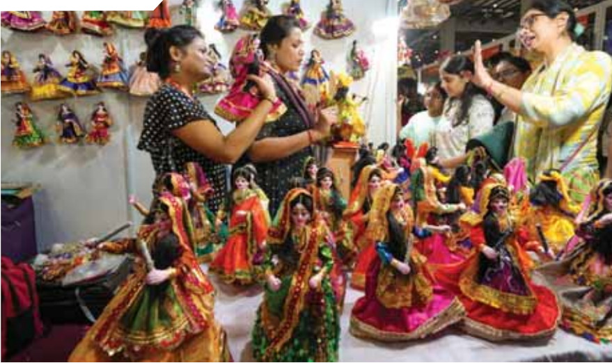
Visitors at a stall at the International Trade Fair at Pragati Maidan, in New Delhi