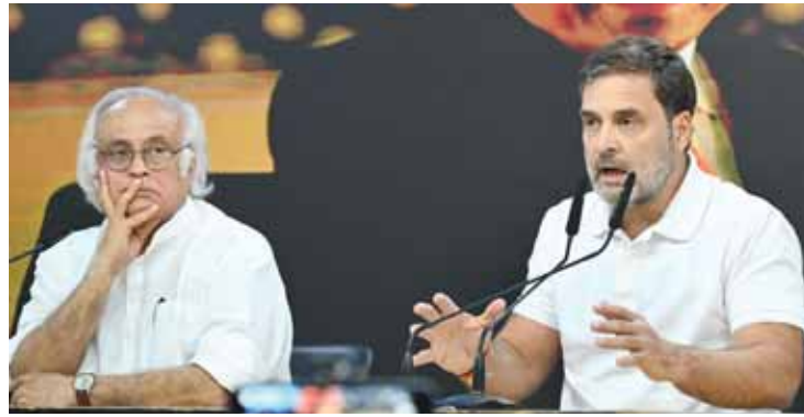
Leader of Opposition in Lok Sabha Rahul Gandhi and Congress leader Jairam Ramesh address a press conference in New Delhi