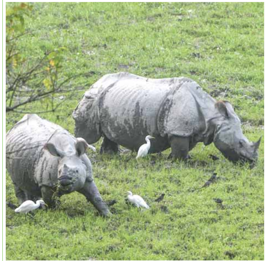
Two Indian Rhinoceroses, also known as Greater One-Horned Rhinoceros, seen with flocks of Egrets and Common Mynas at the Kaziranga National Park, in Golaghat district