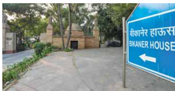
Bikaner House, in New Delhi, Thursday, Nov. 21, 2024. A Delhi court has directed the attachment of Bikaner House, which is owned by Nokha municipal council in Rajasthan, after it failed to pay arbitral award of ₹50.31 lakh to a company

A Patiala House Court in Delhi has directed the attachment of the Iconic Bikaner House after the Nokha municipal council in Rajasthan which owns the historic building failed to pay an arbitral award of Rs 50.31 lakh to Enviro Infra Engineers Private Limited. The court passed the order on an application seeking enforcement of the arbitral award passed by the arbitral tribunal in January 2020. Bikaner House was designed as the residence of the Rajput rulers of the princely state of Bikaner.