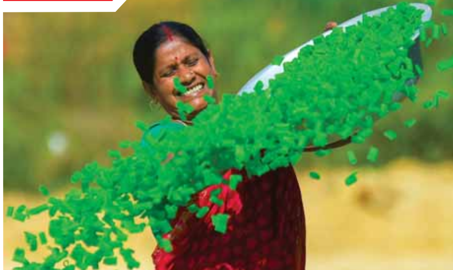
A worker spreads 'Finger Fryums,' for drying under the sun at a factory on the outskirts of Agartala