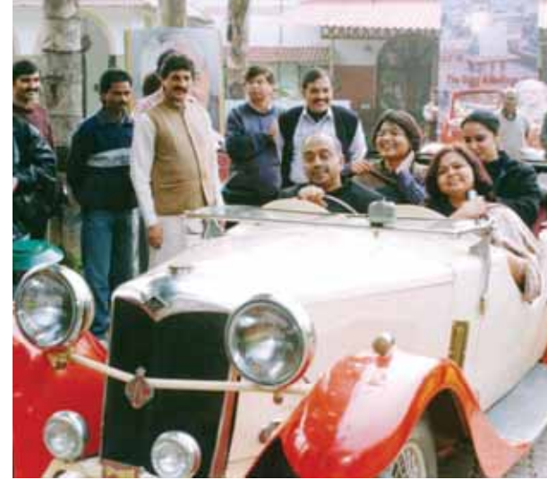
Former Union Minister Vijay Goel with one his coveted vintage cars which he used to take out as part of the exhibition he started to mark the birthday of former Prime Minister Atal Bihari Vajpayee

Amidst the crackdown on vehicles falling under scrap years, vintage car aficionados heaved a sigh of relief as Delhi Lieutenant Governor Vinai Kumar Saxena came to their rescue, directing the Delhi Transport Department that there should be no coercive action on the registered vintage vehicles. However, this has come with a rider that they are not to be driven on roads or used for commercial purposes. There are around 10,000 registered vintage cars in India. LG Saxena has directed that bona fide vintage vehicles will no longer face coercive action by the Transport Department and the Municipal Corporation of Delhi (MCD). According to Raj Niwas, the LG has asked the Commissioner Transport and Commissioner (MCD) to ensure that their enforcement wings desist from coercive action in case of such bona fide vehicles. Acting on a representation made by the Heritage Motoring Club of India, highlighting that their vehicles are being impounded by the authorities and requesting for clarificatory orders in this regard, the LG had asked his Secretariat to issue appropriate directions. The transport department's data shows there are 60,14,493 such vehicles in