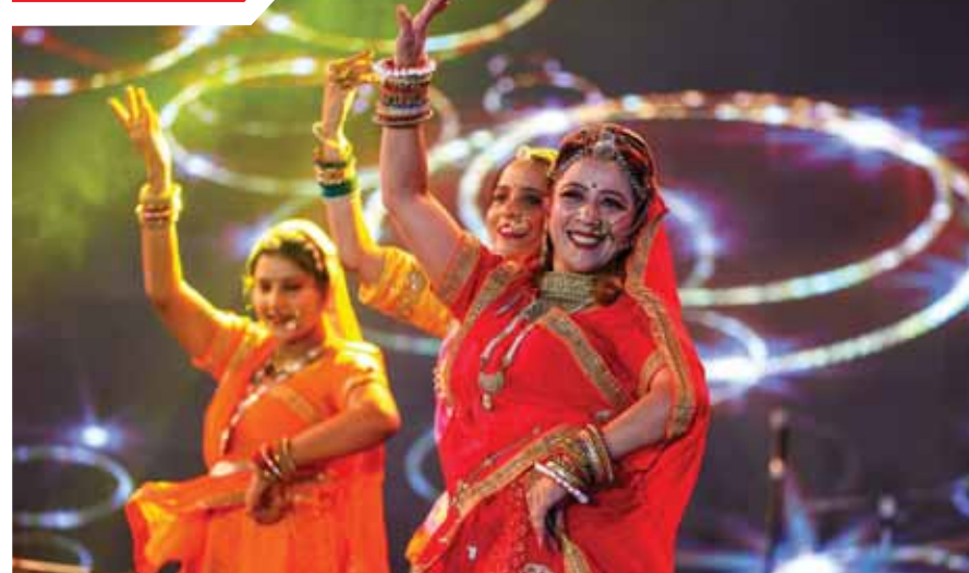
Folk dancers perform during the celebration of the 297th foundation day of 'Pink City', Jaipur