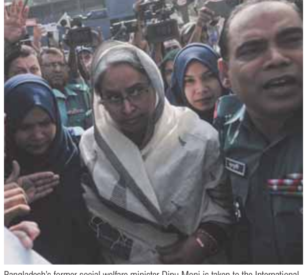
Bangladesh's former social welfare minister Dipu Moni is taken to the International Crimes Tribunal in Dhaka, Bangladesh on Monday.

A special tribunal in Bangladesh on Monday told investigators they have one month to complete their work on ousted former Prime Minister Sheikh Hasina and her close aides who face charges of crimes against humanity after hundreds of people were killed in a mass uprising this summer.