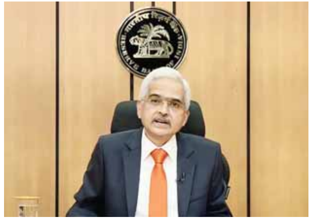
and financial penalties," he said in a keynote address at the Conference of Directors of Private Sector Banks here. Das further said that the Indian banking sector is

PTI ■ MUMBAI RBI Governor Shaktikanta Das on Monday asked bank boards to strengthen internal governance framework to curb unethical practices, such as mis-selling of products or opening of accounts without proper KYC verification. Das also said that the incentives for bank staff should be carefully structured so as not to encourage them to indulge in unethical practices. "While such practices may yield short-term gains, they ultimately expose the bank to significant long-term risks, including reputational damage, supervisory scrutiny