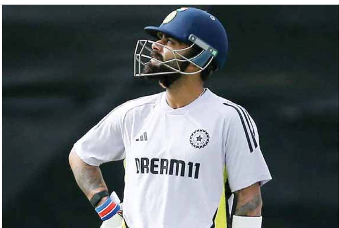
Gavaskar believes these stats will provide a significant confidence boost as Kohli prepares for the upcoming five-match series, starting with the first Test in Perth on Friday. "He has consistently performed in Adelaide, a ground he knows well. Before Adelaide, it's Perth, where Kohli played one of his finest Test centuries in the 2018-19 series — a terrific hundred."

Virat Kohli will be "very, very hungry" for runs following his lean patch against New Zealand, according to former Indian captain Sunil Gavaskar, who feels the veteran batter's strong track record Down Under will boost his confidence heading into the upcoming Test series against Australia. Kohli has faced a challenging patch in all formats over the past few months. In his last 60 Test innings, he has managed just two centuries and 11 half-centuries. This year, he has averaged only 22.72 across six Tests, and in the three games against New Zealand, he could manage only 93 runs. "Because he hasn't scored runs against New Zealand, he'll be very, very hungry," Gavaskar told Star Sports. "Even in that Adelaide Test, where India was bowled out for 36 in the second innings, Kohli scored 70-plus runs in the first innings before being run out," he added. Despite these recent struggles, Kohli has an outstanding record in Australia. The right-hander, who has been part of four tours Down Under, averages a stellar 54.08.