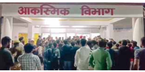
People gather outside the emergency ward after a fire broke out in the Neonatal Intensive Care Unit (NICU) of the Maharani Laxmi Bai Medical College, in Jhansi district.

between 8.30 am and 3 pm. Some of the pilots were not trained for CAT III operations due to which flights had to be diverted. Complying with the measures enforced under GRAP Stage IV, the Delhi traffic police imposed a total of 4,852 challans and 4,472 challans on the non-possession of Pollution Under Control (PUC) certificates on November 15 and 17 respectively. It also imposed 138 and 155 challans on End of Life Vehicles (ELVs) on November 15 and 17 respectively. The police also diverted 423 non-destined trucks on November 15 while the numbers were higher for November 17 as 545 such trucks were diverted in Delhi. In adherence to the measures, the police also imposed challans on 514 Light Motor Vehicles (LMVs) (BS III petrol and BS IV diesel) on November 15. The numbers rose about 100 per cent on November 17 as 1,130 such LMVs were issued challans. Continued on page 2