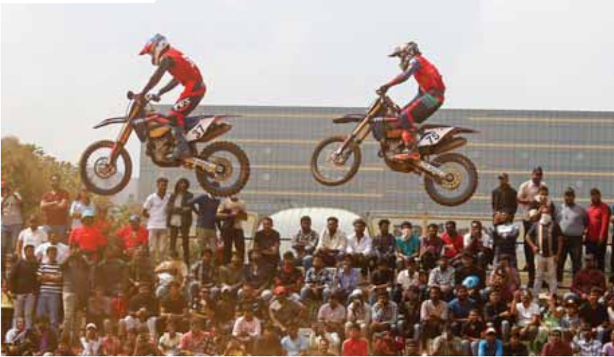
Riders take part in the MRF MOGRIP Supercross Championship 2024, in Bengaluru