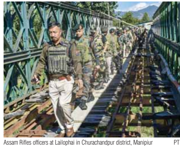
Assam Rifles officers at Laliohphai in Churachandpur district, Manipur.

PIONEER NEWS SERVICE ■ NEW DELHI / IMPHAL Union Home Ministry on Monday rushed 5,000 paramilitary troops to Manipur to assist the State Government in handling the current volatile situation. While 35 units will be drawn from the Central Reserve Police Force (CRPF), the rest will be from the Border Security Force (BSF). Home Minister Amit Shah reviewed the prevailing security situation and deployment of troops for the second consecutive day and directed top officials to focus on restoring peace and order there as early as possible. A total of 218 Central Armed Police Forces (CAPF) companies are now present in the State, which has been reeling from ethnic strife since May last year. The Home Minister took stock of the deployment of central forces there and directed the officials to restore peace and order there as early as possible, said officials. The situation in the Northeastern state, which has been reeling from ethnic strife since May last year, has been volatile following protests and violence after the recovery of bodies of women and children.