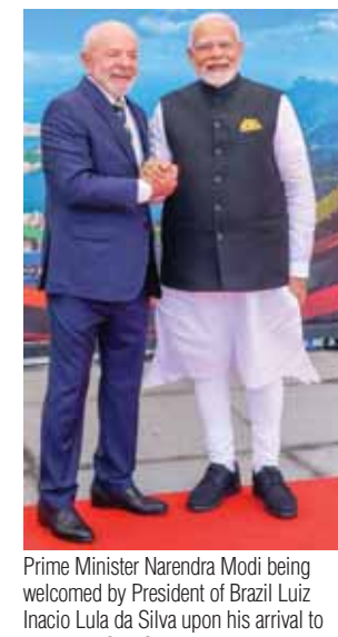
Prime Minister Narendra Modi being welcomed by President of Brazil Luiz Inacio Lula da Silva upon his arrival to attend the G20 Summit, in Rio de Janeiro, Brazil.

■ RIO DE JANEIRO The countries of the Global South are most adversely impacted by the food, fuel and fertilizer crisis caused by global conflicts and G20 must focus on addressing it, Prime Minister Narendra Modi said on Monday. In an address at a session at the G20 summit, Modi said India's G20 theme of "One Earth, One Family, One Future" is as relevant at the ongoing summit as it was last year. "I would like to say that countries of the Global South are most adversely impacted by the food, fuel and fertilizer crisis caused by global conflicts," he said. "So our discussions can only be successful when we keep in mind the challenges and priorities of the Global South," he added. The PM made the remarks at the G20 session on 'Social Inclusion and the Fight Against Hunger and Poverty'. Modi also called for reform of the institutions of global governance. "And just as we amplified the voice of the Global South by granting permanent membership of G20 to the African Union during the New Delhi summit, we will reform institutions of global governance," he said. The PM said India supports Brazil's initiative for a global alliance against hunger and poverty. "The people-centric decisions taken at the G20