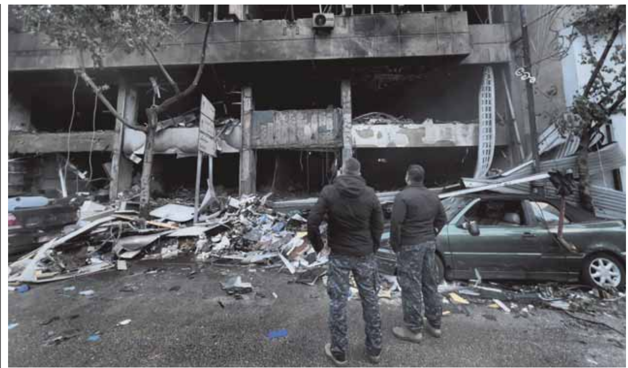
Lebanese policemen stand in front of destroyed shops that were hit Sunday evening in an Israeli airstrike in central Beirut, Lebanon on Monday.

tion "is to make sure the (Israeli) aggression fails to achieve its goals, while negotiation is for the state and the government". A Western diplomat familiar with the talks told The Associated Press there is a sense of "cautious optimism". "Diplomatic efforts are converging towards a cease-fire, but it's still in the hands and heads of key players to decide if it's in their interest or not to stop things right now," said the diplomat, who was not authorized to brief media and so spoke on condition of anonymity. The efforts are aimed at reestablishing a UN buffer zone in southern Lebanon established after the 2006 Israel-Hezbollah war.