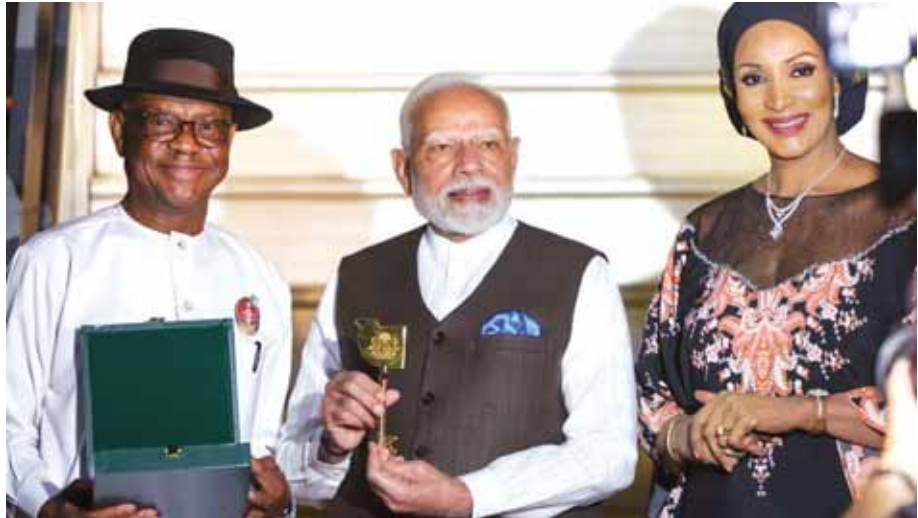
Prime Minister Narendra Modi being received by the Nigerian delegates upon his arrival at the airport, in Abuja, Nigeria, Sunday, Nov. 17, 2024. Modi on Sunday arrived in Nigeria on the first leg of his three-nation visit at the invitation of President Bola Ahmed Tinubu.

The PM also announced that India is sending 20 tonnes of relief supplies for Nigerian people hit by last month's floods. He also referred to the African Union becoming a permanent member of the G20 at the India-hosted summit of the grouping last year and