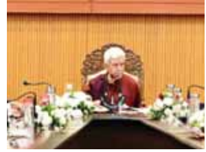
Sinha chaired a high-level security review meeting at the Jammu Convention centre, first after the shifting of the move offices in Jammu.