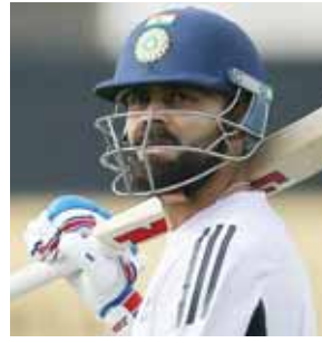
against New Zealand, you've got plenty of ammunition to back yourself up," Fox Cricket quoted McGrath as saying on 'CODE Sports'. "So put the pressure on them and see if they're up for it," he added. Kohli, who has been India's batting mainstay for over a

Pace legend Glenn McGrath feels Australia have the "ammunition" to target an "emotional" Virat Kohli, who will be under pressure if he gets off to a poor start at the five-match Test series for the Border-Gavaskar Trophy, starting in Perth from November 22. India have won the last four Test series against Australia, including two Down Under. However, they head into the much-anticipated five-Test assignment on the back of a 0-3 series whitewash at the hands of New Zealand at home. "Without a doubt, especially after coming off a 3-0 loss