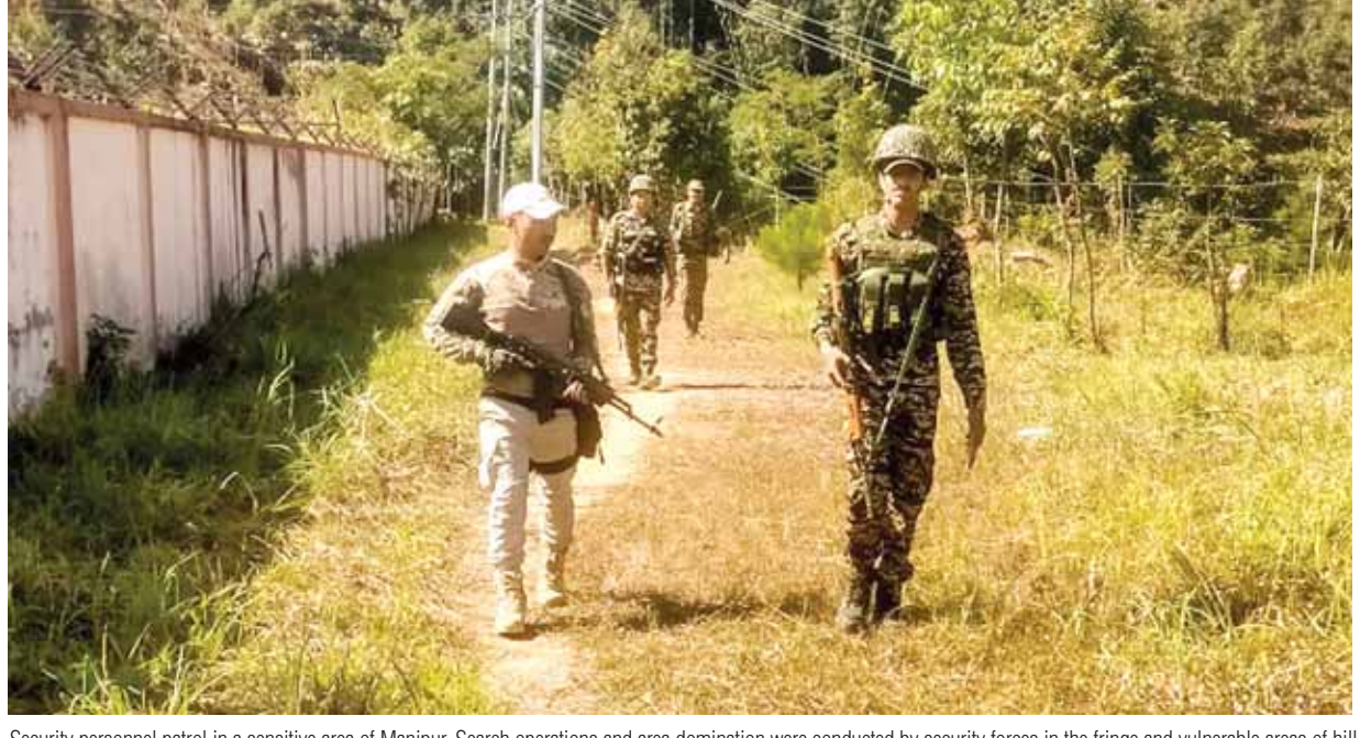
Security personnel patrol in a sensitive area of Manipur. Search operations and area domination were conducted by security forces in the fringe and vulnerable areas of hill and valley districts of the state

Amid escalating unrest in Manipur, Union Home Minister Amit Shah on Sunday cancelled all his rallies in poll-bound Maharashtra and returned to Delhi to hold a meeting to review the volatile situation.irate mobs set fire to the residences of three more Bharatiya Janata Party (BJP) legislators, one of whom is a senior Minister, and also the home of a Congress MLA in various districts of Imphal Valley, even as security forces foiled the attempt of agitators to storm the ancestral residence of Manipur Chief Minister N Biren Singh, officials said. Later in the evening, the Home Minister held a meeting with senior security and intelligence officials, and reviewed the Manipur situation. Meanwhile, Central Reserve Police Force (CRPF) chief Anish Dayal Singh reached Imphal on Sunday, to monitor and coordinate the security operations in the region. The fresh incidents of violent protests took place on Saturday night even as an indefinite curfew was clamped after people, agitated by the killing of three women and children each by militants in Jiribam district, attacked the residences of three state Ministers and six MLAs earlier on Saturday. Meanwhile, the Manipur Government has requested the Centre to review and withdraw AFSPA from areas falling under the jurisdiction of six police stations in the State. The Centre has reimposed the Armed Forces (Special Powers) Act, 1958 in Manipur's six police station areas, including violence-hit Jiribam. Union Ministry of Home