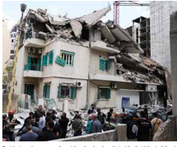
Residents and rescuers gather at the site of an Israeli airstrike that hit a building in central Beirut's Ras-el-Nabaa neighborhood, Lebanon, Sunday. AP

AP ■ TEL AVIV Israeli strikes in the Gaza Strip overnight killed 12 people, Palestinian medical officials said on Sunday. Israeli police meanwhile arrested three suspects after flares were fired at Prime Minister Benjamin Netanyahu's private residence in the coastal city of Caesarea. In Lebanon, Israeli warplanes pounded the southern suburb of Beirut after the military warned people to evacuate from several buildings. The Hezbollah militant group has a strong presence in the area, known as the Dahiyeh, and the strikes came as Lebanese officials are considering a United States-brokered cease-fire proposal. One of the strikes hit central Beirut for the first time in weeks. Netanyahu and his family were not at the residence when two flares were fired at it overnight, and there were no injuries, authorities said. A drone launched by Hezbollah struck the residence last month, also when Netanyahu and his family were away. The police did not provide details about the suspects behind the flares, but officials pointed to domestic political critics of Netanyahu. Israel's largely cere-