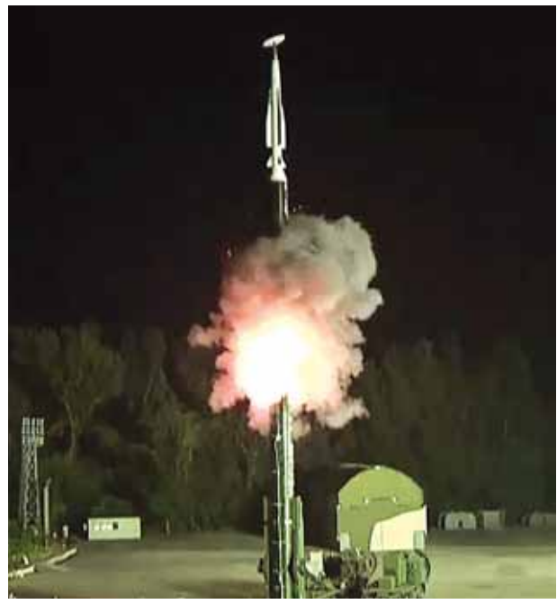
Flight trial of DRDO's long range hypersonic missile being successfully conducted at Dr. APJ Abdul Kalam Island, off-the-coast of Odisha