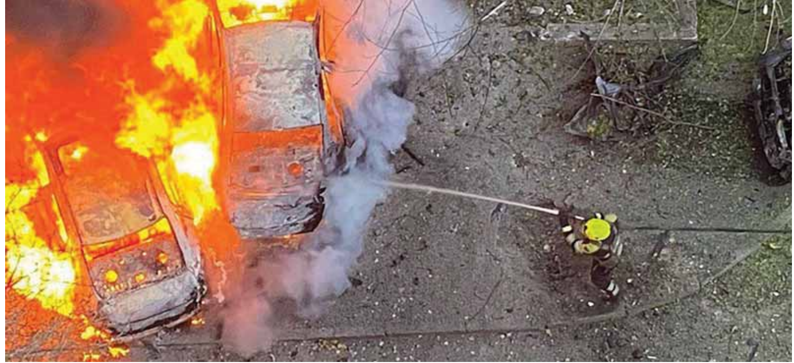
In this photo provided by the Ukrainian Emergency Service, emergency services personnel remove part of a Russian missile that hit an apartment house during massive missile attack in Kyiv, Ukraine, Sunday. AP/PTI

Western allies to bolster the country's air defences to counter assaults and allow for repairs. Explosions were heard across Ukraine on Sunday, including in capital Kyiv, the key southern port of Odesa, as well as the country's west and central regions, according to local reports. The operational command of Poland's armed forces wrote on X that Polish and allied aircraft, including fighter jets, have been mobilised in Polish airspace because of the "massive" Russian attack on neighbouring Ukraine. The steps were aimed to provide safety in Poland's border areas, it said. One person was injured after the roof of a five-story residential building caught fire in Kyiv's historic centre, according to Popko. A thermal power plant operated by private energy company DTEK was "seriously damaged", the company said.