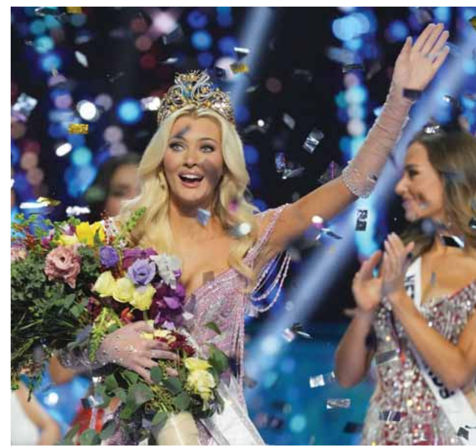
Miss Denmark Victoria Kjær Theilvig waves after winning the 73rd Miss Universe Beauty Pageant in Mexico City, on Saturday.

inflation in recent years, making it difficult for them to get by. The country is also a major source of irregular migration to Europe, with thousands leaving every year on rickety, artisanal fishing boats in search of economic opportunities. The campaign for the legislative election was marked by sporadic clashes between supporters of different parties. The headquarters of an opposition party were set on fire in the capital, Dakar, and clashes have erupted between supporters in central Senegal in recent weeks, the interior ministry said Monday. On Tuesday, Ousmane Sonko, the country's prime minister who helped catapult Faye to victory, denounced attacks against supporters of PASTEF in Dakar and other cities. "May each patriot they have attacked and injured be proportionally avenged. We will exercise our legitimate right to respond," he wrote on X, before back-peddalling and asking his supporters to remain peaceful in a speech later that day.