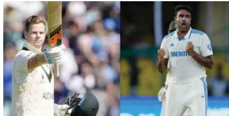
he wants to," he added. Ashwin's Test bowling average stands at a modest 42.15 in Australia compared to his home average of 21.57. Smith hoped to land the first blow on the 38-year-old to gain an early upper hand in the five-match series, beginning at Perth from November 22.

Australian batting talisman Steve Smith wants to adopt a proactive approach against Ravichandran Ashwin in the upcoming Border-Gavaskar Trophy to avoid his struggles against the Indian spinner during the 2020-21 series. Ashwin had nicked off Smith thrice during that rubber, and later in 2023 the Indian off-spinner dismissed the Aussie twice as he could only make 22 runs against his old foe. "I don't like getting out to off-spin in Australia. But he's also a very good bowler and he came in with some decent plans. There were a couple of occasions where he got on top of me," Smith told the Sydney Morning Herald. "But then I got on top of him at the SCG when I was a bit more proactive (Smith made 131 and 81 at Sydney). So, that's key for me. Just be proactive against him and not let him settle and bowl the way