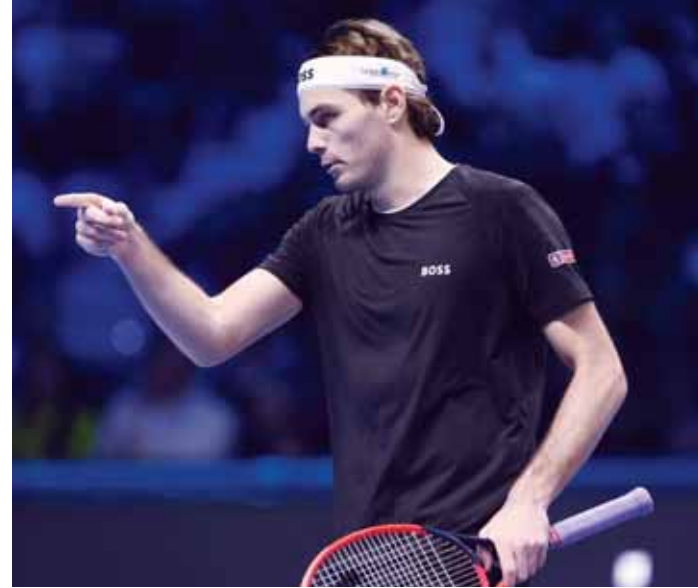
this week. "He's an uncomfortable player for me," Zverev said. "It's no secret." Fritz also beat Zverev at Wimbledon and the U.S. Open, plus the Laver Cup. Fritz will finish year at career high. Fritz was already assured of

different than group matches." Fritz trying to match Gauff. Fritz wins the trophy, it will mark an American sweep of the season-ending events after Coco Gauff won the WTA Finals last week. Fritz's run in New York made him the first American man to reach a Grand Slam singles final in 15 years. He's playing at the ATP Finals for the second time. On debut two years ago, he beat Rafael Nadal in his opener and made it to the semifinals, losing to Novak Djokovic. "It's awesome to come back and already go a step further," Fritz said. "I'm all about always trying to do better than the year before." At the start of the week, Fritz told The Associated Press his "career has always been a very steady progression and just improving a little bit each year." Fritz has Zverev's number. It was Fritz's fourth consecutive victory over Zverev, who replaced Carlos Alcaraz at No. 2 in the rankings