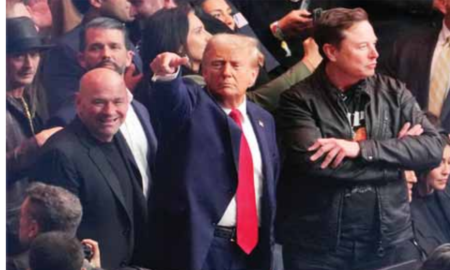
President-elect Donald Trump attends UFC 309 at Madison Square Garden, Saturday in New York, with Kid Rock, Donald Trump Jr., Dana White and Elon Musk.

President-elect Donald Trump has selected Chris Wright, a campaign donor and fossil fuel executive, to serve as energy secretary in his upcoming, second administration. CEO of Denver-based Liberty Energy, Wright is a vocal advocate of oil and gas development, including fracking, a key pillar of Trump's quest to achieve US "energy dominance" in the global market. Wright has been one of the industry's loudest voices against efforts to fight climate change and could give fossil fuels a boost, including quick action to end a year-long pause on natural gas export approvals by the Biden administration. Wright also has criticised what he calls a "top-down" approach to climate by liberal and left-wing groups and said the climate movement around the world is "collapsing under its own weight". Wright, who has never served in government, has written that more fossil fuel production is needed around the globe to lift people out of poverty. Consideration of Wright to head the administration's energy department won support from influential conservatives, including oil and gas tycoon Harold Hamm. Hamm, executive chairman of Oklahoma-based Continental Resources, a major shale oil company, is a longtime Trump supporter and advisor who played a key role on energy issues in Trump's first term. Hamm helped organise an event at Trump's Mar-a-Lago resort in April where Trump