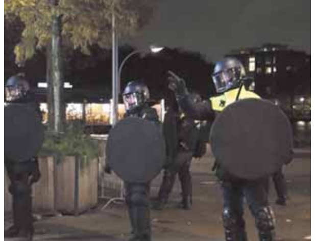
In this image taken from video, police officers patrol in riot gear on the streets of Amsterdam as the city is facing tensions following violence last week.

A senior police officer warned Tuesday of calls for more rioting in Amsterdam, after dozens of people armed with sticks and firecrackers set a tram on fire Monday night as the city faces tensions following violence last week targeting fans of an Israeli soccer club.