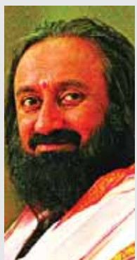
Sri Sri Ravi Shankar Spiritual Guru

H APPINESS is the one thing that everybody is seeking. People do find happiness but it is momentary; for couple of hours or days. True happiness is when you find inner stability and comfort. You know you are connected to something unimaginably bigger and that there is an unshakable power within you. Here are a few pointers to ensure that happiness simply wells up in you. HEALTH: In India, "swastha" refers to one who is established in oneself. A healthy person has a smile on the face, love in the heart and strength and vitality in the body. Seeing life with the eyes of wisdom makes negative emotions go away and you start smiling from the core of your being. ATTACHMENTS: These cause feverishness that take away peace of mind. You are in pieces and fall prey to misery. Your first step is directing your attachment to the Knowledge and the Divine. Your