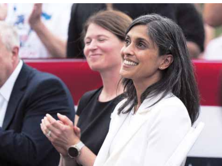
Usha Vance smiles as her husband Republican vice presidential nominee Sen. JD Vance, R-Ohio, speaks at a campaign rally on Friday in Selma, NC.

Residents of Israel's northern communities near Lebanon, roughly 60,000 people, have also been displaced for more than a year. Israel has also stepped up its offensive against Hamas' remaining fighters in Gaza, raising concerns about humanitarian conditions for civilians still there.