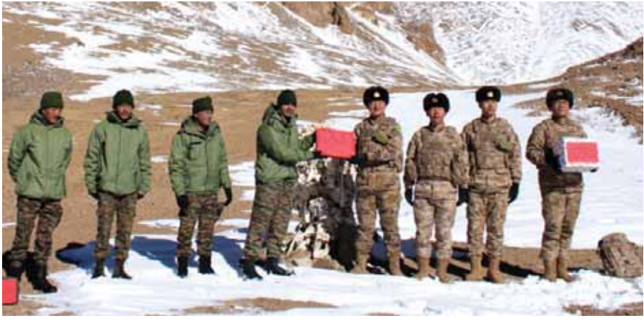
Indian and Chinese Troops Exchange Sweets Amid Border Disengagement Progress

The following day, Indian Chinese troops exchanged sweets at several border points along the Line of Actual Control (LAC) on the occasion of Diwali. The traditional practice was observed a day after both the countries completed troop disengagement at the two friction points, bringing a fresh thaw in India-China