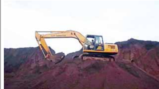
PTI ■ NEW DELHI

The production of iron ore, I manganese ore and primary aluminium increased in the first six months of the ongoing financial year, government data showed. per provisional data, production of iron ore rose 5.5 per cent to 135 million