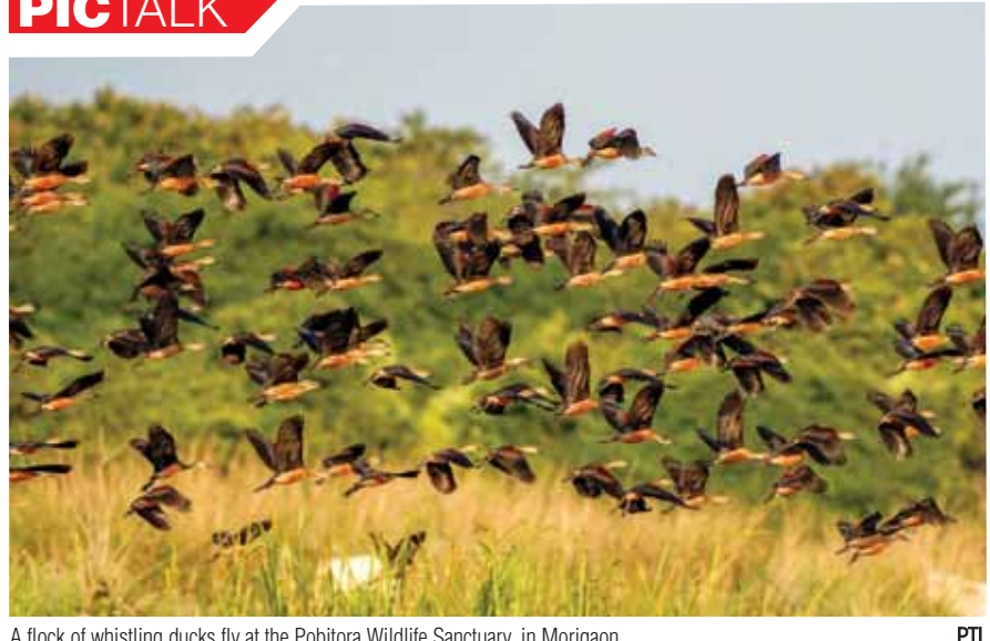
A flock of whistling ducks fly at the Pobitora Wildlife Sanctuary, in Morigaon

claimed tens of thousands of lives. There is no let up in Israel's attacks on Gaza where the human crisis is getting worse. The fighting extended to Israel's northern border when Hezbollah escalated its attacks, prompting Israel to retaliate. While the ceasefire offers a glimmer of hope, challenges loom large. The success of the agreement depends on its strict implementation, particularly the disarmament of militias in Lebanon. The Lebanese government, already struggling with economic and political crises, will face immense pressure to assert its authority over Hezbollah, a deeply entrenched and well-armed organisation. Whatever the reasons for this truce but it definitely gives peace a chance. The agreement's implications for regional peace are profound. If upheld, it could reduce tensions along Israel's northern border, allowing displaced civilians to return home and facilitating humanitarian relief in affected areas. For Lebanon, the deal could bolster its sovereignty by curbing the influence of armed non-state actors, potentially paving the way for greater stability. However, unresolved issues, including the ongoing Israel-Hamas conflict and tensions with Iran, continue to pose risks to lasting peace. The role of the US, France, and UNIFIL will be critical to ensuring compliance and rebuilding trust.