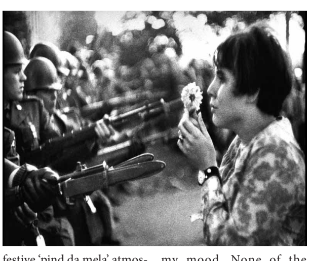
festive 'pind da mela' atmos-

I was thrilled beyond words. That day, under a gentle winter sun, I took my seat near the massive gate where the ceremony unfolds. It was a spectacle to beholdsmartly dressed soldiers marching in perfect sync on both sides of the border. The crowd was electric, brimming with patriotic fervor, singing Bollywood Law enforcement turned a move from being a passive songs, and soaking in the