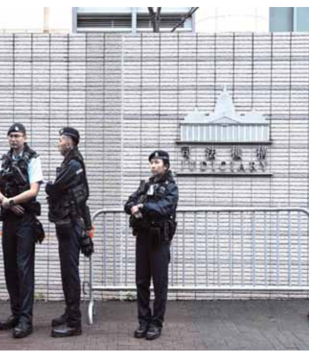
Police officers stand guard outside the West Kowloon Magistrates' Courts in Hong Kong on Tuesday.

academic exercise and that the Scheme was absolutely untenable," the judgment read. "In order to succeed, the organisers and participants might have hurdles to overcome, that however was expected in every subversion case where efforts were made to overthrow or paralyse a government."