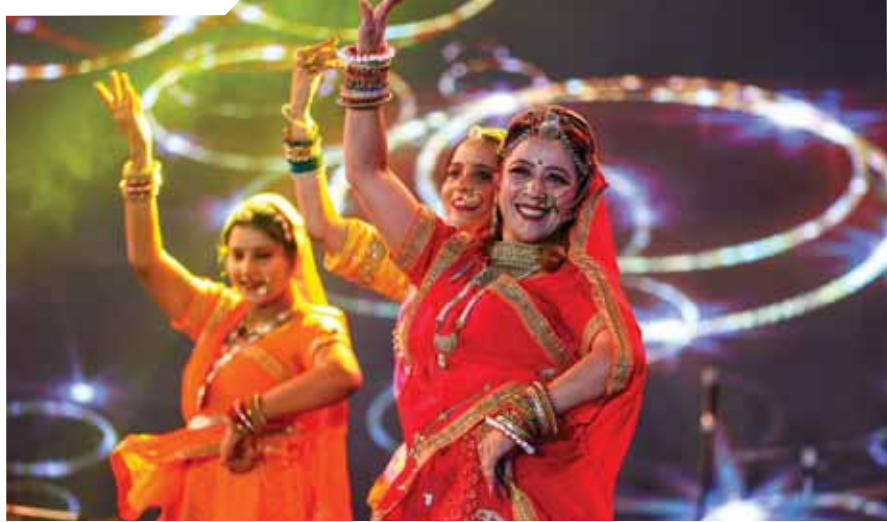
Folk dancers perform during the celebration of the 297th foundation day of 'Pink City', Jaipur