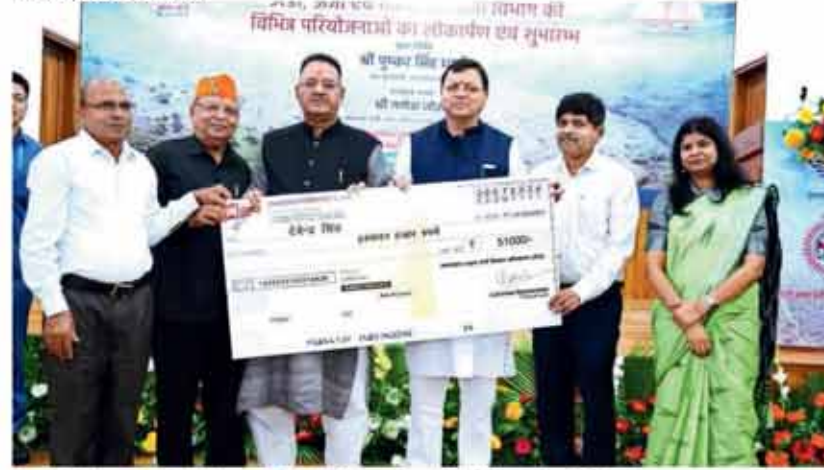
>>> Pushkar Singh Dhama, CM, Uttarakhand; R Meenakshi Sundaram, secretary energy; and other dignitaries participating at UREDA event

The Uttarakhand State Solar Policy 2023 is evidence of our dedication to a sustainable and profitable tomorrow. By harnessing the power of solar energy, we strive to not only secure our energy requirements but also encourage economic development and create multiple livelihood prospects, especially for the youth and women. Our vision is to make Uttarakhand a forerunner in clean energy, assuring a brighter, greener future for all.