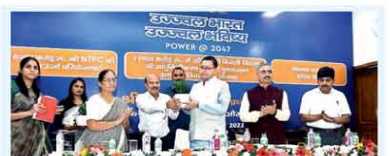
>>> Pushkar Singh Dhama, CM, Uttarakhand; R Meenakshi Sundaram, secretary energy; and other dignitaries inaugurating power projects

reflecting an impressive increase of nearly 22%. Additionally, the availability of machinery has improved from 73.67% to 77.5%, ensuring more reliable power supply. Financially, the RMU project is projected to significantly enhance revenue. Previously generating around Rs 57 crore annually, the Tiloth Power House is now expected to yield approximately Rs 97 crore—a potential increase of Rs 40 crore. This uptick in production and revenue is set to not only bolster the financial health of UJVN but also contribute positively to the state's economy. CM Dhama emphasized the importance of such initiatives in strengthening the state's power supply system, asserting that the advancements in infrastructure will ultimately benefit both the corporation and the residents of Uttarakhand. The successful implementation of RMU works at Tiloth Power House marks a significant step forward.