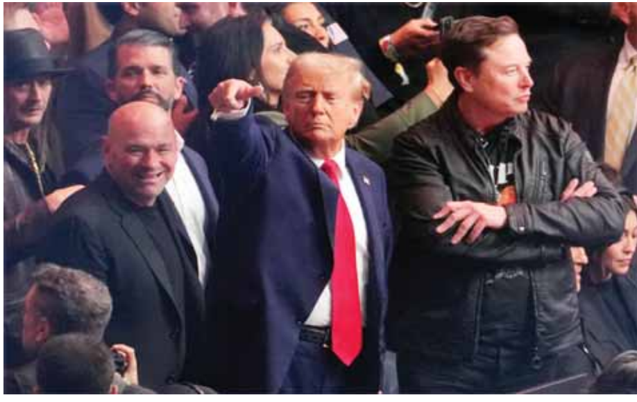
President-elect Donald Trump attends UFC 309 at Madison Square Garden, Saturday in New York, with Kid Rock, Donald Trump Jr., Dana White and Elon Musk.

President-elect Donald Trump has selected Chris Wright, a campaign donor and fossil fuel executive, to serve as energy secretary in his upcoming, second administration.