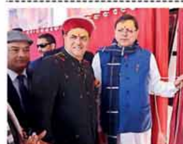
>>> Pushkar Singh Dhama, CM, Uttarakhand, inaugurates RMU works at Uttarkashi

urban areas and 23:28 hours per day in rural areas. UPCL's dedication to quality and governance is evidenced by its various certifications and awards, including NABL certification for its test laboratories and ISO 9001:2015 certification for its corporate office. These efforts highlight UPCL's dedication to providing reliable electricity and driving Uttarakhand's socio-economic growth.