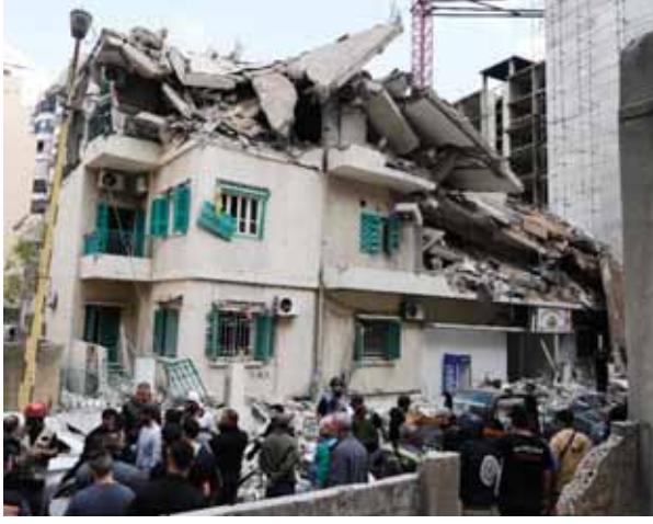
Residents and rescuers gather at the site of an Israeli airstrike that hit a building in central Beirut's Ras-el-Nabaa neighborhood, Lebanon, Sunday.

Israeli strikes in the Gaza Strip overnight killed 12 people, Palestinian medical officials said on Sunday. Israeli police meanwhile arrested three suspects after flares were fired at Prime Minister Benjamin Netanyahu's private residence in the coastal city of Caesarea.