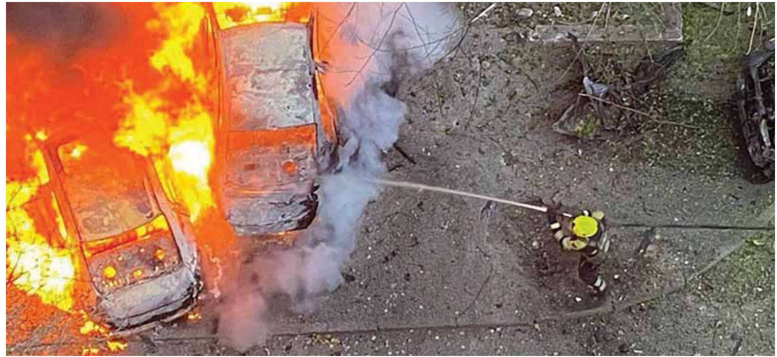
In this photo provided by the Ukrainian Emergency Service, emergency services personnel remove part of a Russian missile that hit an apartment house during massive missile attack in Kyiv, Ukraine, Sunday. AP/PTI

Western allies to bolster the country's air defences to counter assaults and allow for repairs. Explosions were heard across Ukraine on Sunday, including in capital Kyiv, the key southern port of Odesa, as well as the country's west and central regions, according to local reports. The operational command of Poland's armed forces wrote on X that Polish and allied aircraft, including fighter jets, have been mobilised in Polish airspace because of the "massive" Russian attack on neighbouring Ukraine. The steps were aimed to provide safety in Poland's border areas, it said. One person was injured after the roof of a five-story residential building caught fire in Kyiv's historic centre, according to Popko. A thermal power plant operated by private energy company DTEK was "seriously damaged", the company said.