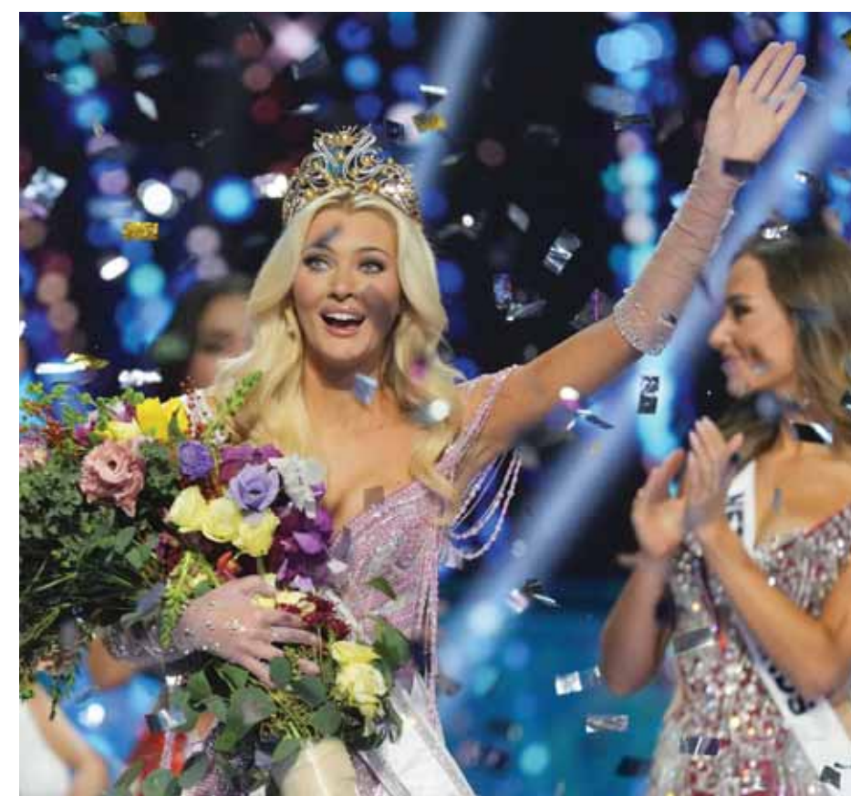
Miss Denmark Victoria Kjaer Theilvig waves after winning the 73rd Miss Universe Beauty Pageant in Mexico City, on Saturday.

inflation in recent years, making it difficult for them to get by. The country is also a major source of irregular migration to Europe, with thousands leaving every year on rickety, artisanal fishing boats in search of economic opportunities. The campaign for the legislative election was marked by sporadic clashes between supporters of different parties. The headquarters of an opposition party were set on fire in the capital, Dakar, and clashes have erupted between supporters in central Senegal in recent weeks, the interior ministry said Monday. On Tuesday, Ousmane Sonko, the country's prime minister who helped catapult Faye to victory, denounced attacks against supporters of PASTEF in Dakar and other cities. "May each patriot they have attacked and injured be proportionally avenged. We will exercise our legitimate right to respond," he wrote on X, before back-peddalling and asking his supporters to remain peaceful in a speech later that day.